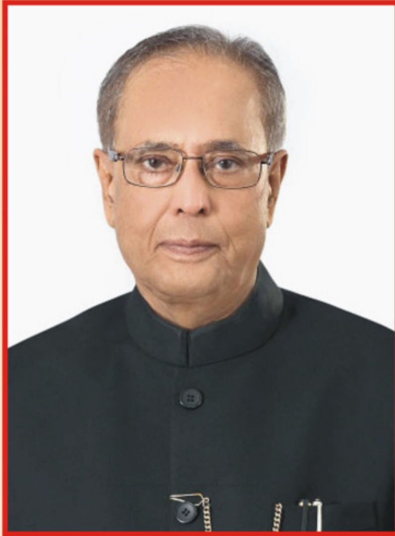
Hon'ble Shri Pranab Mukherjee Our President