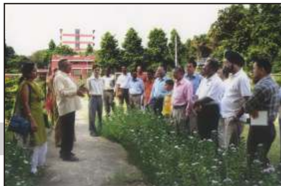
A field demonstration to the students at the Indian Meteorological Department (IMD)

IRCS is equipped with basic infrastructure facilities like Disaster Management Center, Class Rooms, Central Training Institute in Bahadurgarh, Internet facilities, Site Maps, Water Sanitation Units, Mobile Health Units, etc. for field studies.