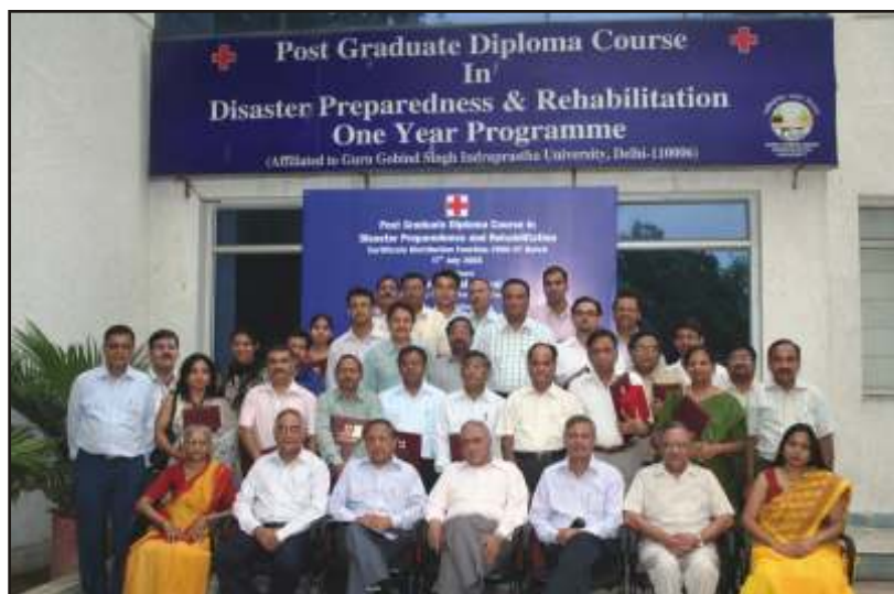
Certificate Distribution Function 2006-07 Batch

IRCS has seminar halls in DMC in NHQ main building with a capacity of about 60, equipped with multimedia and air conditional facilities and an auditorium in Bahadurgarh with the capacity of about 100.