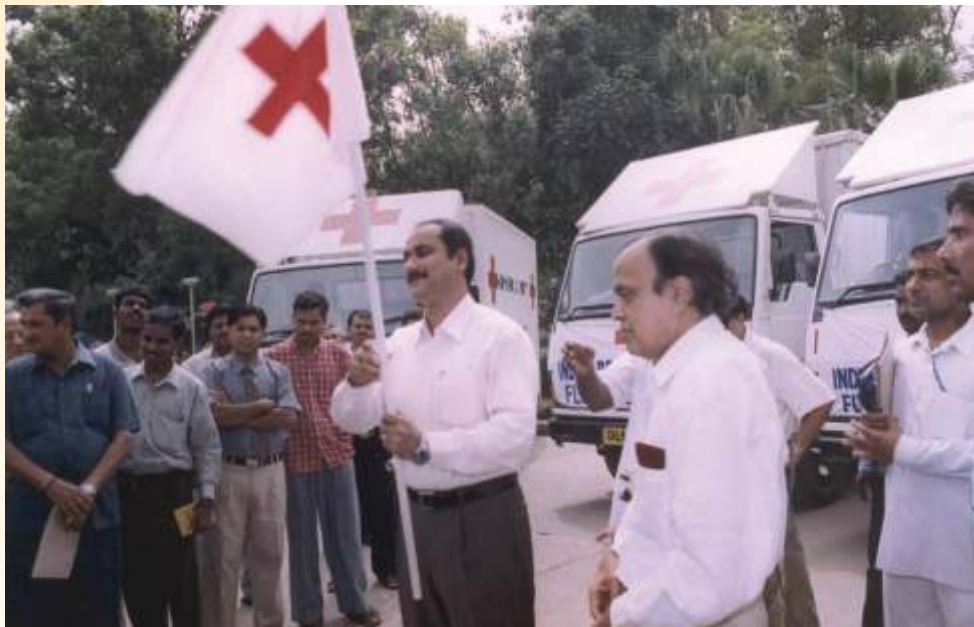
Hon'ble Chairman (IRCS) & Health and Family Welfare Minister Dr. Anbumani Ramadoss and former Vice Chairman (IRCS), Sh. Murli Deora, flagging off a relief consignment for flood victims. (File Photo)

They inspire, encourage and initiate at all times all forms of humanitarian activities so that human suffering can be minimized, alleviated and even prevented... and thus contribute to creating a more congenial climate for peace.