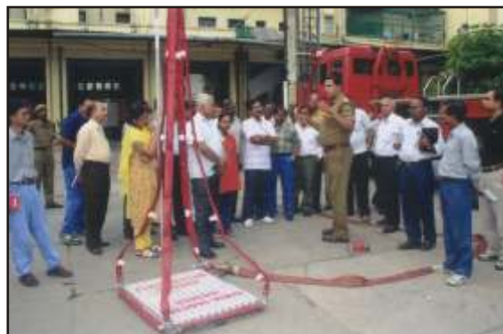
A field demonstration to the students at the Delhi Fire Service Station.

IRCS has a well equipped library having books related to Disaster Preparedness and management studies.