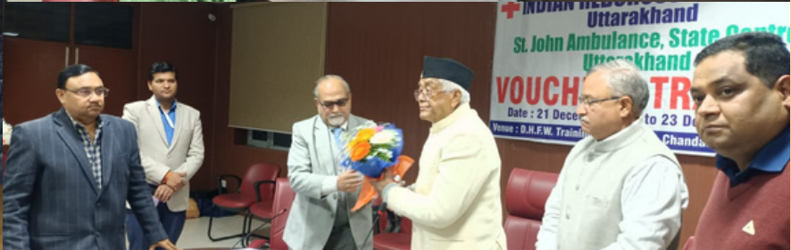
IRCS, Uttarakhand state branch held three days vouchers training at Dehradun, Uttarakhand