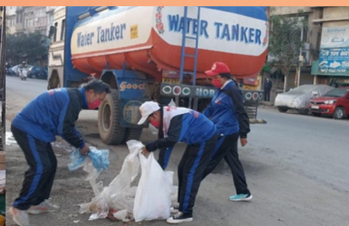
JRC Manipur, team participated in the National Youth Exchange Program at Amritsar (24-29 Dec 2022). In another activity JRC volunteers conducted a plastic-free campaign around the state branch office at Imphal.