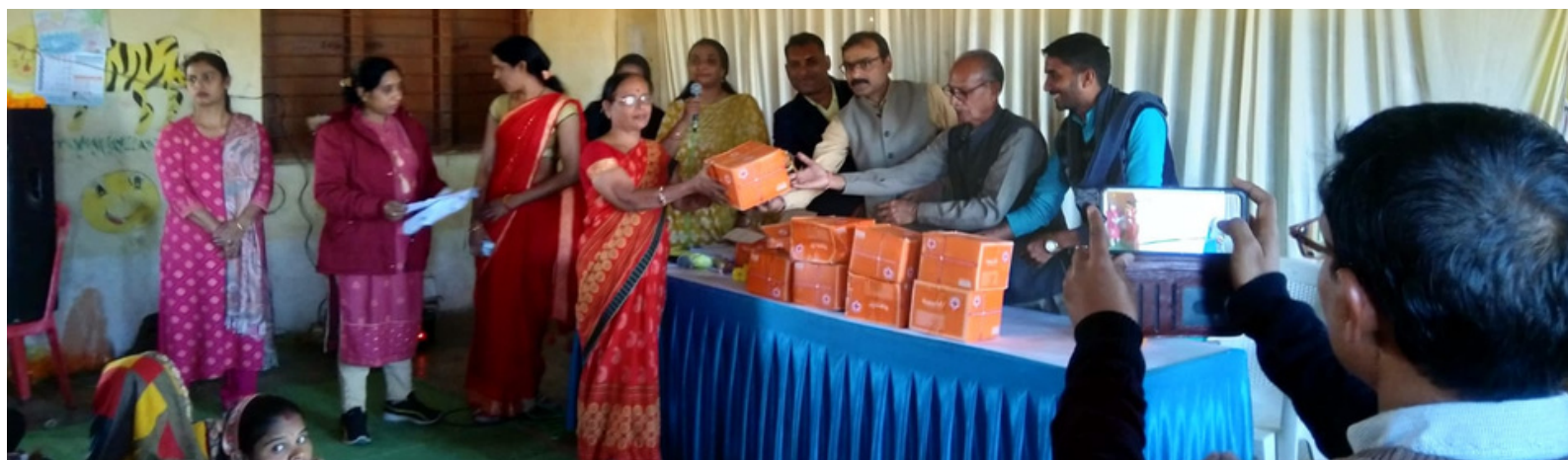
Distribution of hygiene kits, Bhopal, M.P