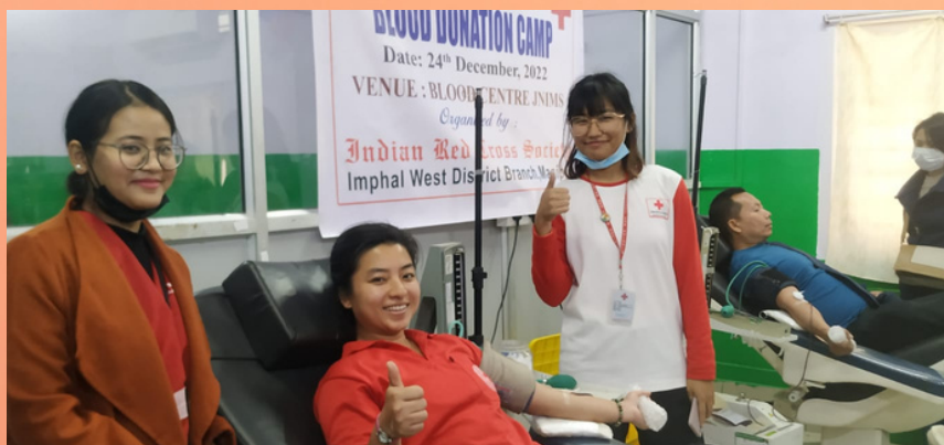
Blood Donation Camp, Imphal West District Branch, Manipur