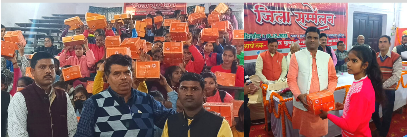
Distribution of hygiene kits, Ballia, Uttar Pradesh