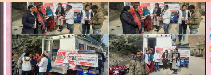
TB awareness program by district Red Cross Branch, Ambala