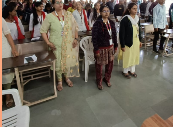
World Disability Day was celebrated by Youth Red Cross at D. Y Patil College, Pune. 80 Students, Teachers and Staff attended the program