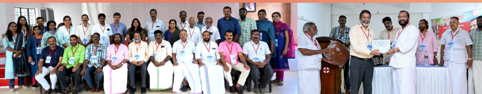
The District Coordinators of Junior Red Cross gathered at Kottayam, Kerala and discussed about the Red Cross syllabus for the next academic year.