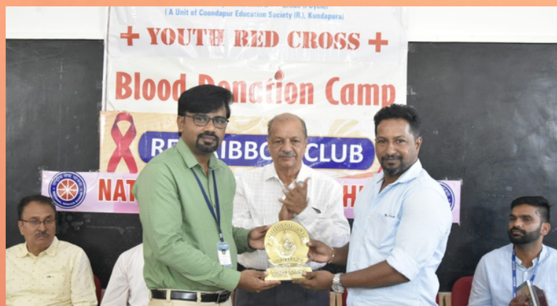
Blood Donation Camp, Kundapura, Karnataka