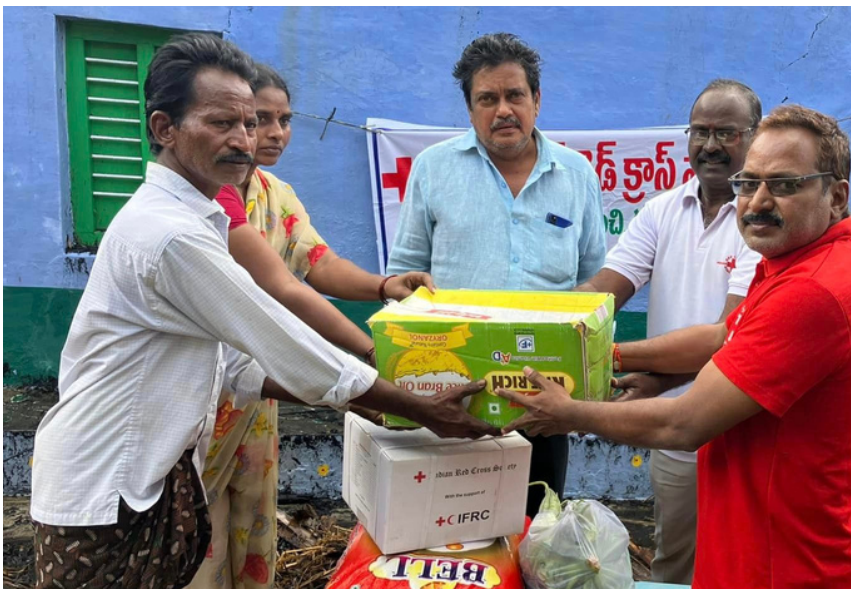
Distribution of relief items to fire victims by Avanigadda Red Cross branch, A.P