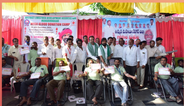
Blood Donation Camp, Mahabubnagar, Telangana