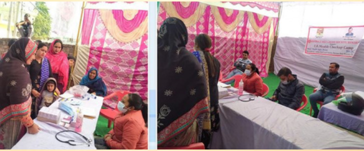
TB /Health check up camp, Shastri Nagar, Rewari, Haryana