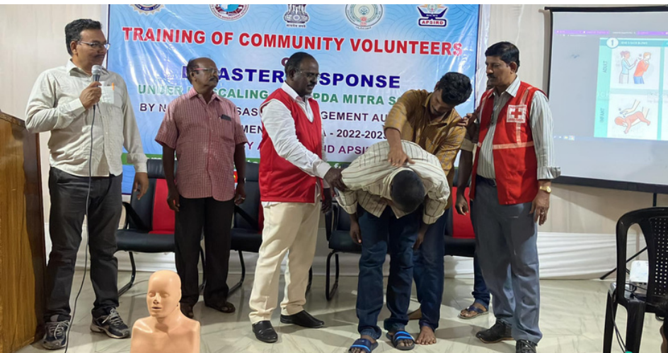
Training of Community volunteers on disaster response, Delhi