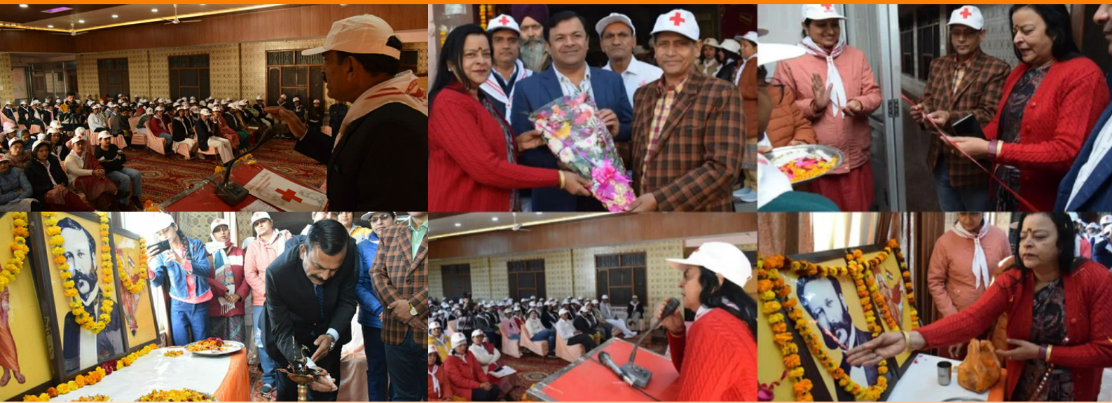
IRCS Haryana state branch organised 6 days state-level junior training camp for girls at Shri. Nangli Bela Ashram, Bhupatwala, Rishikesh Road, Haridwar. 136 juniors and 28 counselors from several districts of Haryana participated in the training program.