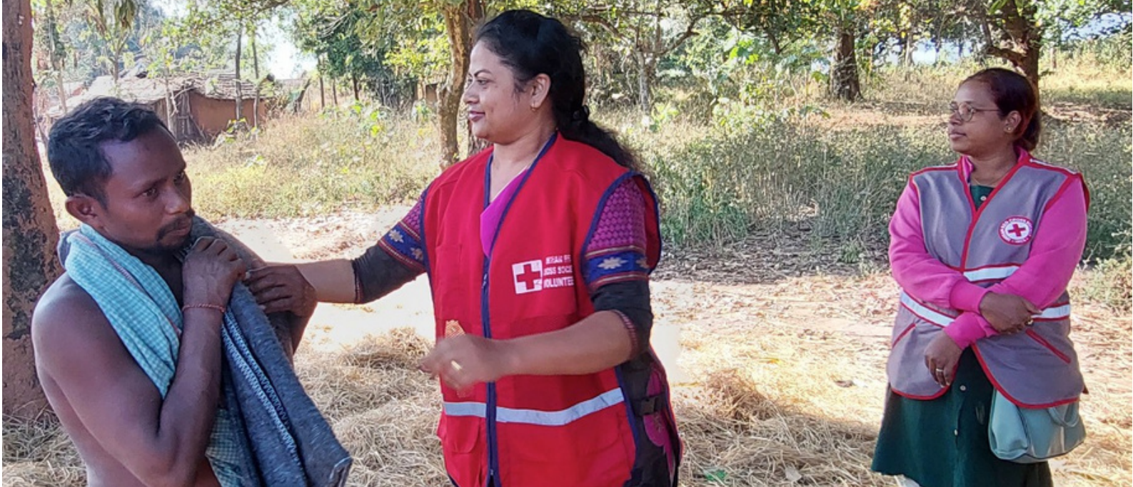
Distribution of blankets to needy & vulnerable, Keonjhar, Odisha