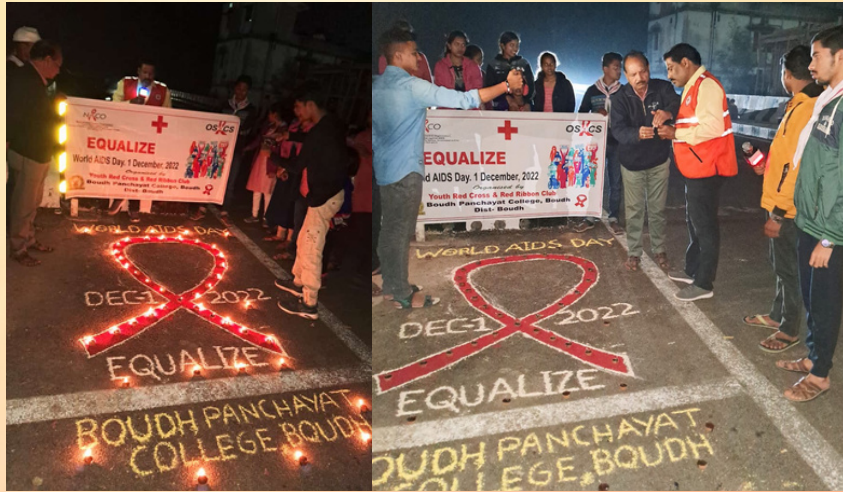
WORLD AIDS DAY, Boudh, Odisha