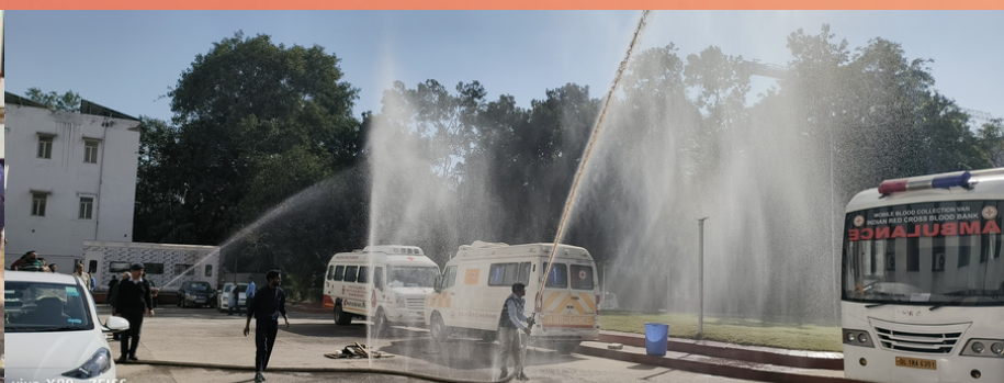
A mock drill on fire safety was held at IRCS, NHQ on 14th Dec, 2022. The officers and staff members of the Ministry of Health & Family Welfare, IFRC and IRCS witnessed and participated in the Mock Drill