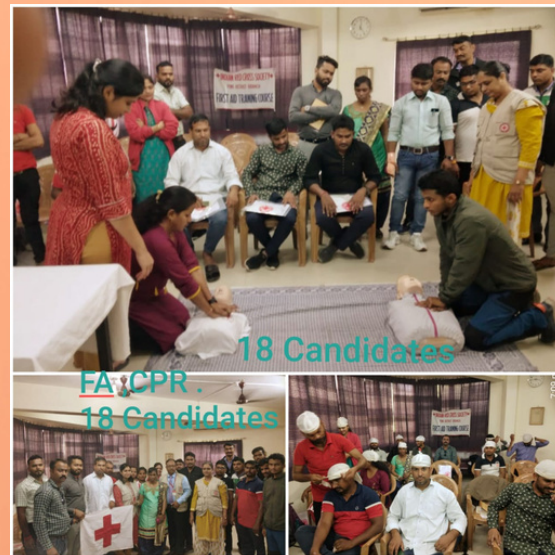
First aid & CPR training, Pune, Maharashtra