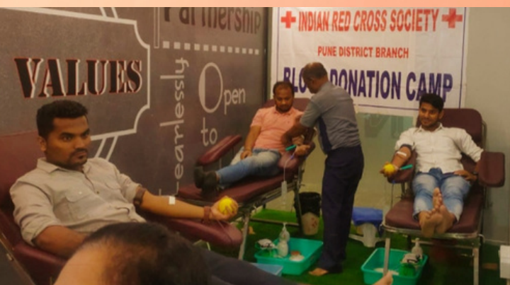
Blood Donation Camp, Pune, Maharashtra