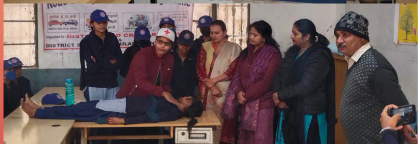
Road Safety Awareness Program, Pawal, Haryana