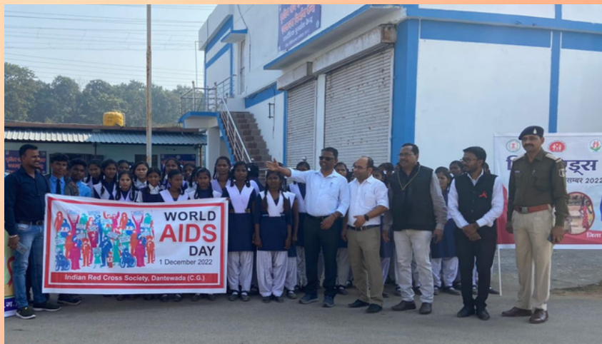
WORLD AIDS DAY, Dantewada, Chhattisgarh