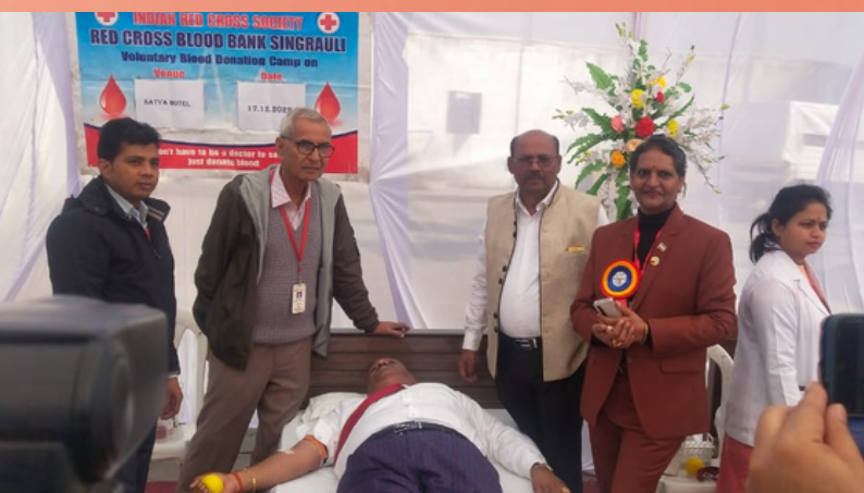
Blood Donation Camp, Singrauli, M.P