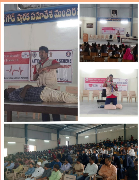
IRCS, Kamareddy district branch, Telangana conducted Youth Red Cross and Basic First Aid Awareness training