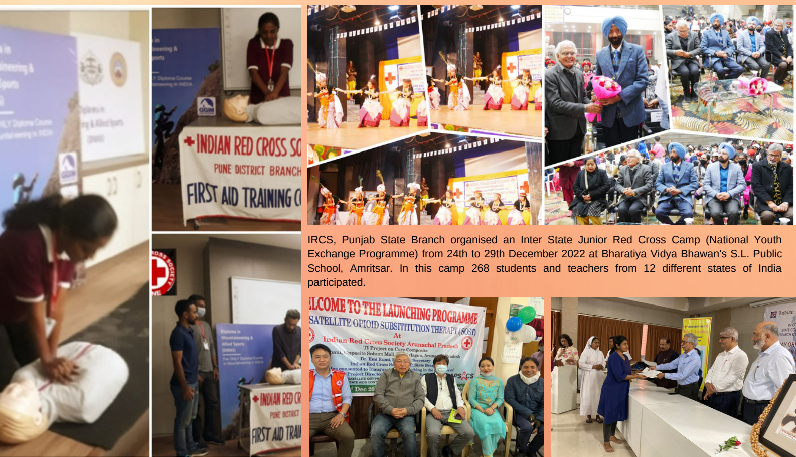
First aid and CPR workshop was held for 24 students of Diploma in Mountaineering, organized by Pune University and GGIM (Giripremi ) on 24 th Dec 22