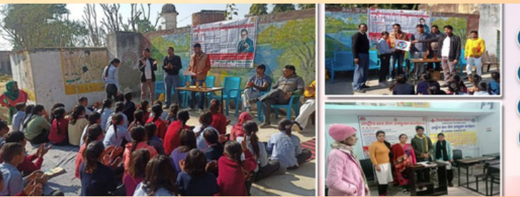
TB eradication awareness rally, Narnaul, Haryana