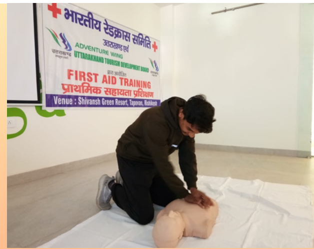
State Red Cross Branch, Uttarakhand, organized first aid training at Adventure Wing Uttarakhand Tourism Development Board, Rishikesh