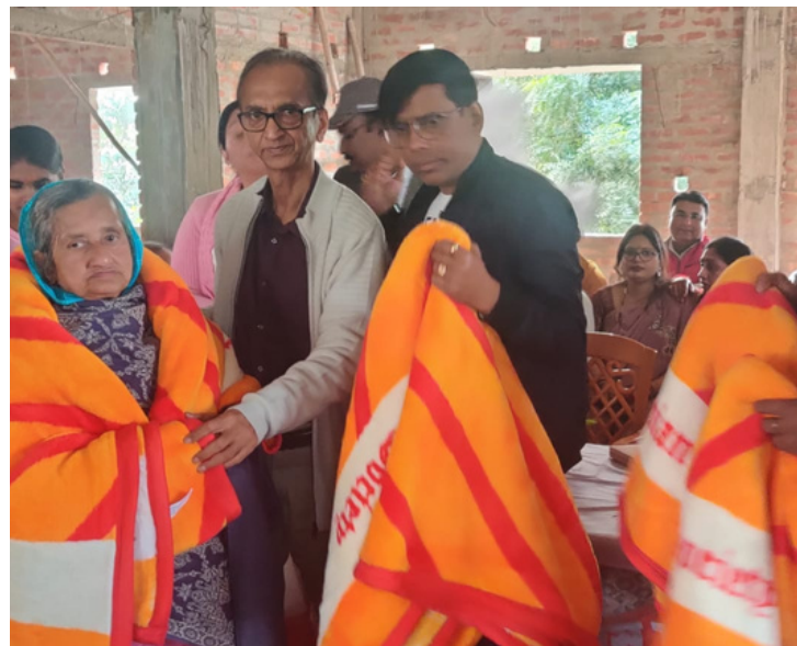
Distribution of blankets, Katihar, Bihar