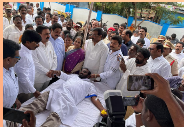
On the Birthday of the Chief Minister of Andhra Pradesh, Sh. Y S Jaganmohan Reddy, several blood donation camps were held across Andhra Pradesh.