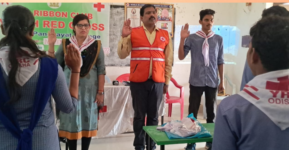
One day training program on Red cross history, movement, principles, objectives, emblem and volunteerism to the YRC volunteers in Boudh Panchayat College, Boudh Odisha