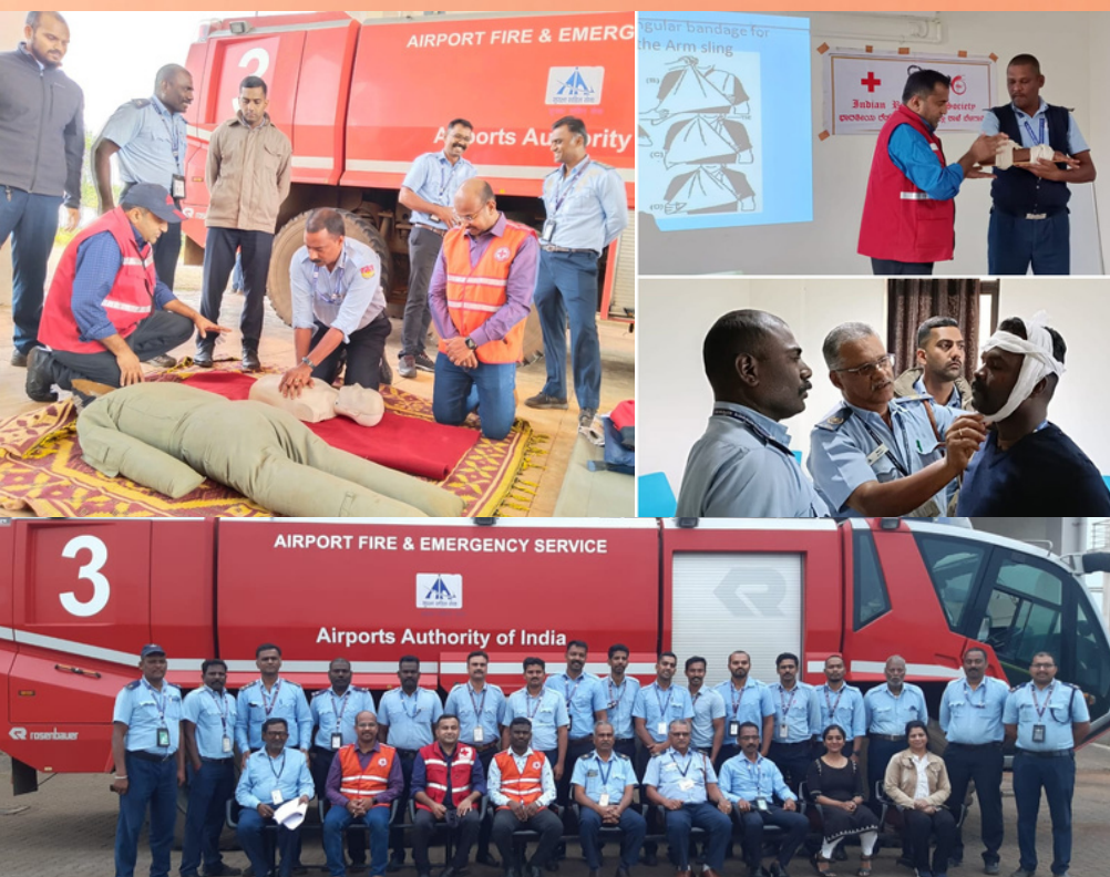
Training was provided to the officials of Airport Fire and Emergency services at Belgaum Airport, Karnataka