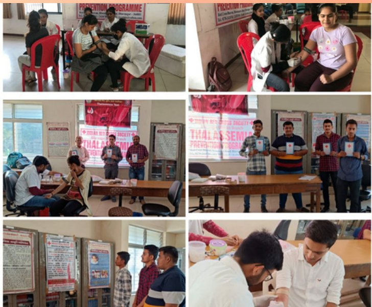
Thalassemia prevention program was held at Bhavnagar, Gujarat