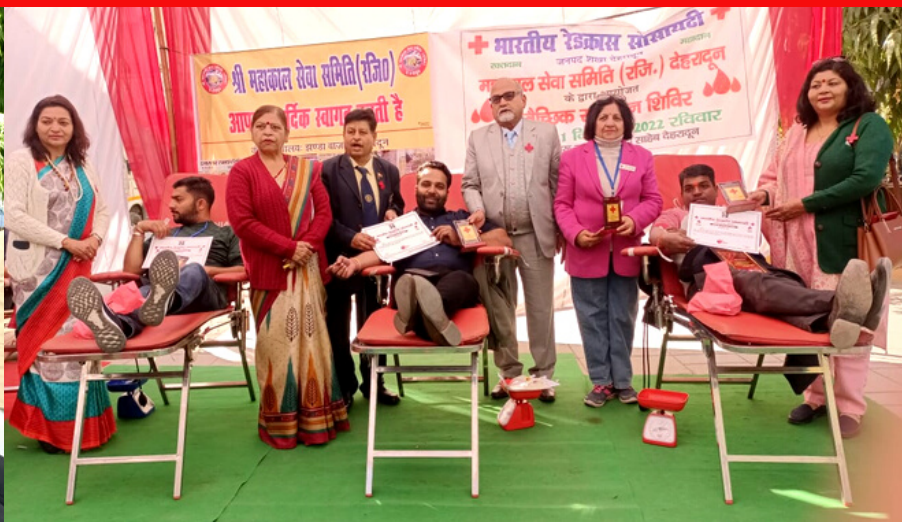
Blood Donation Camp, Dehradun, Uttarakhand