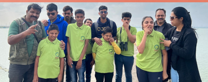
A picnic and bird watching program at Sukhna reservoir near Aurangabad, Maharashtra was organised for special kids of Aarambh Autism center