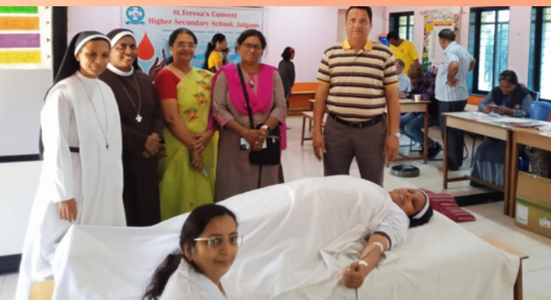
Blood Donation Camp, Jalgaon, Maharashtra