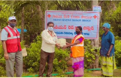
Sanitizer, Surgical Masks, Gloves, Soaps, and a Sachet of Ayush Kudineer (immunity- booster) was distributed to Sanitary Workers of Tirupati Municipal Corporation- Andhra Pradesh