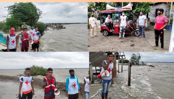
Rescue & restoration operations underway in Odisha & West Bengal Cyclone YAAS-hit areas. IRCS team has evacuated thousands of people to safer zones. Dry food along with water, masks, & matchboxes have been distributed to the Vulnerable

Volunteers from IRCS West Bengal are evacuating vulnerable people