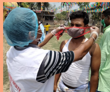
Masks Distribution - Karimpur Block- IRCS- West Bengal