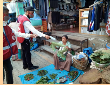
Masks distribution - village market-Assam