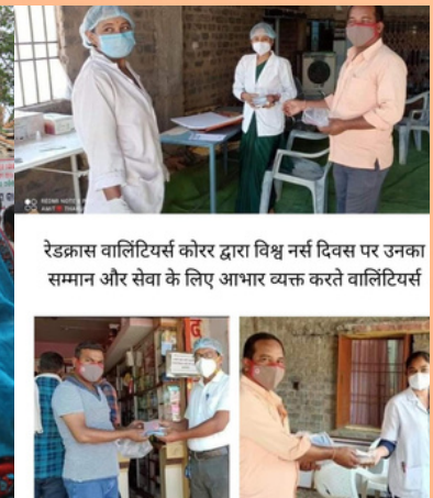
रेडक्रास वालंटियर्स कोरर द्वारा विश्व नर्स दिवस पर उनका सम्मान और सेवा के लिए आभार व्यक्त करते वालंटियर्स