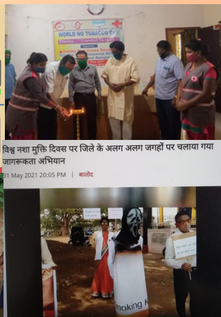
World No Tobacco Day Balod, Chhattisgarh