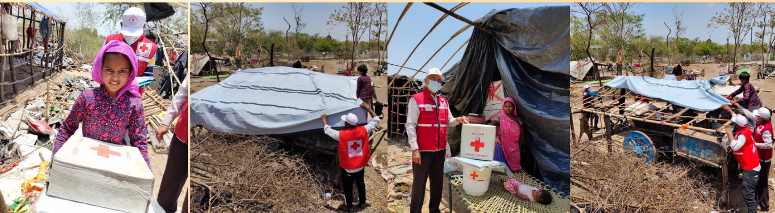
IRCS, Amreli District branch with support from Gujarat State Branch distributed Relief Materials including Tarpaulins, Utensils Set, Buckets & Hygiene kits to a total no. of 47 families affected with CycloneTauktae.11 active Red Cross Volunteers carried out the distribution.

CYCLONE TAUKTAE and YAAS gave a double blow for communities already facing COVID-19 pandemic in India. Indian Red Cross Society will keep supporting the people affected.