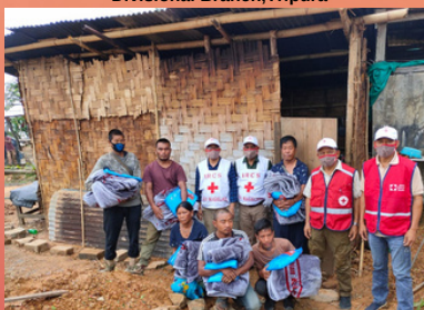
Distribution of relief items to fire victims, Nagaland