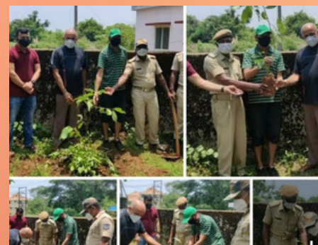
Plantation drive, Homeguard office, Mangalore, Karnataka