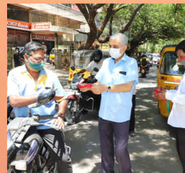
Distribution of Masks-Chennai ,Tamilnadu