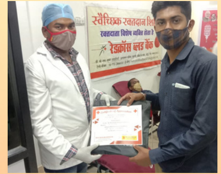
Donor Certificate being given, Blood Donation Camp, Gariyabad, Chhattisgarh