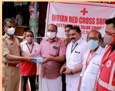
Distribution of Soaps and Masks-Kerala