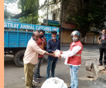
Distribution of Food Packets- Hyderabad ,Telangana