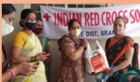
IRCS Pune gave 25 ration kits each costing RS 1000 to 25 house maids in Hadapsar area who lost livelihood due to covid 19 pandemic.-Maharashtra