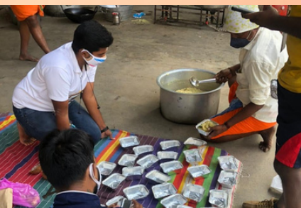
GIVE BACK Team, Thumakuru, Karnataka provided cooked food