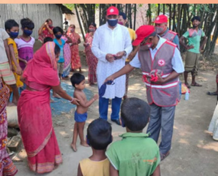
Distribution of Masks- Tehatta, West Bengal