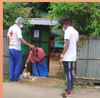
Distribution of Medicines-Sonamura ,Tripura