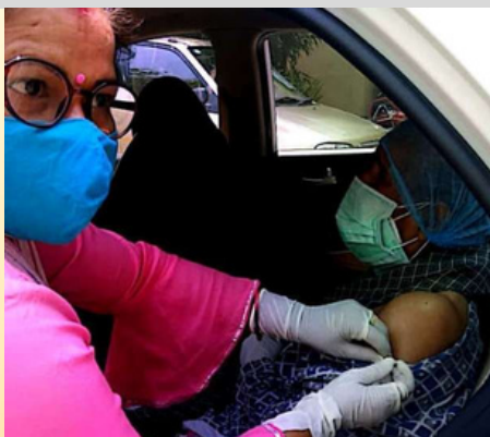
Vaccination in a car- Haridwar, Uttarakhand