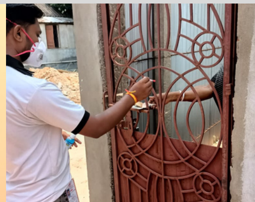
Distribution of medicines door to door -Sonamura sub divisional branch, Sepahijala Tripura