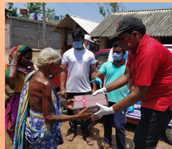
Distribution of HP kits- Odisha