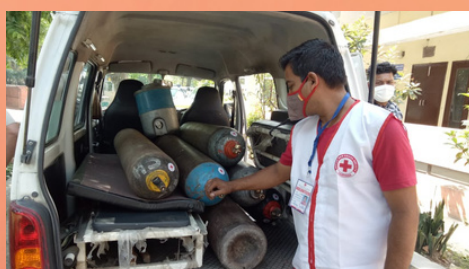
In Haryana home delivery of oxygen cylinders is being done by the Red Cross