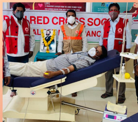
Blood Donation Camp at Bagalkote, Karnataka