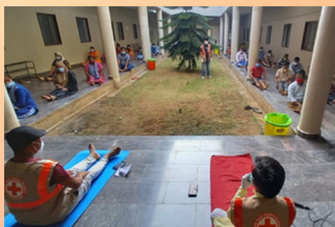
IRCS Koppal conducted YOGA and Pranayama for Covid patients at their Covid Care Centre, Koppal, Karnataka