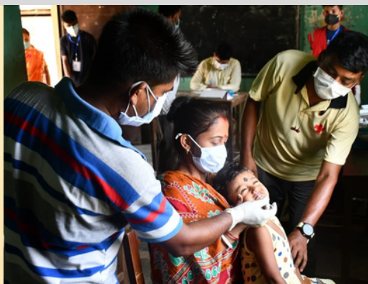
Volunteers of Indian Red Cross Society, Sonamura Sub-Divisional Branch, Sepahijala, Tripura, worked with the health workers for the collection of the swab for Covid - 19 Testing