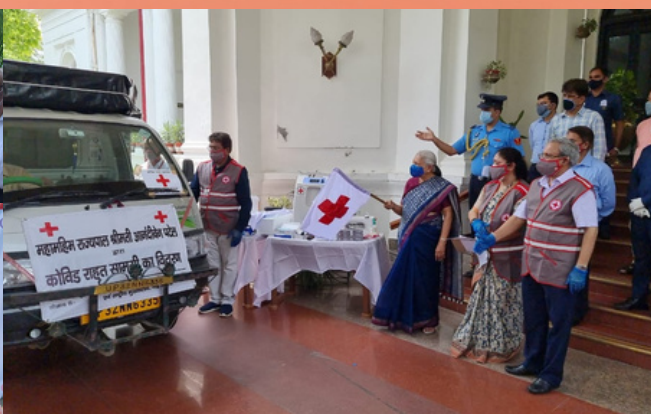
Covid-19 relief material was flagged off by Hon'ble Governor of Uttar Pradesh, Smt. Anandiben from Raj Bhawan to 11 districts