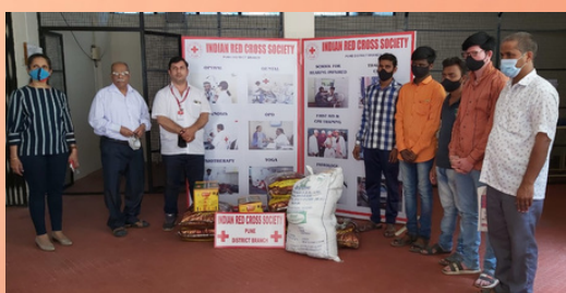
Ration worth Rs 15000 was donated to Luis Braille institution for blinds under Corona Pandemic Response project