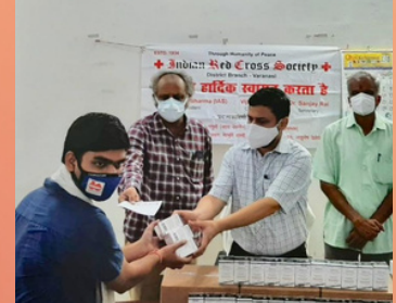
Distribution of Medicines,Varanasi,U.P

We are grateful to all our Donors and Volunteers for their generous support for IRCS relief efforts on behalf of millions of underprivileged and vulnerable families struggling to survive in the aftermath of the COVID-19 Pandemic. Thank you for your compassion, patience, and contribution.