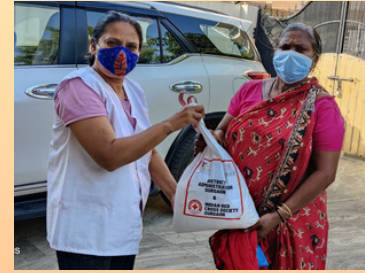
Food Packet distribution- Haryana