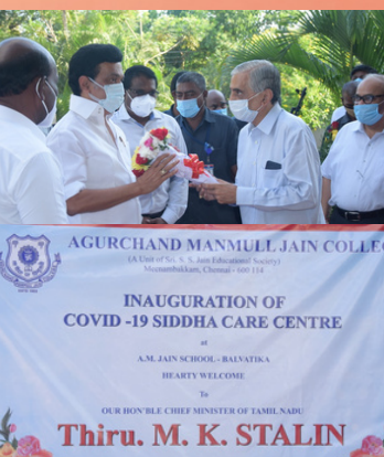
Inauguration of Covid-19 SIDDHA CARE CENTRE, Tamilnadu