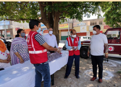
Distribution of Soaps and Masks-Jammu