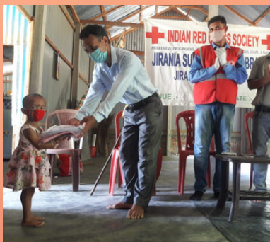
Distribution of Masks,Soaps,Sanitizers-Jirania Sub- Divisional Branch,Tripura