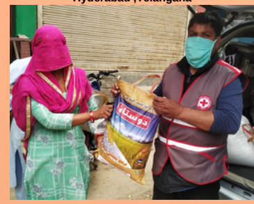
Food Packets Distribution - IRCS District Branch Srinagar,Jammu