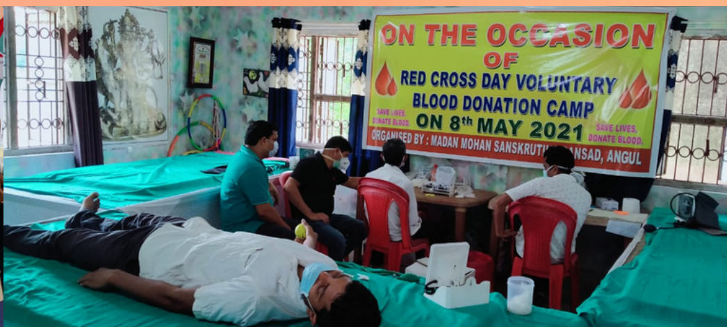
State Branch and All District Red Cross volunteers- in 30 districts of Odisha were engaged in Blood Donation Camps on the occasion of World Red Cross Day