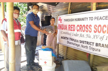
Distribution of relief items to fire victims, Dharmanagar,Tripura