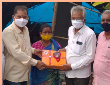
Distribution of HP Kits- Telangana