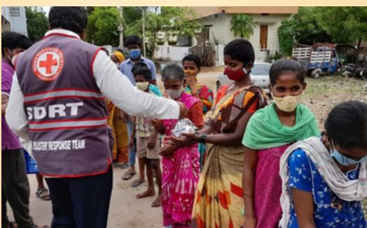
SDRT Trained Red Cross volunteers ( State Disaster Response team from IRCS Bellary District branch. Distributed food packets and Mask- Karnataka