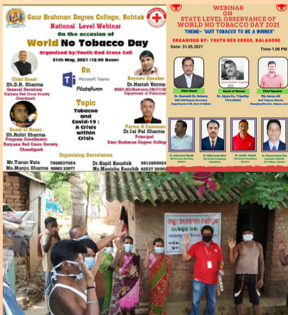
Pledge on World No Tobacco Day - Kendrapara, Odisha