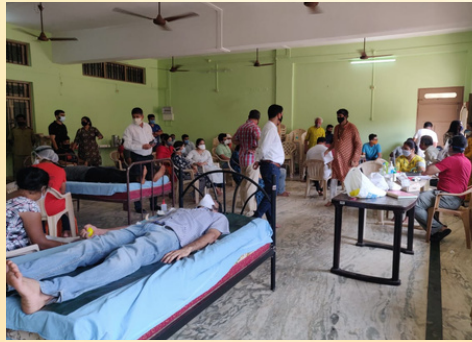
Voluntary Blood Donation, Red Cross, Ponda,-Goa