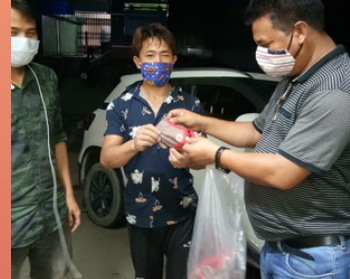
Distribution of Masks,Arunachal Pradesh