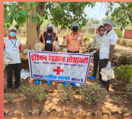
Food packets distribution, Kanker, Chhattisgarh