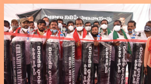
Oxygen cylinder bank at Red Cross orphanage Telangana.