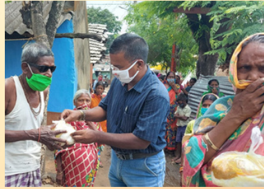
Cooked food distribution Keonjhar district -Odisha