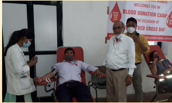
Blood Donation Camp- Dehradun, Uttarakhand