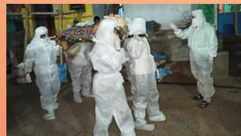
Dead body management by YRC Volunteers at Ganjam district, Odisha