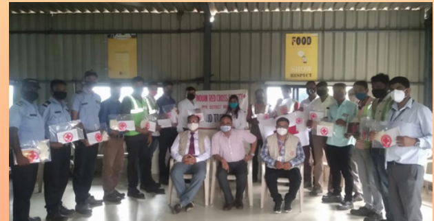
IRCS Pune, Maharashtra organized First Aid Training for Hemnil Metal Processor private limited employees