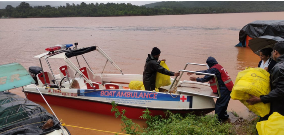
Staff of Bel Air hospital at Panchgani held relief operation during the floods in Satara district of Maharashtra.