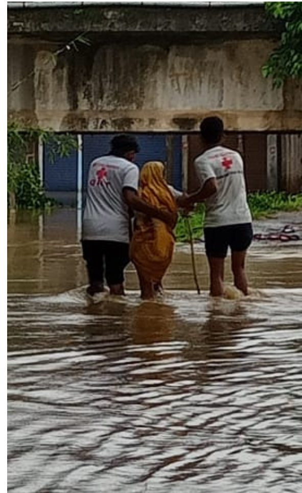
Red Cross volunteers of Sonamura Sub divisional branch rescued flood-affected people of Nalchar RD block,Sonamura ,Sepahijala,Tripura.

Meet people outside to reduce the risk of Covid-19 infections.