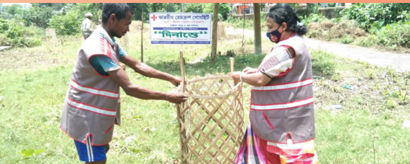
Plantation programme was organised in collaboration with Lions Club & Rotary Club at Red Cross Old Age Home at Purba Bardhaman District Branch, West Bengal