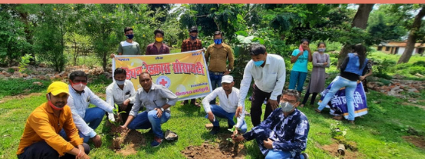
Plantation drive, Dhamtari, Chhattisgarh