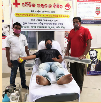
Blood donation camp- Boudh, Odisha