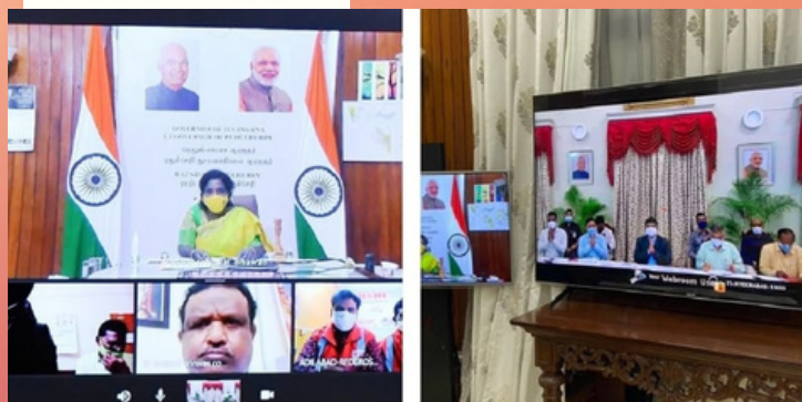
A Virtual meeting was held with Raj Bhawan officials & Indian Red Cross functionaries Telangana in which distribution of relief materials to the victims of flood was appreciated.

Indian Red Cross Society, Ponda Goa, branch distributed juices, health drinks sponsored by Hindustan Coca Cola beverages to health centres of taluka in association with Rotary Club