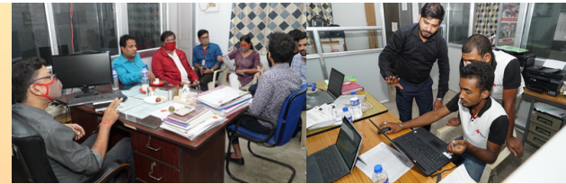
Discussion & brain storming sessions were held among officials of National Headquarter, IFRC, Assam State Branch on Flood Early Warning Early action Google Project