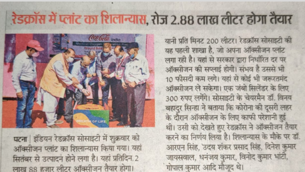
Foundation stone for oxygen plant was laid at IRCS Bihar state branch with the capacity of producing 2.88 lac litres of oxygen per day.