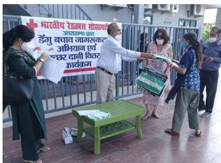
Dengue awareness program and mosquito net distribution-Uttarakhand