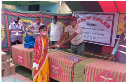
Assam rifles held distribution of essential items at orphanage-South Tripura