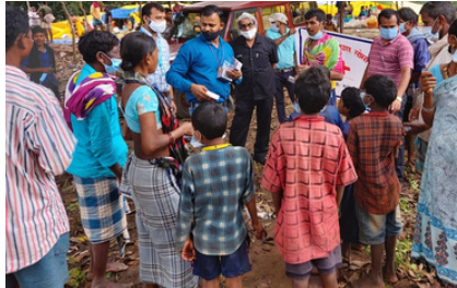
Soaps and Masks distribution, Dantewada, Chhattisgarh