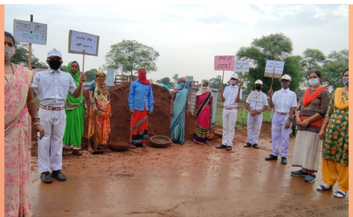
Vaccination Awareness drive, Chhattisgarh