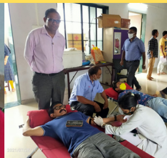
IRCS Blood Centre, Navsari Gujarat