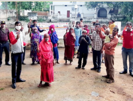
IRCS,Dhamtari,Chhattisgarh distributed masks and soaps to leprosy patients