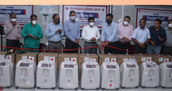
Oxygen bank inaugurated Jalgaon District Branch. Maharashtra State