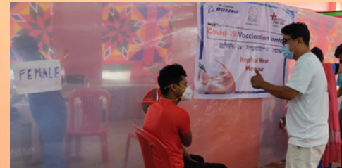
Volunteers of IRCS, Imphal West District Branch helped people in the Covid Vaccination drive at Women's Market.