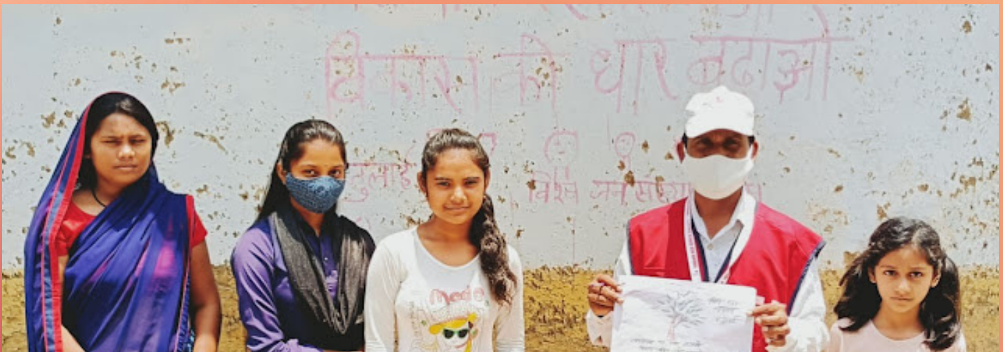
IRCS Dhamtari, Chhattisgarh on eve of World Population Day held an awareness session on population control.