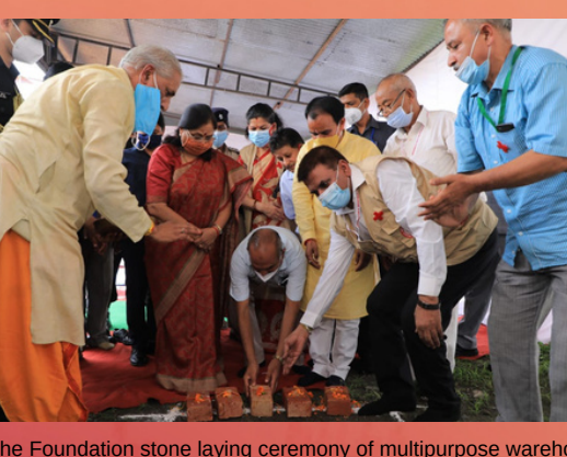
The Foundation stone laying ceremony of multipurpose warehouse had been done by hon'ble Governor of Uttarakhand in presence of hon'ble Health minister of Uttarakhand state.