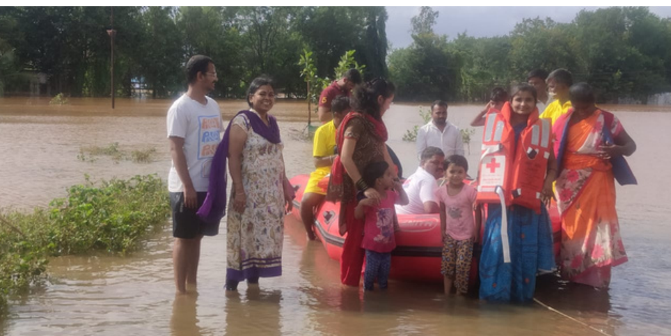
Volunteers from Kurundwad,Taluka Shirol rescued families affected during floods in Kolhapur district, Maharashtra.