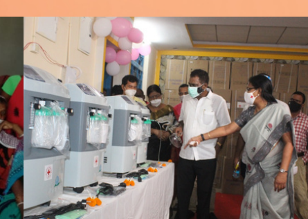
Oxygen concentrator bank was inaugurated at Red Cross Bhawan,Odisha