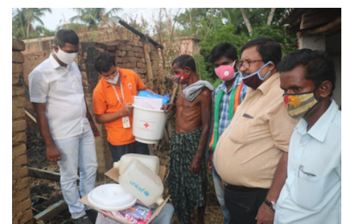
Distribution of relief material to the fire victim at krushna prasad, Niali, Cuttack, Odisha