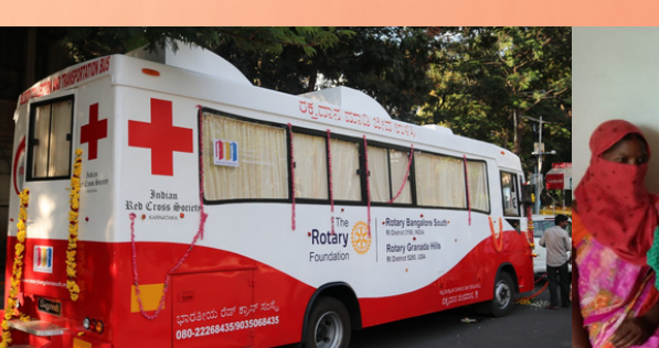
Rotary Bangalore South has donated FOUR BEDDED a Brand new blood drawing bus worth of 46 lakhs to the Red Cross Blood Center Bengaluru.