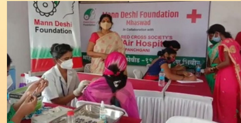
Free vaccination of 6,000 women through Bell Air Hospital, Satara, Maharashtra