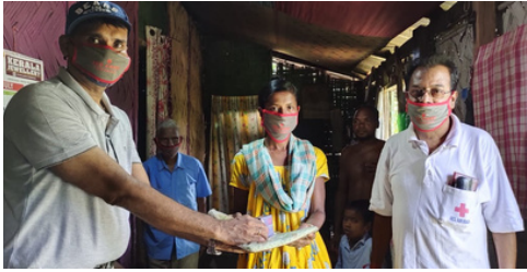
Distribution of relief materials, North and Middle Andaman District Branch