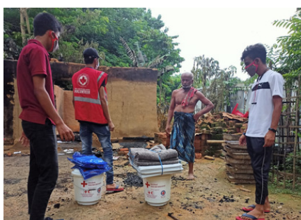
Volunteers of Indian Red Cross Society, Sonamura Sub-Divisional Branch, distributed relief materials among the fire affected family of Bejimara G P, Sonamura, Sepahijala, Tripura