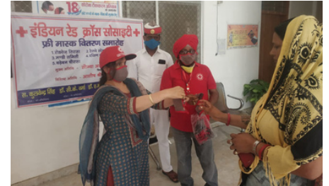
Mask distribution, Basti, U.P