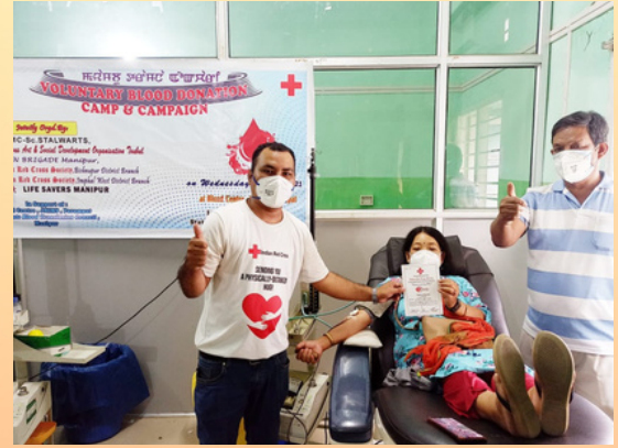
Blood donation camp, Manipur- Donor receiving the certificate