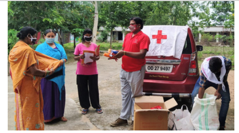
Distribution of hygiene materials to 25 inmates (Women) of Swadhara Gruha, Narayanpur, Boudh, Odisha