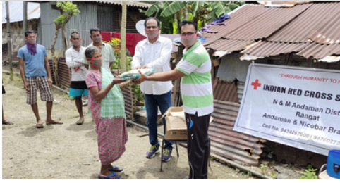
Distribution of Soaps & Masks- Rangat district, Andaman & Nicobar branch