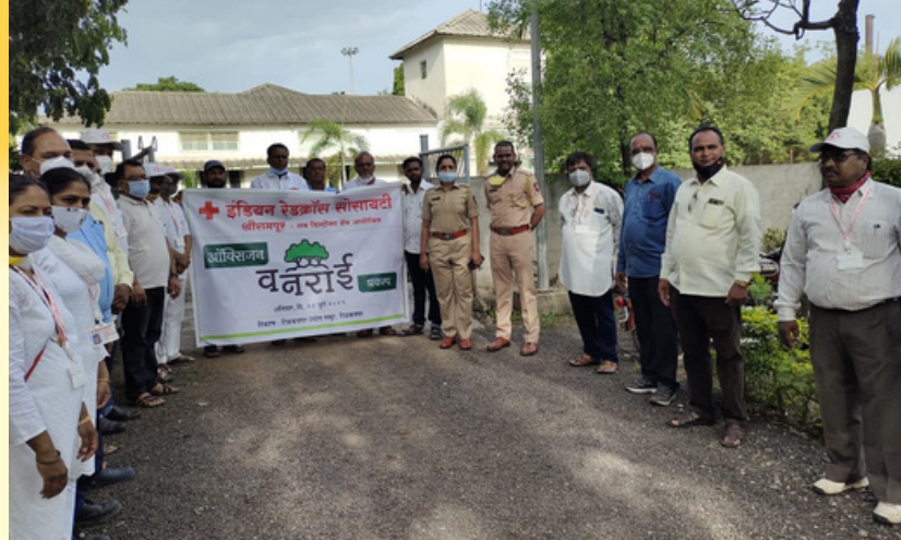
Tree Plantation at Tilaknagar industrial area- Shrirampur sub district, Maharashtra state branch