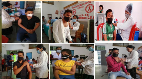
Vaccination drive- Janjgir, Chhattisgarh