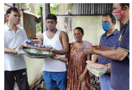
IRCS, Andaman & Nicobar Branch through its District branch Rangat distributed relief materials to fire victim at Parnashala, Rangat.

We are grateful to all our Donors and Volunteers for their generous support for IRCS relief efforts on behalf of millions of underprivileged and vulnerable families struggling to survive in the aftermath of the COVID-19 Pandemic. Thank you for your compassion, patience, and contribution.