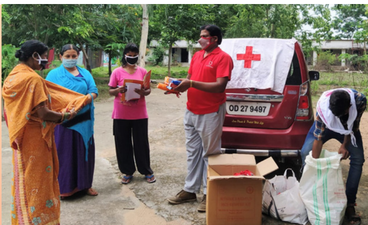
Awareness on Covid-19 and distribution of Hygiene materials to the 25 inmates (Women) of Swadhara Gruha, Narayanpur, Boudh, Odisha