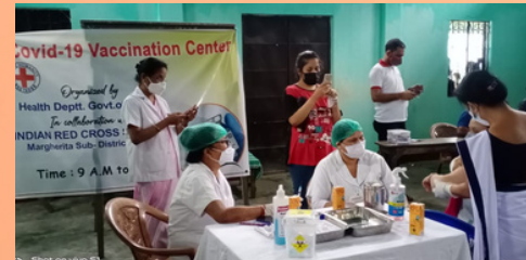
A free vaccination drive had been conducted by the Health Dept., Govt. of Assam in association with Margherita Sub District branch