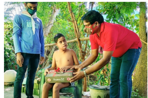
Distribution of hygiene materials to the Disabled persons, Boudh district, Odisha