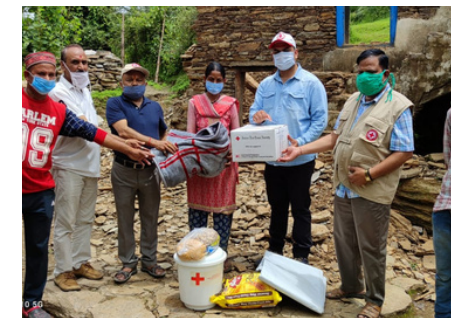
Relief to fire victims-Bageshwar, Uttarakhand