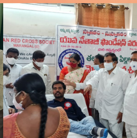
Blood donation camp -IRCS WARANGAL- 89 units of blood were collected