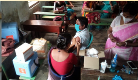
Vaccination program at Ganki school premises under Khowai District in Tripura