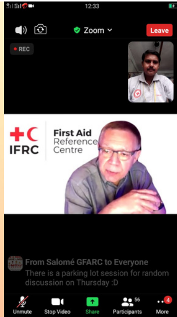
Representative of Tripura State Branch attended a virtual meeting organized at Kuala Lumpur, Malaysia by IFRC.