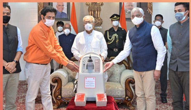
Hon'ble Governor of Andhra Pradesh and President of AP Red Cross released 100 oxygen concentrators & 48,000 Covid testing vials donated by Singapore Red Cross for distribution.