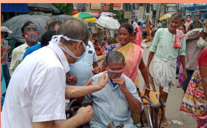
Malda District Branch, IRCS West Bengal held an awareness campaign on COVID-19. Masks and Soaps were distributed.