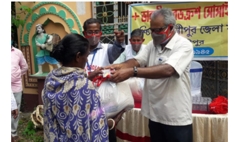
Soaps and masks distribution- Paschim Medinipur district branch, IRCS West Bengal.