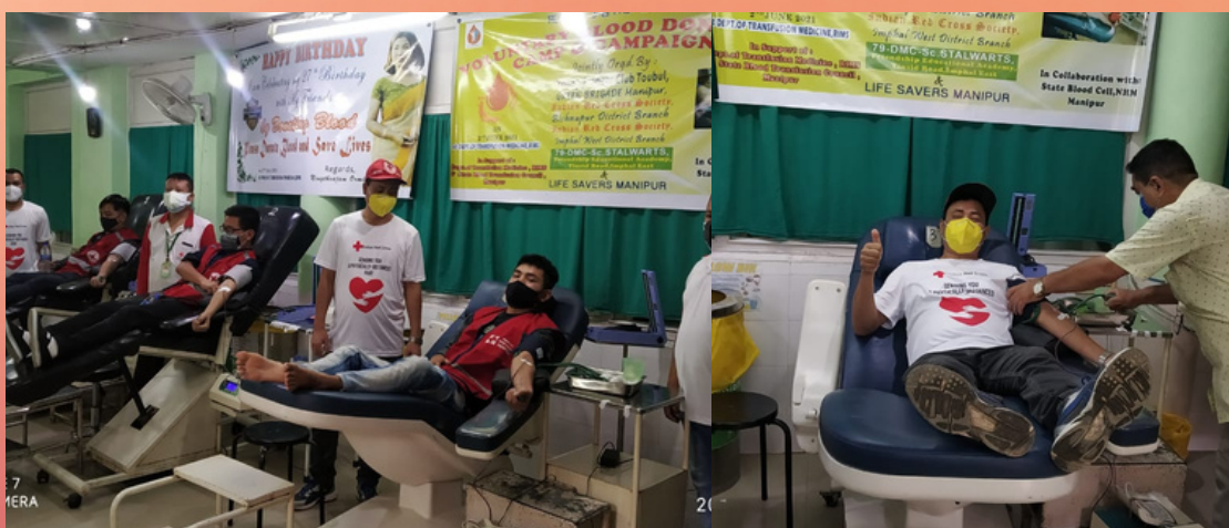
Blood Donation Camp was jointly organised by: Young Pioneer Club Toubul, GREEN BRIGADE Manipur, 79-DMC Sc. STALWARTS, IRCS Bishnupur District, IRCS Imphal West District Branch, Manipur. 22 units of Blood were collected.