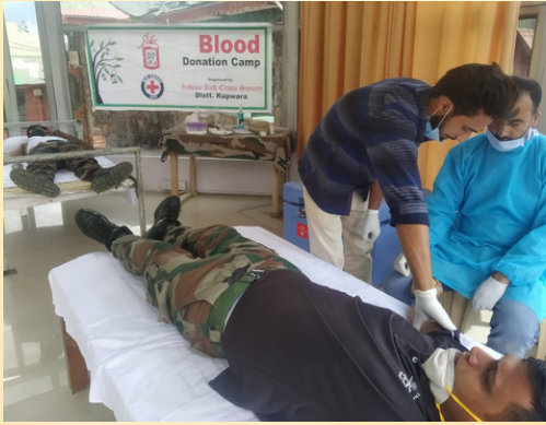
Blood donation camp-Kupwara district branch, Jammu& Kashmir