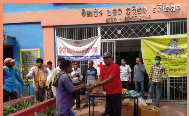
Awareness on Covid19 third wave to the NAC sweepers and sanitation workers were held along with this masks, soap and other hygiene materials were distributed by the Youth Red Cross, Boudh, Odisha