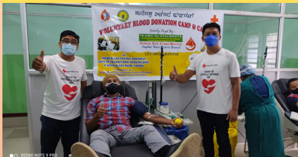
Blood donation camp- Manipur