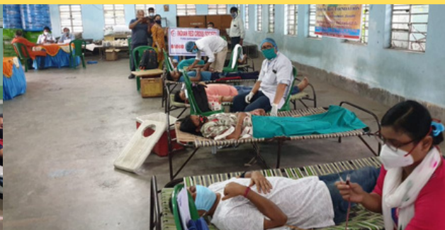
Purba Bardhaman District Branch, West Bengal held a blood donation camp at Aurobinda Stadium. 30 people donated blood