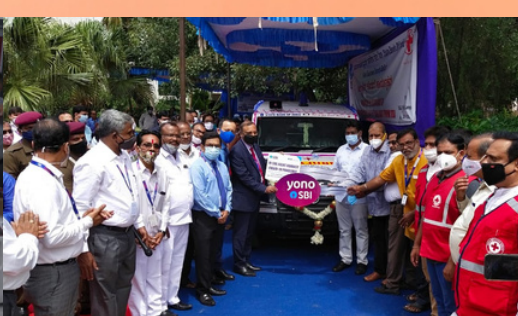
SBI donated ambulance to IRCS Ballari,Karnataka