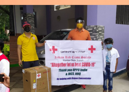
Oppo India donated OC's -Manipur state branch