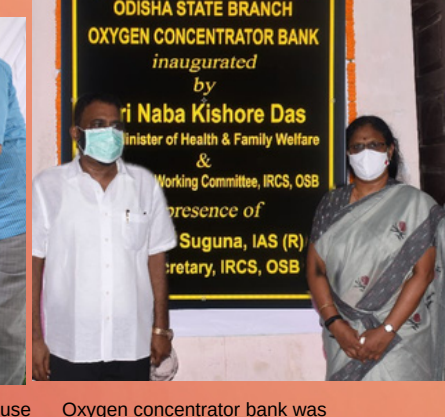
Oxygen concentrator bank was inaugurated at Red Cross Bhawan,Odisha