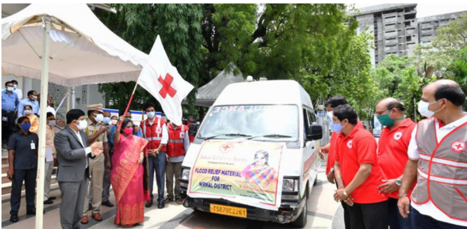
Flood relief material for Nirmal district,Telangana was flagged off by Hon'ble Governor Smt. Tamilsai Soudarajan