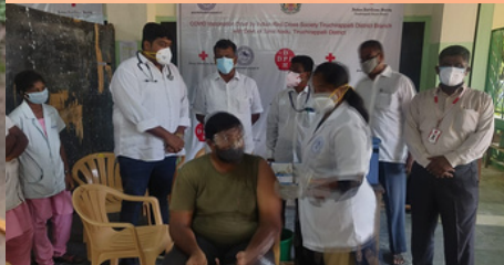
Vaccination camp at Trichy, Tamilnadu