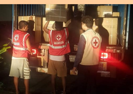
IRCS Assam State Branch had received 100 nos. of OC's and 8 nos. of Ventilators for its COVID19 response donated by Singapore Red Cross through IRCS-NHQ and Tamil Nadu State Branch.