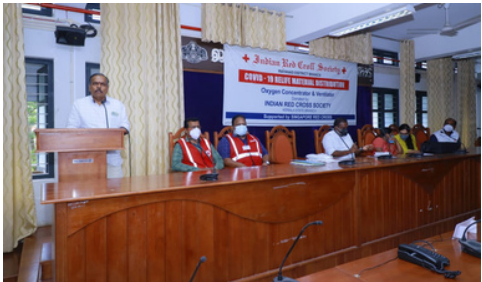
Relief material distribution oc's and ventilators - IRCS, Kerala