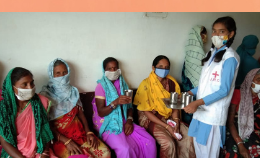
Junior red cross volunteer serving at Balod vaccination centre,Chhattisgarh