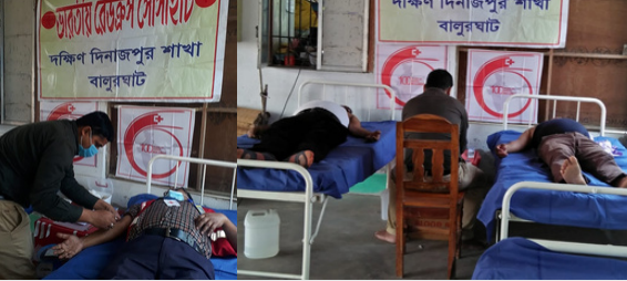
Blood Donation Camp- Dakshin Dinajpur District Branch