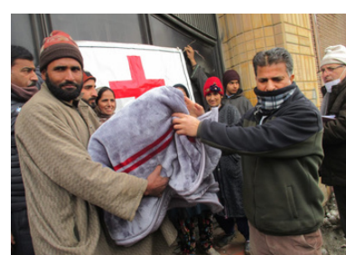
Blanket distribution-J& K