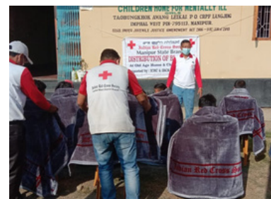
Blanket distribution -Manipur