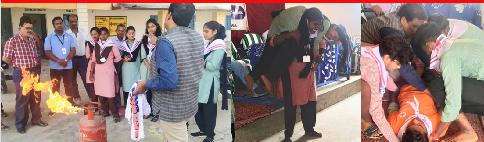
Disaster management training was held at Purunakatak College, Boudh, Odisha

Having you as a trained first aider would be a big plus.