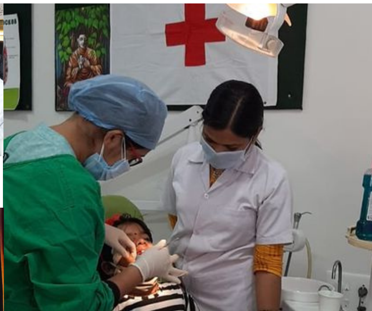
Indian Red Cross Society, Pune in association with Jeevan Jyoti Charitable Foundation held a free dental health check-up camp for children of Rasta Peth CSW'S. A total of 19 children participated in the training.