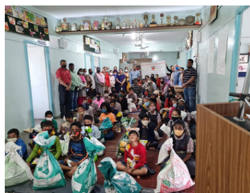
Children of School of deaf -IRCS Pune