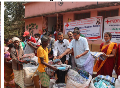
Senior Citizen -HP Kit-Odisha