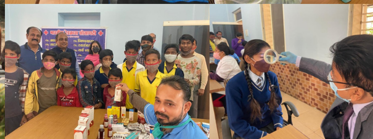
Red Cross M.P State Branch organized a free health check-up camp at Bal Niketan (orphanage home) where 63 kids were examined by the doctors and provided medicines.