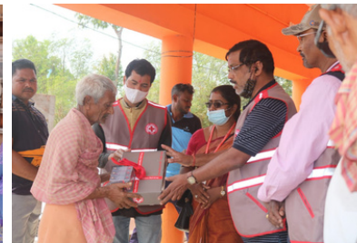
HP kit, Mask & soap-Brahmapada Village , Brahmagiri , Puri District