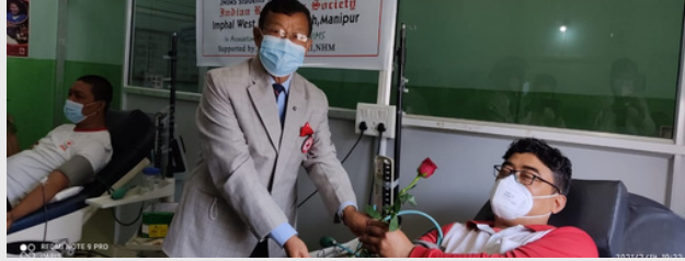
Volunteers of IRCS, Imphal West District Branch (Manipur) donated blood at Blood Centre JNIMS on the occasion of Valentine Day.