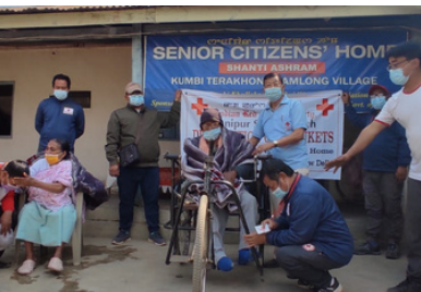
Disabled people -blanket distribution -Manipur