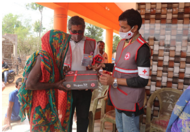
HP Kit distribution - Puri