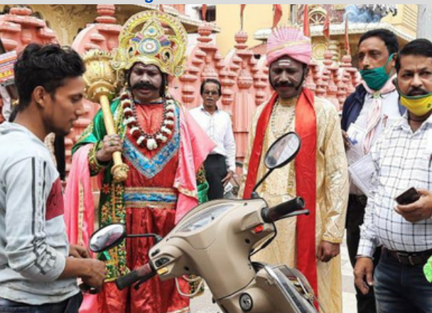
Road Safety, Odisha