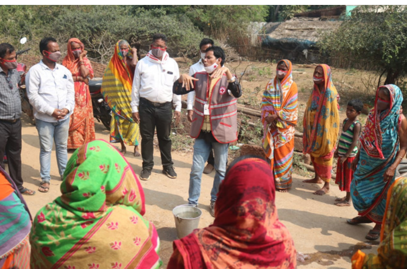
Wash awareness session for villagers of Brahmapada Village, Brahmagiri, Puri - District

रेडक्रॉस सोसायटी से कंबल मिलते ही खिले बूजुर्गों के चेहरे