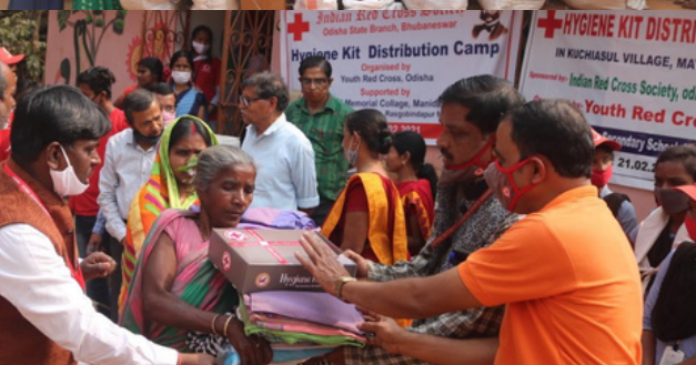
Relief materials distributed to the needy tribal people of Kuchiasola Village of Mayurbhanj District.