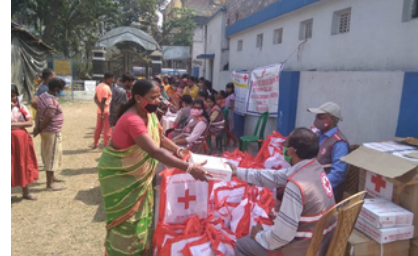
Relief material distribution- Fire Victims of Baghbazar Basti - West Bengal

We are grateful to all our major Donors (Aramco, Aviva & Nestle) and Volunteers for their generous support for IRCS relief efforts on behalf of the millions of underprivileged and vulnerable families struggling to survive in the aftermath of the COVID-19 Pandemic and other disasters. Thank you for your compassion, patience and respect for being the inspiration the world needs.