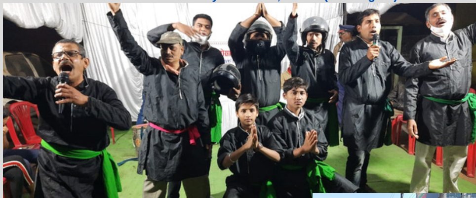
Road Safety Awareness through Nukkad Natak/Rally -Dhamtari, Kanker (Chattisgarh)