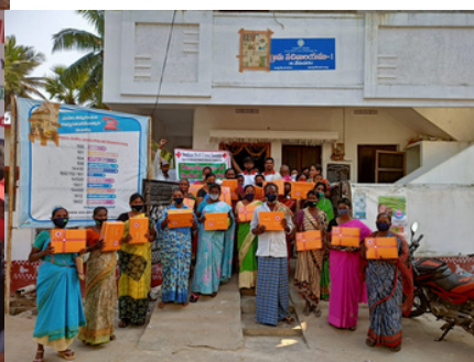
Indian Red Cross Society, Karaikal district branch distributed hygiene kits received from the National headquarters to the old age home in Karaikal. 300 numbers of hygiene kits consisting of washing soaps, bathing soaps, sanitary napkins, toothpaste, toothbrush and coconut oil were distributed to the needy