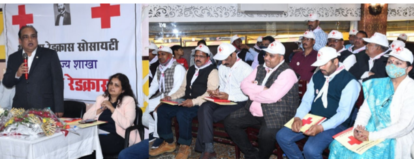
Representatives from 35 districts of state attended the Junior Red Cross meet organized by M.P State Branch. This was organized after 8 years.