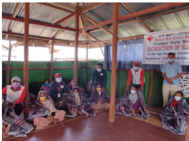
Blanket distribution-Old age home - Manipur