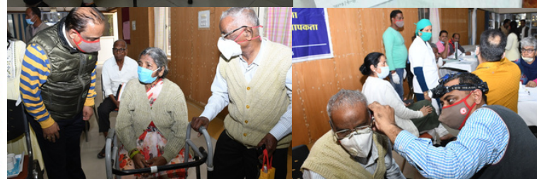
A health check-up camp for Apna Ghar and Lions Club Senior Citizen's old age home was organized by Red Cross M.P State Branch.