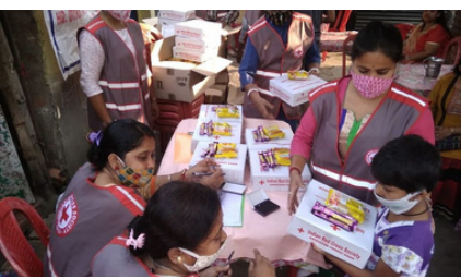
Food packets distribution kids-IRCS West Bengal