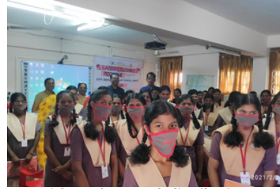
Girls Student-Mask distribution- Andaman& Nicobar