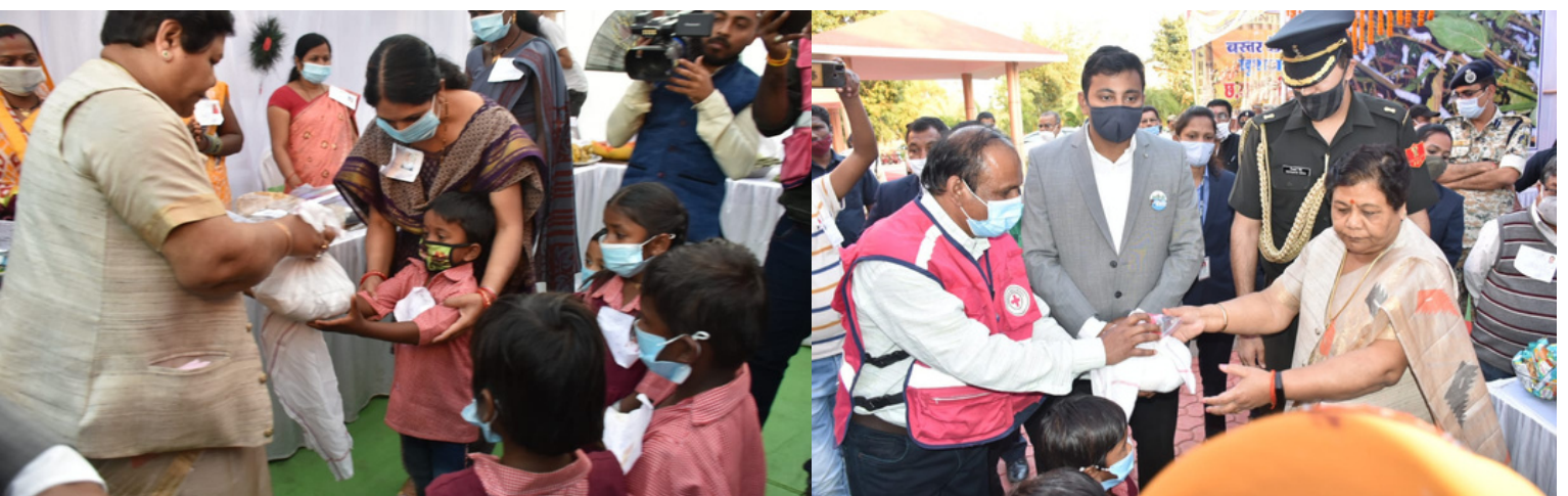
Hon'ble Governor & President of Indian Red Cross Society, Raj Bhavan Raipur (Chhattisgarh) Anusuiya Uikey distributed Food packets, soaps, and masks amongst children.