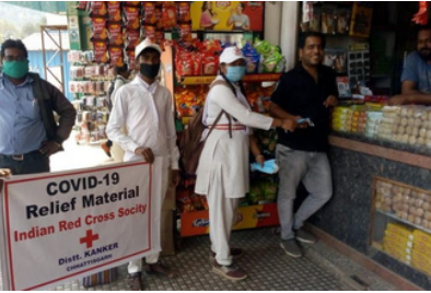
Mask distribution, Kanker,Chattisgarh