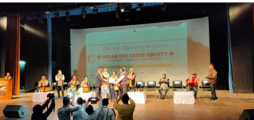
Convention On Red Cross Movement was organized by Indian Red Cross Society Silchar District Branch, Assam.