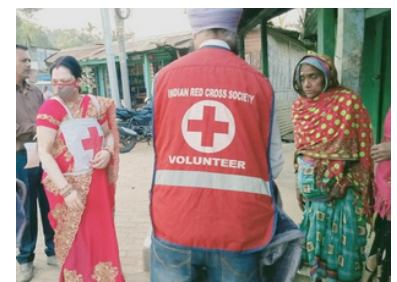
Blanket distribution -Assam