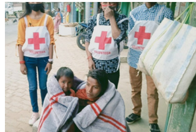
Mother &Child -blanket distribution- Assam