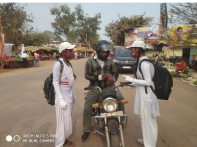
Bike rider - Mask distribution Odisha