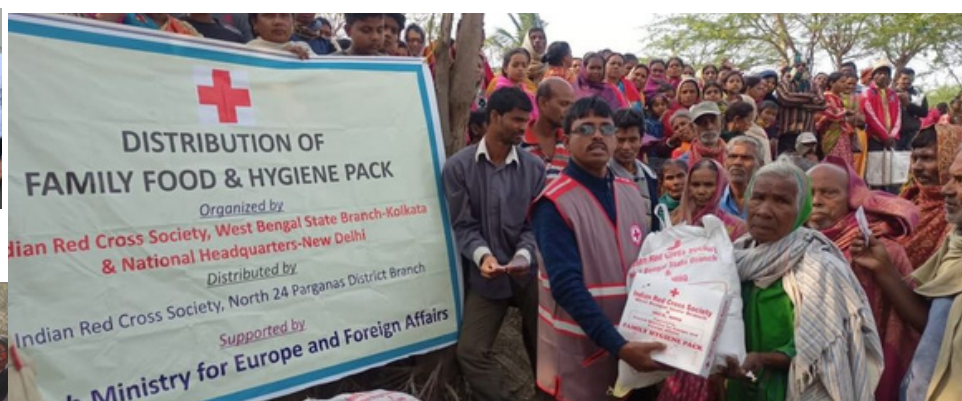
IRCS WBSB- 1200 Family Food packets and 1200 Hygiene kits were distributed amongst the Cyclone Amphan affected people at North 24 Parganas District.