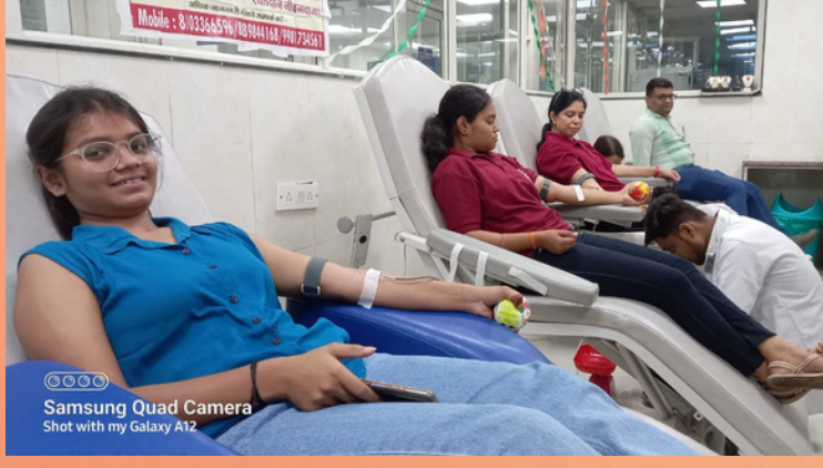
Blood donation camp, Bhopal, M.P.