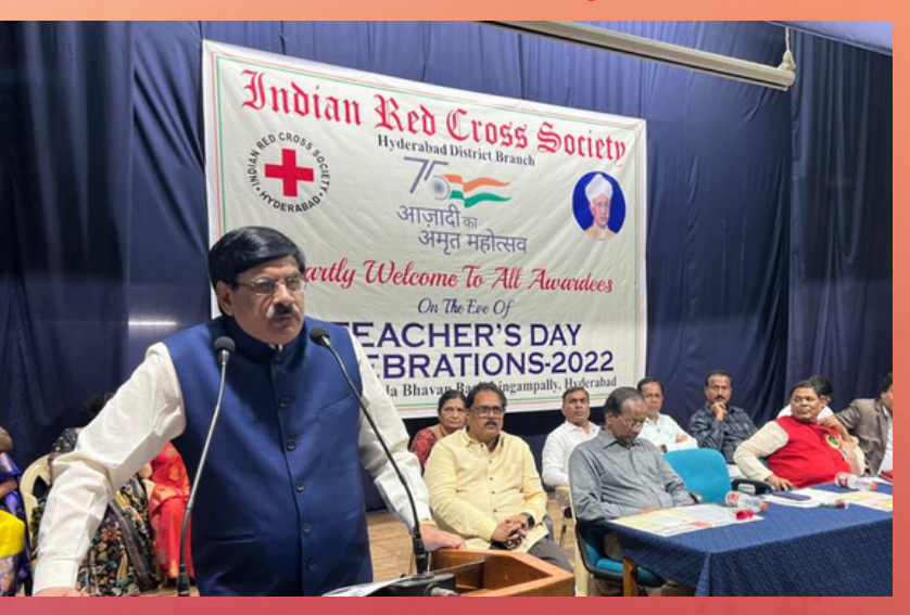
Celebration of Teachers Day, Hyderabad District Branch, Telangana