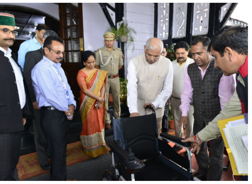
Distribution of battery-operated wheelchairs with a joystick to poor & needy at Sangla, Kinnaur, Himachal Pradesh by Hon'ble Governor of Himachal Pradesh Sh. Rajinder Arlekar