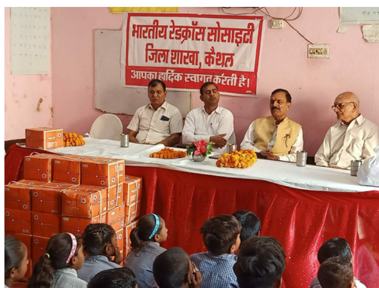
Hygiene kits were distributed at Guru Brihaspati Divyang Bal Upvan Kendra, Kaithal by the district branch