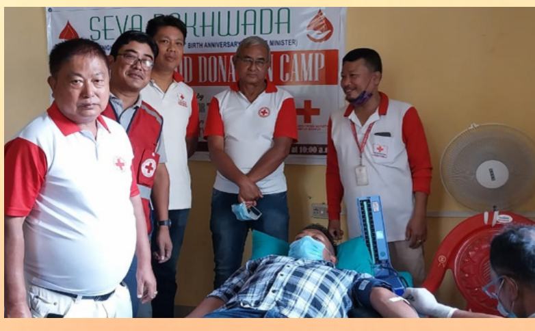
Blood donation camp, IRCS, Manipur State Branch