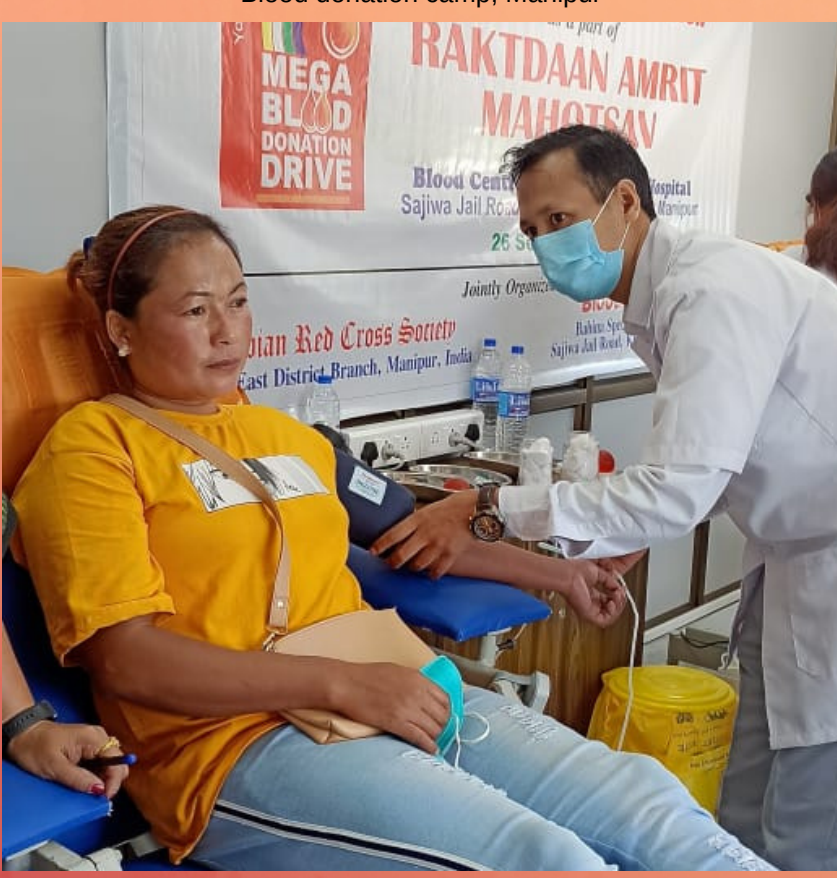
Blood donation camp organised by IRCS Imphal East District Branch, Manipur as a part of Raktdaan Amrit Mahotsav