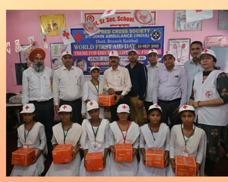
Distribution of Hygiene kits on the Occasion of World First Aid Day, Kaithal, Haryana