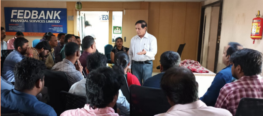
First Aid awareness programme & blood donation motivation programme for employees of Federal Bank, Hyderabad, Telangana