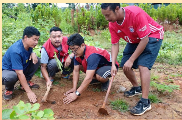
Tree Plantation Drive, Manipur