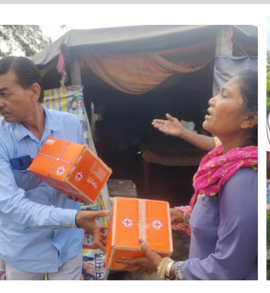
Distribution of hygiene kits, Charkhi Dadari, Haryana