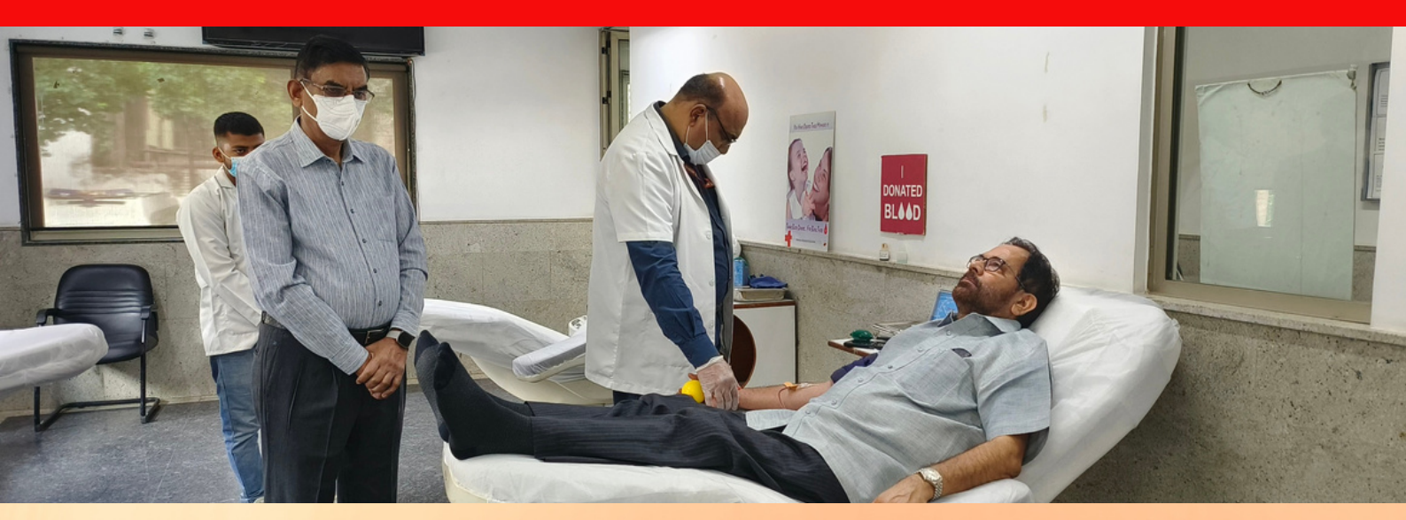
Minority Affairs Minister Shri. Mukhtar Abbas Naqvi, donated blood at IRCS, NHQ, Blood Centre