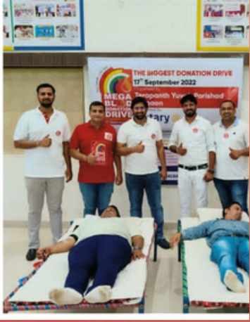
414 units of blood were collected in 5 blood donation camps held at Jalgaon, Maharashtra