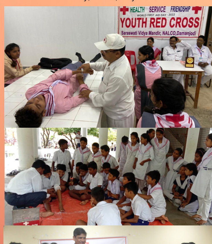
World First Aid Day -2022 was observed at several districts of Odisha (Boudh, Nabarangpur, Bhadrak, Sundargarh, Puri, Nuapada, Balasore, Sonepur, Baragarh, Ganjam, Koraput & Malkangiri etc.)