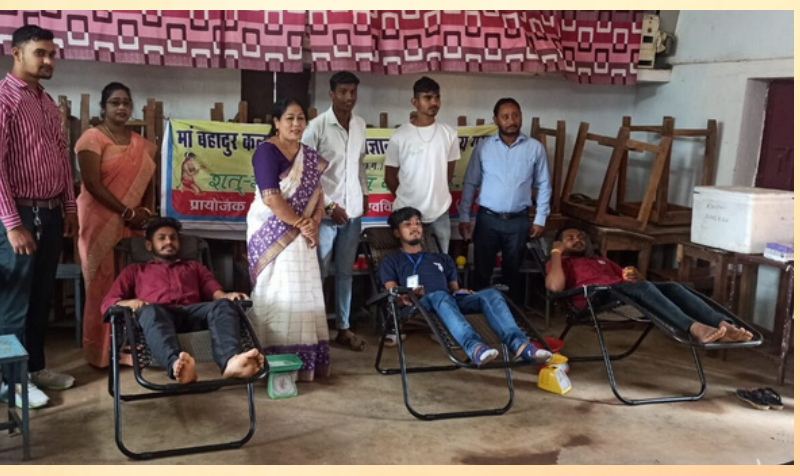
Blood donation camp, Balod, Chhattisgarh