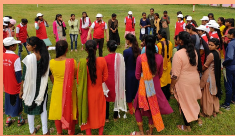
Awareness camp on right to vote, Saloni, Chhattisgarh