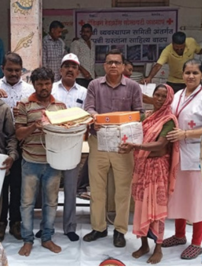
Distribution of hygiene kits, kitchen sets & relief items to poor & needy, Jalgaon, Maharashtra