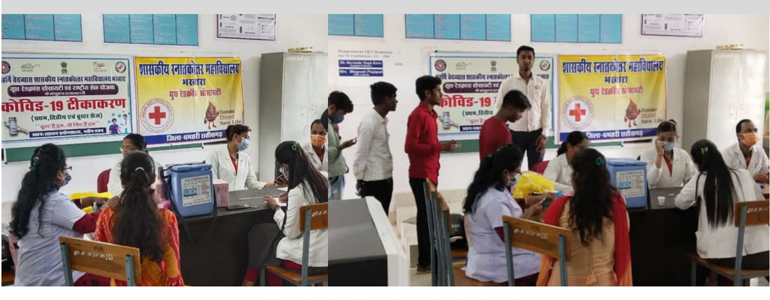
Covid vaccination drive, Dhamtari, Chhattisgarh