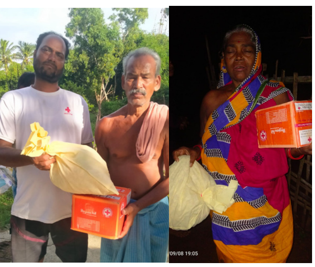
Distribution of hygiene kits & food packets in different districts of Odisha