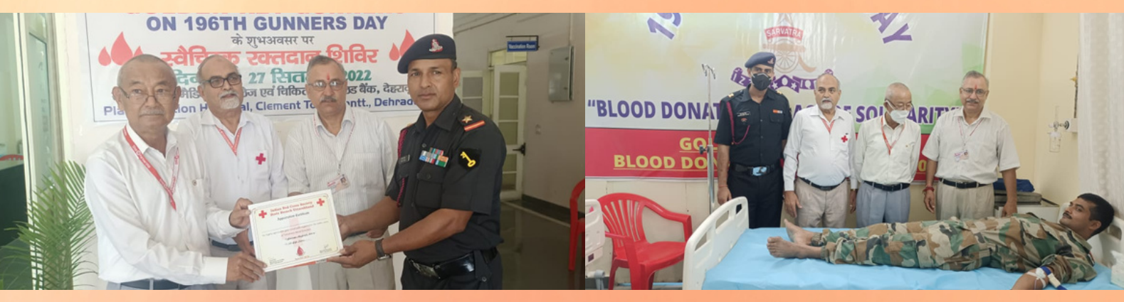
Blood donation camp, Dehradun, Uttarakhand