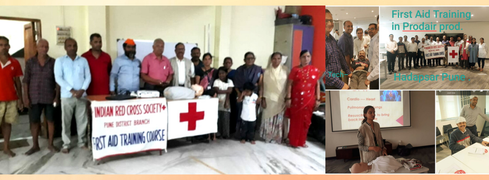
First Aid Training, Hadapsar, Pune, Maharashtra