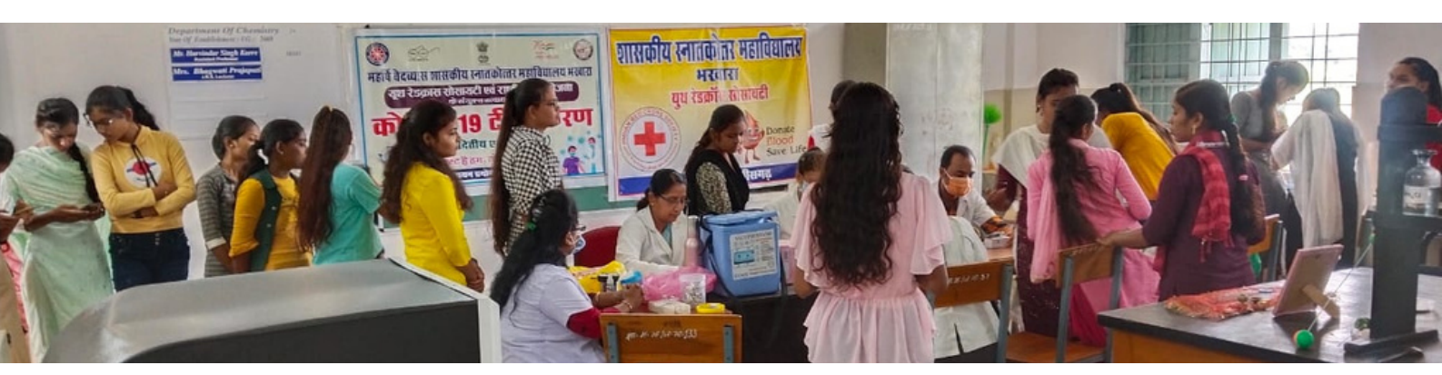
Covid vaccination drive, Bhakhara, Chhattisgarh