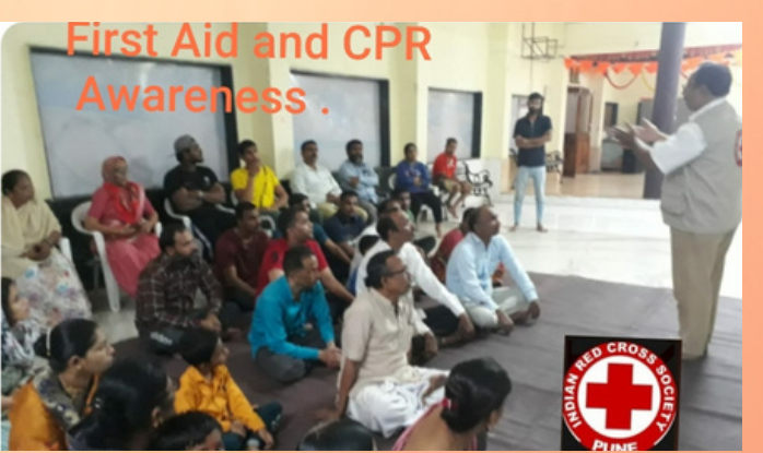
First Aid & CPR Training, Pune, Maharashtra