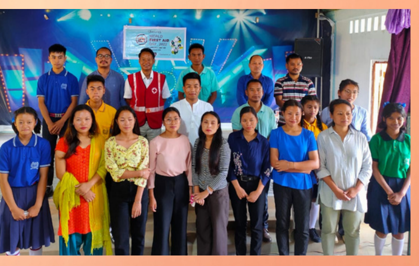
World First Aid Day at Samaritan School Auditorium Hall, Senapati District, Manipur