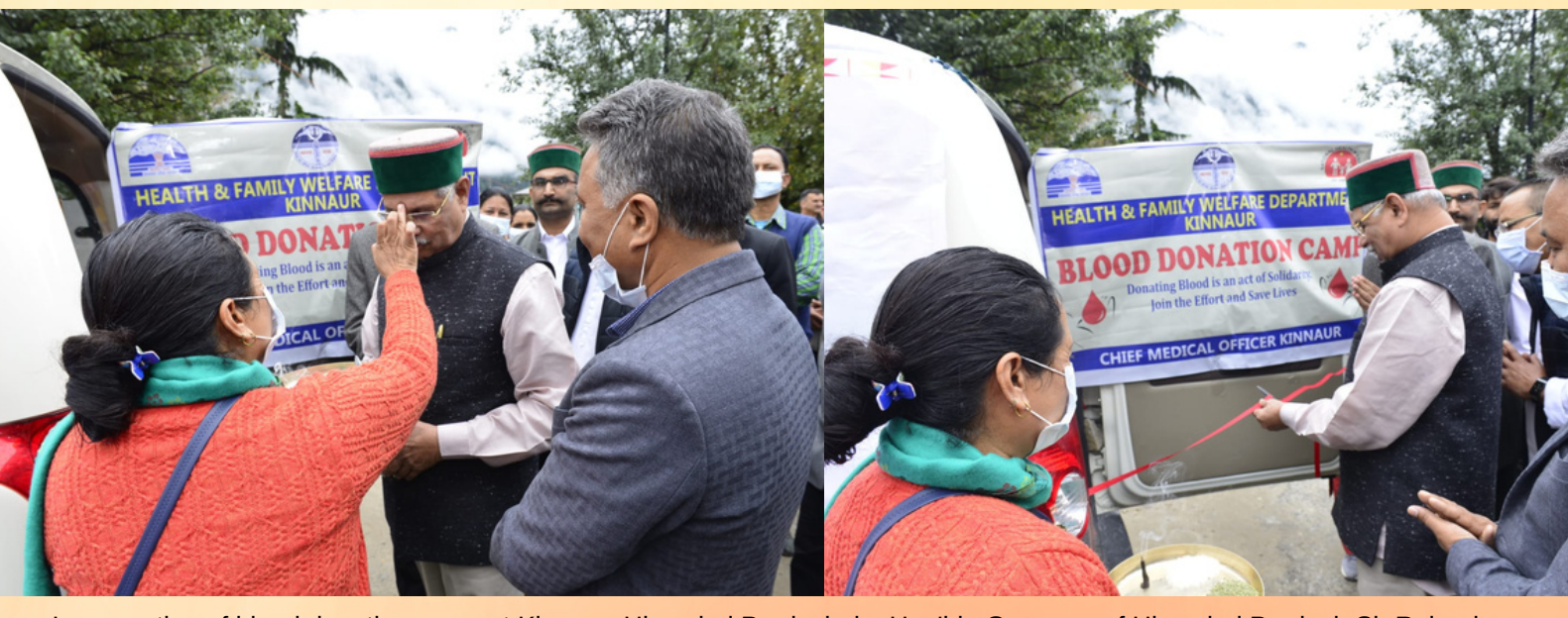
Inauguration of blood donation camp at Kinnaur, Himachal Pradesh, by Hon'ble Governor of Himachal Pradesh Sh.Rajendra Vishwanath Arlekar