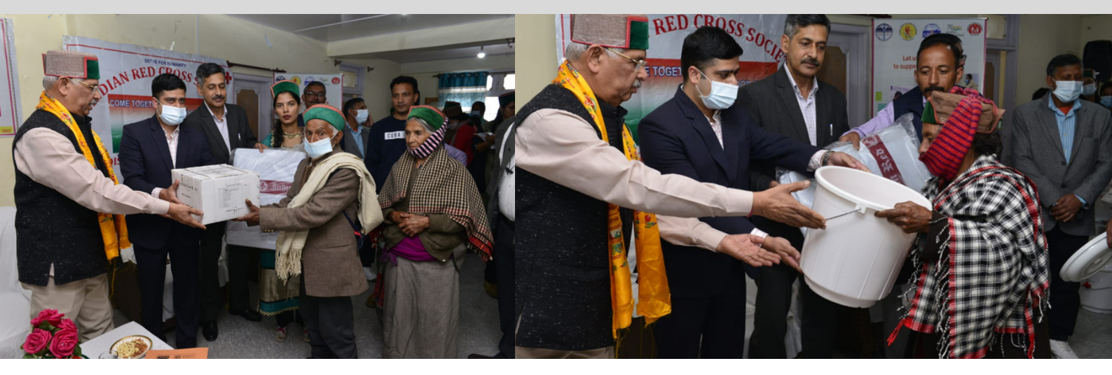
Distribution of relief material to BPL families at Sangla, Kinnaur, Himachal Pradesh, by Hon'ble Governor of Himachal Pradesh Sh. Rajinder Arlekar