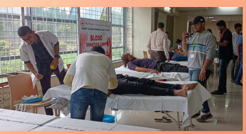
Blood donation camp at Medchal & Malkagiri, districts of Telangana