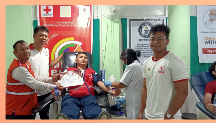
Blood donation camp, Manipur