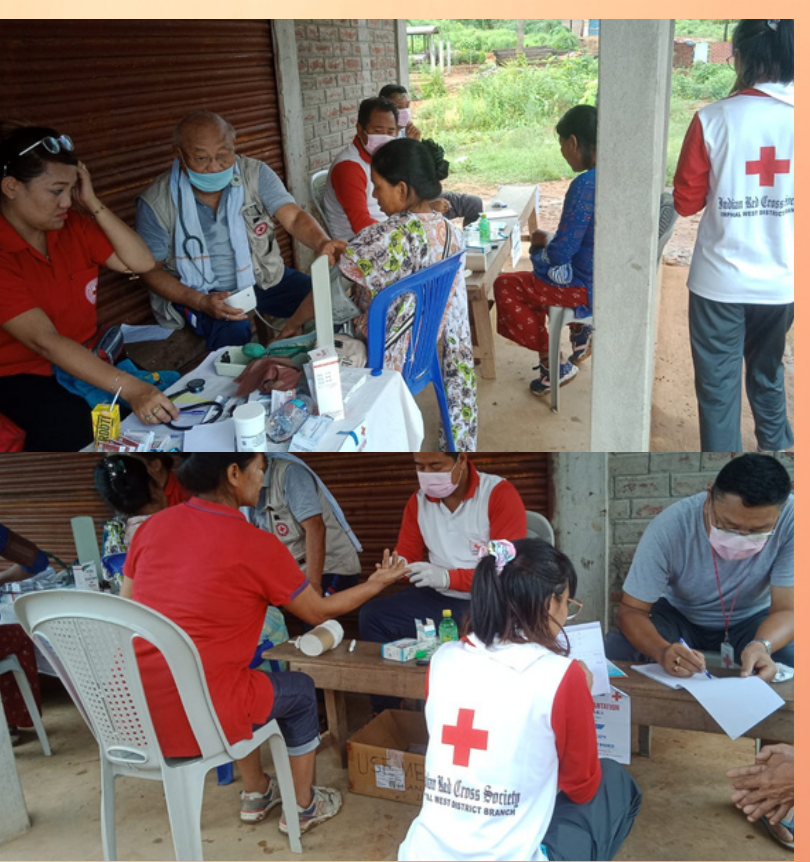
Health camp, Manipur