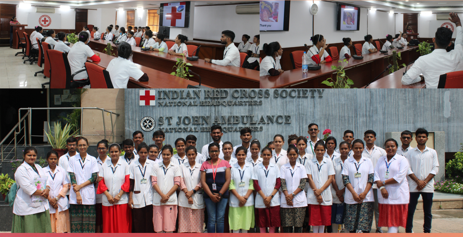
An orientation class for students of nursing from the College of Narnarayan Shastri Institute of Nursing, Jetalpur, Ahmedabad was held at IRCS, NHQ on 21st September 2022 in which 35 students and 2 faculty member participated.