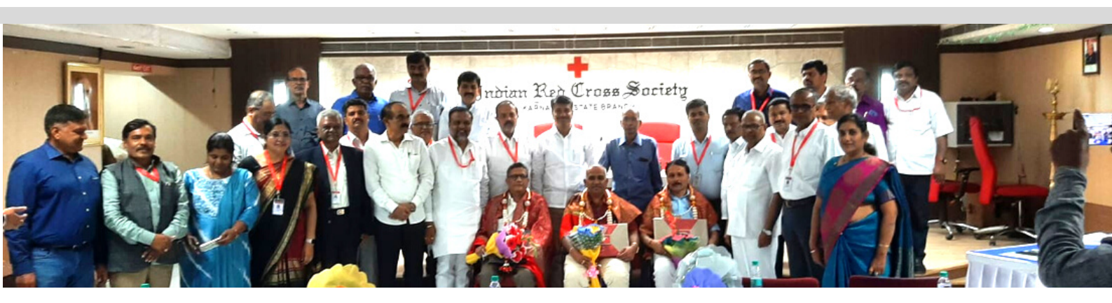
Karnataka Red Cross State Branch had its second Managing Committee Meeting on 20th September, 2022.