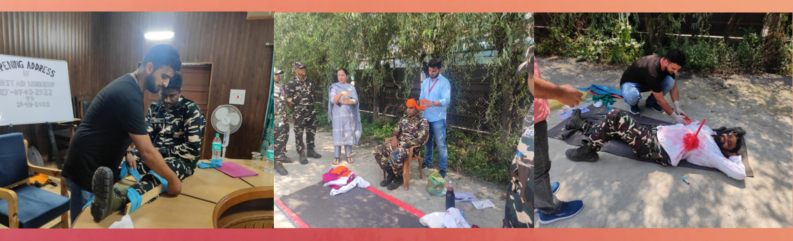
First Aid Training of Sashastra Seema Bal Jawans at Srinagar, J&K