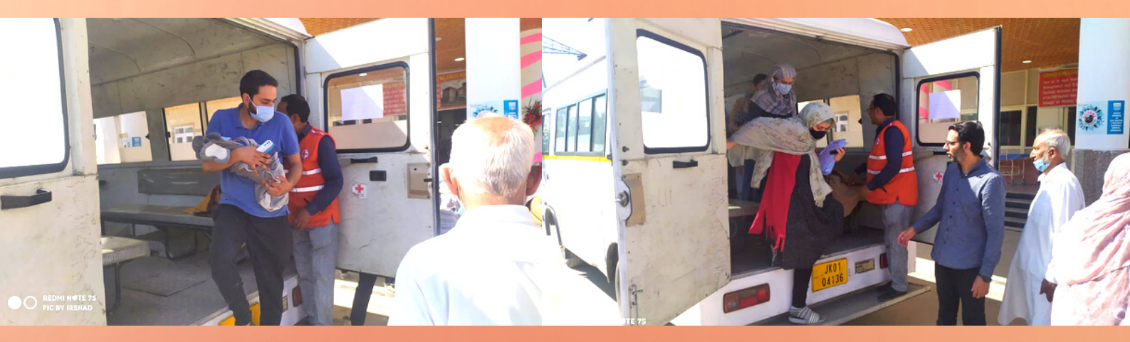
Free Ambulatory services were provided to the patients by IRCS, J&K State Branch