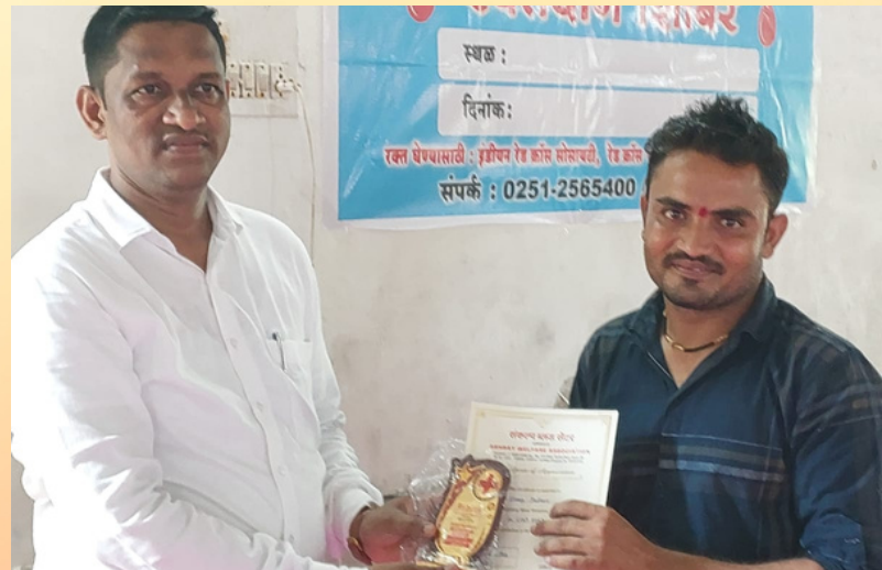
Blood donation camp was held at Ulhasnagar, Thane district, Maharashtra state branch. 145 units of blood were collected.