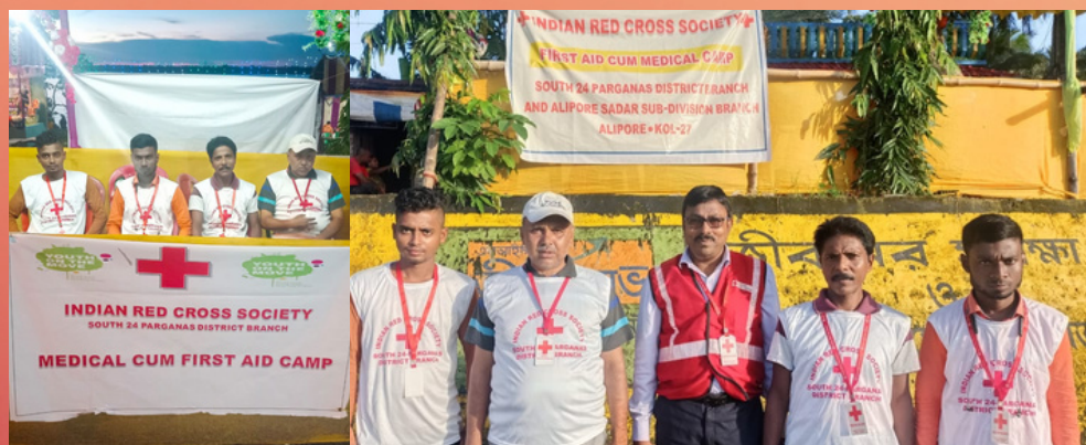
First aid cum medical camp, South 24 Parganas district branch & Alipore Sadar sub division branch, West Bengal