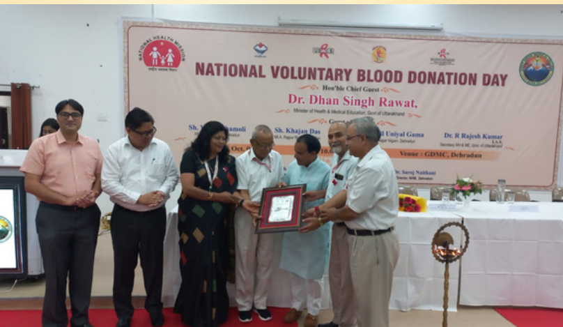
On the occasion of National Voluntary Blood Donation Day, Indian Red Cross Society Uttarakhand was honored by Govt. Medical College Dehradun & NHM Uttarakhand