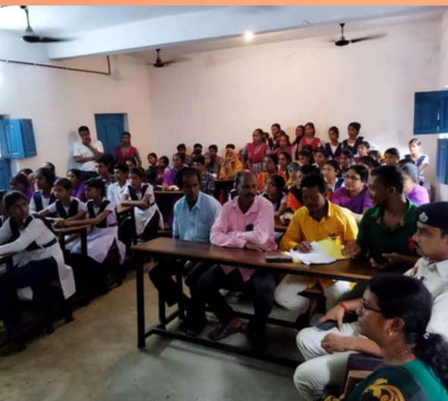
Indian Red Cross Society, Kandi Branch, West Bengal sensitized people on stopping child marriage