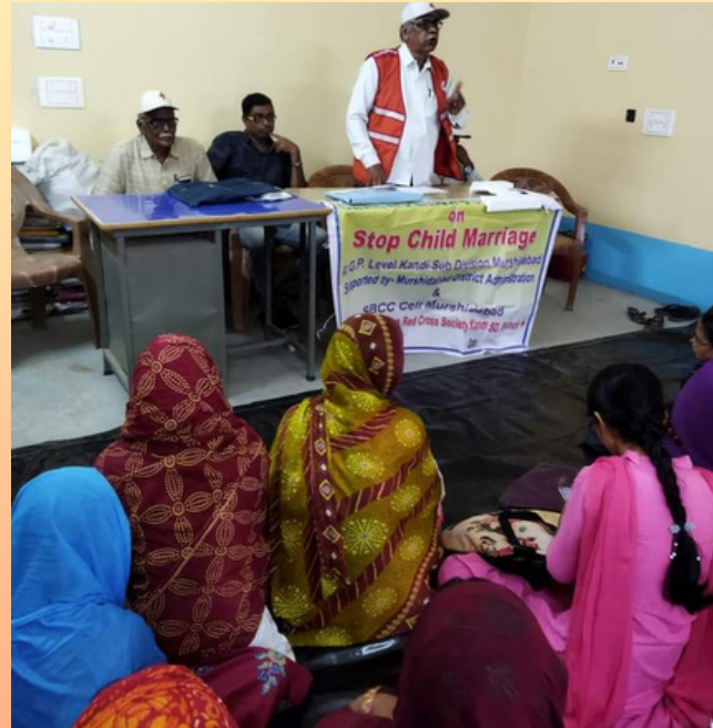
Indian Red Cross Society, Kandi Branch, West Bengal held an awareness campaign on stopping child marriage