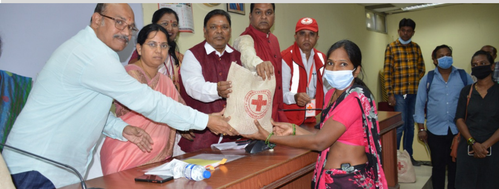
IRCS, Hyderabad district branch in collaboration with Telangana TB Association & Hyderabad District TB Control Authority under Pradhan Mantri TB Mukh Bharat Abhiyaan organized food nutrient kits distribution program for TB patients