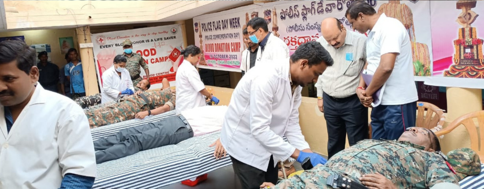
Blood Donation Camp, Police Octopus, Vidyanagar, Hyderabad, Telangana. 174 units of blood were collected.