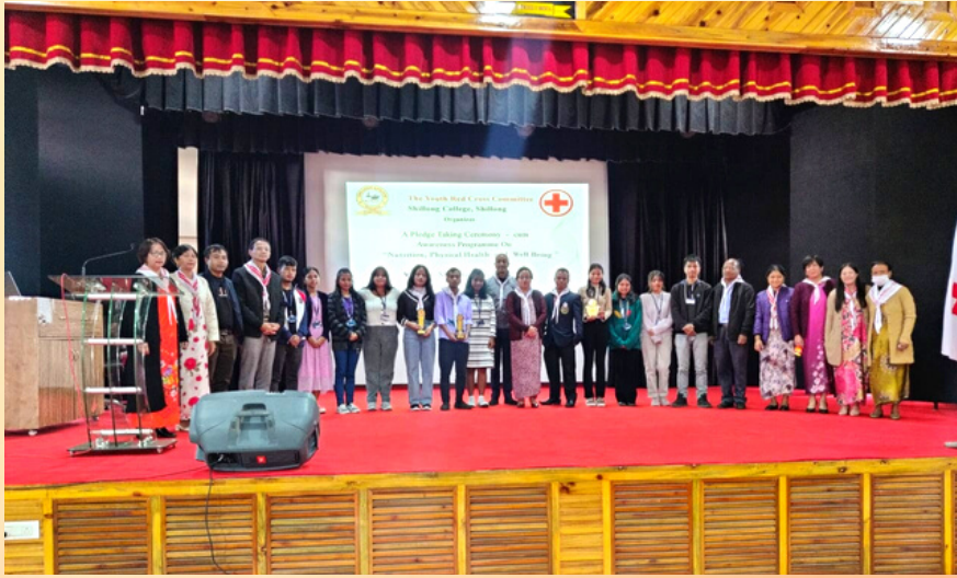
A pledge-taking ceremony cum awareness program on nutrition, physical health & well-being was conducted by Youth Red Cross Committee & Shillong College, Shillong