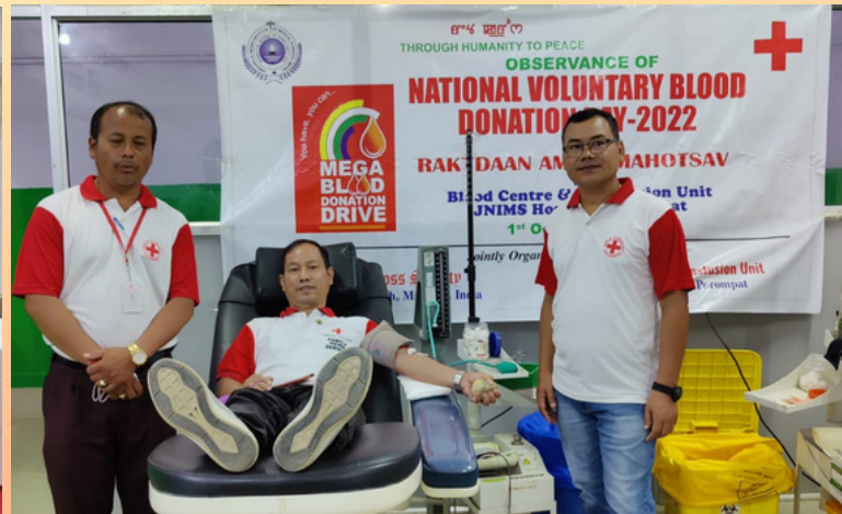
Observance of National Voluntary Blood Donation Camp as a part of Raktdaan Amrit Mahotsav by IRCS Imphal East District Branch, Manipur at JNIMS Porompat.