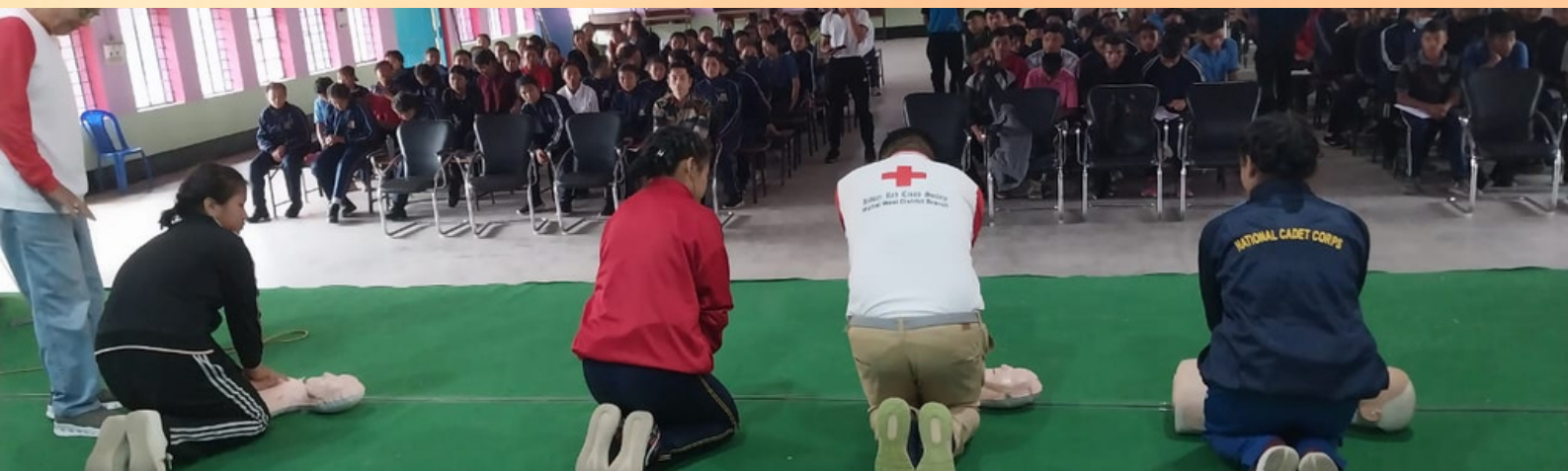
One day First Aid Training program was conducted at Jawahar Novodaya Vidyalaya, Khumbong (Imphal West). All together 115 NCC cadets participated in the program.