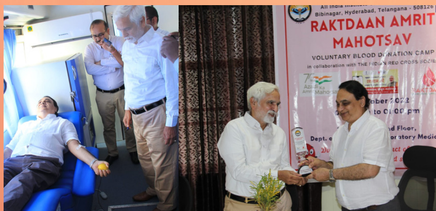
Red Cross Blood Centre conducted blood donation camp at All India Institute of Medical Services Bibinagar, Telangana