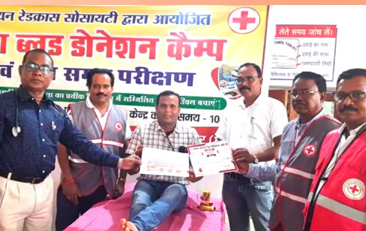
Blood donation camp, Kanker, Chhatisgarh