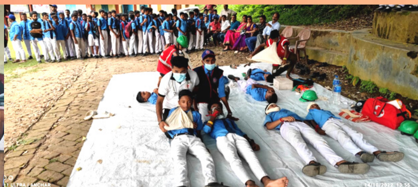
Indian Red Cross Society, Sonamura Sub-Divisional Branch organized a school safety cum mock drill on earthquake supported by SDM, Sonamura, Tripura