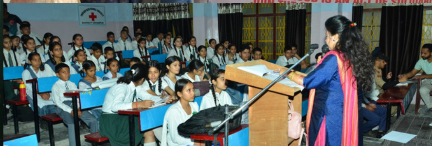
National Voluntary Blood Donation Day, J&K