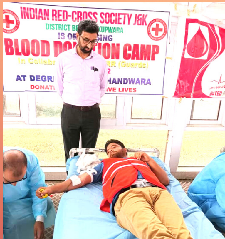
Blood donation camp, Kupwara district, J&K