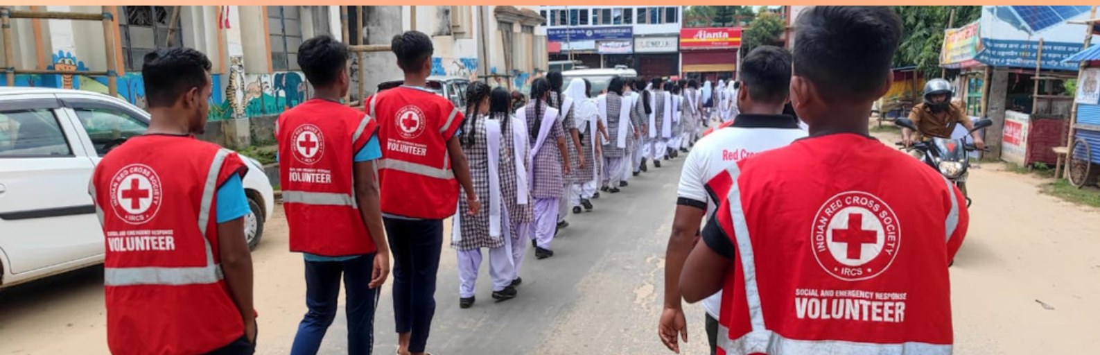
IRCS, Sonamura Sub-Divisional branch participated in a rally observation of IDDRR organized by Nagar panchayat, sonamura, Sepahijal, Tripura.