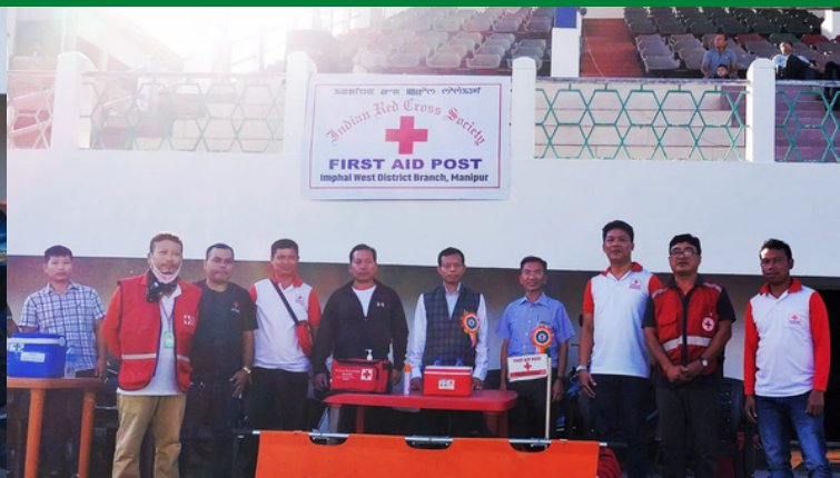
IRCS, Imphal West district branch opened first aid post in connection with the 6 days long 1st Inter District Polo Tournament at the oldest living Polo Ground ( Mapal Kangjeibung), Imphal West.