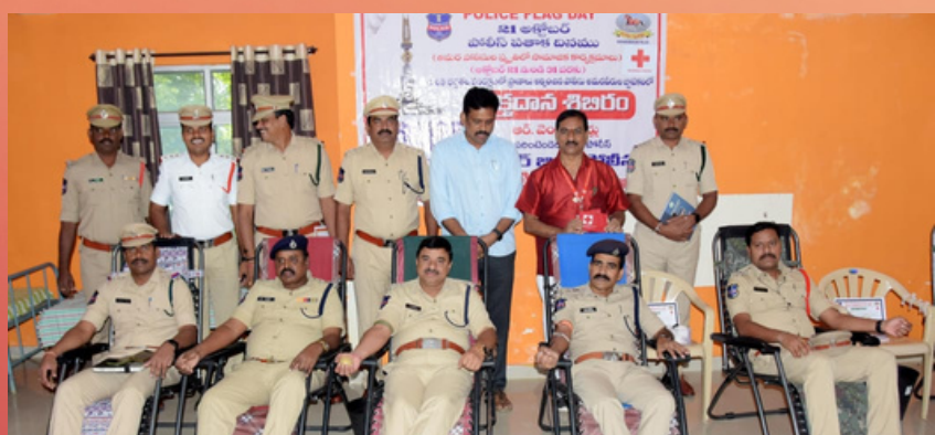
Blood donation camp was held on the occasion of Police flag day Mahabubnagar, Telangana