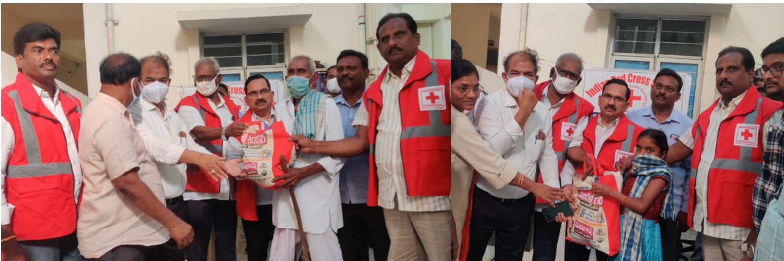
As part of the Pradhan Mantri TB Mukta Bharat programme, 65 TB patients from the villages of Gaurav Adivasi Mandal were provided with 3 months of nutritional food supplements at Guduru Health Center in the presence of TB Medical Officers of Mahabubabad District, Telangana.