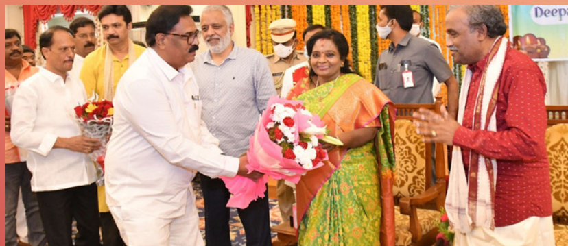
IRCS, Telangana state branch officials greeted Hon'ble Governor of the state smt. Tamilisai Soundararajan on occasion of Deepawali