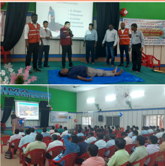
First aid training, Davengere Red Cross District branch, Karnataka