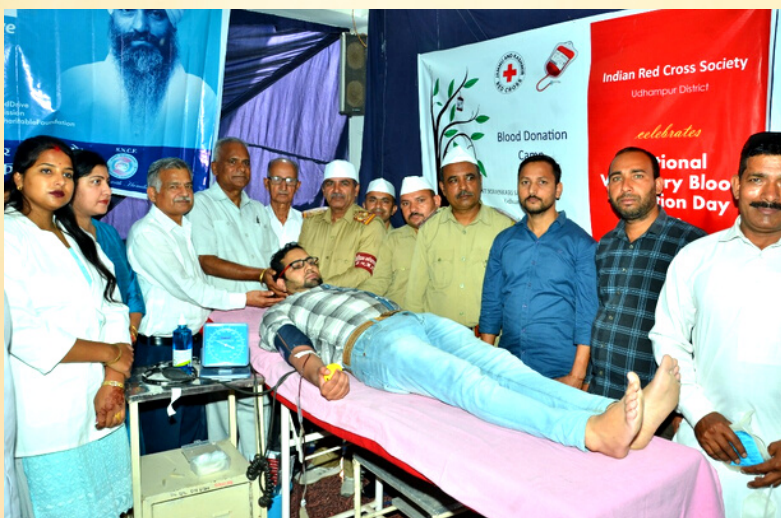
Blood donation camp, Udhampur, J&K