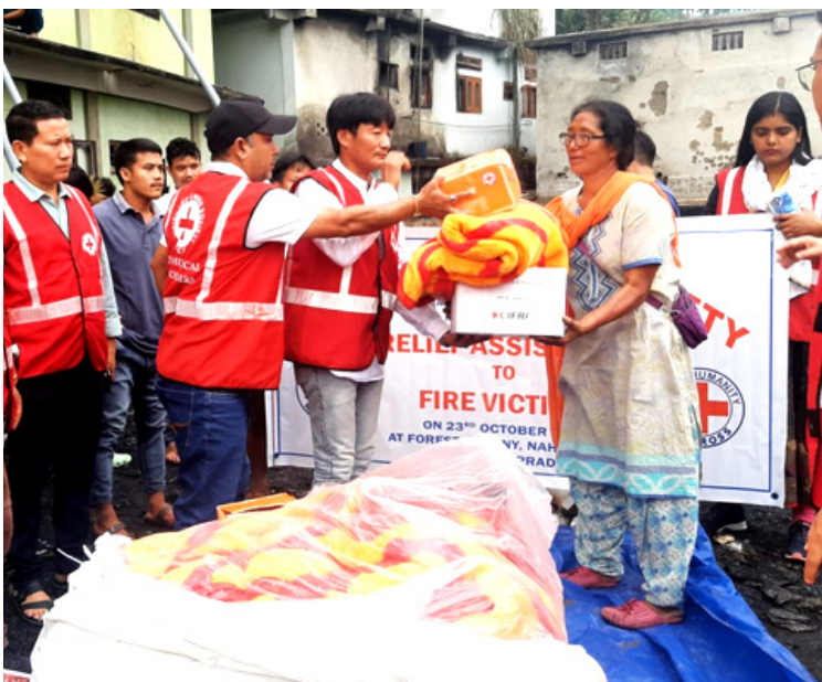
IRCS, Arunachal Pradesh, state branch, provided relief assistance to the fire victims at Naharlagun