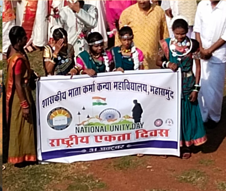
Celebration of National Unity Day, Mahasamund district, Chhattisgarh