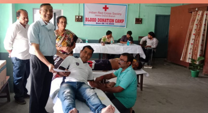
Blood donation camp at Red cross society Malda district branch, West Bengal