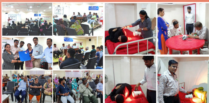
On the occasion of Gandhi Jayanti a free naturotherapy camp was organized at Red Cross Bhawan, Diwanpara Road, Bhavnagar, Gujarat.