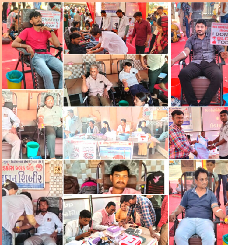
Blood donation camp, Bhavnagar, Gujarat