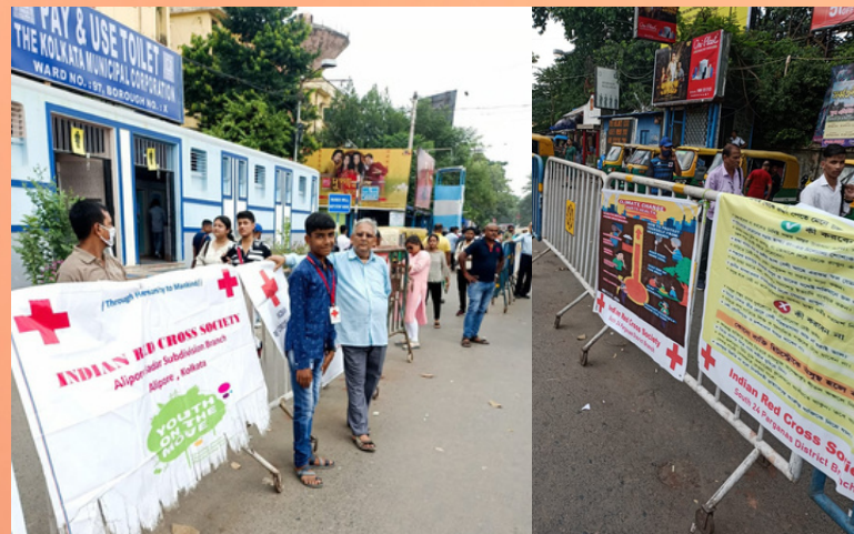
Celebration of National Voluntary Blood Donation Day, IRCS, South 24parganas