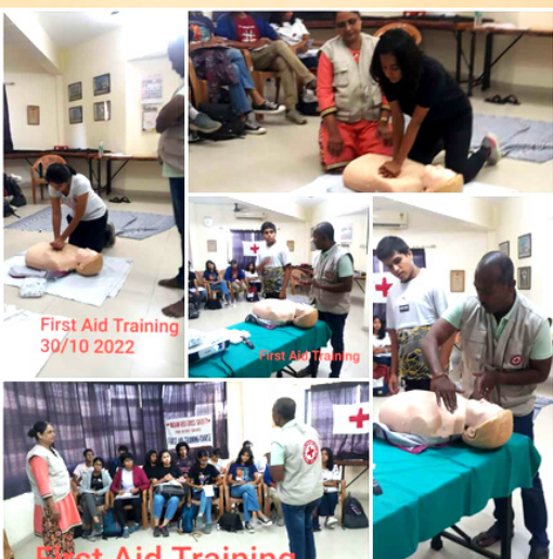
First aid cum medical camp, Ajeya Sanghati Club from tritia,24 South Pargana, West Bengal