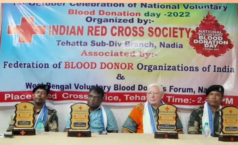
Celebration of National Voluntary Blood Donation Day by IRCS, Tehatta Sub-Div Branch, Nadia district branch, West Bengal