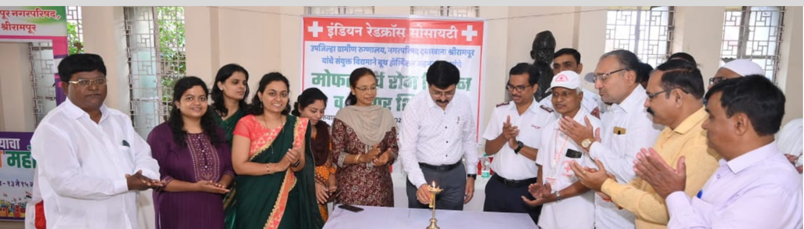
Distribution of free medicines at the medical camp held at Shrirampur sub-district branch, district Ahmednagar, Maharashtra