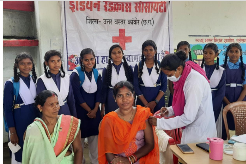
A Covid booster dose camp was also organized at Red Cross Society, Kanker, Chhattisgarh.