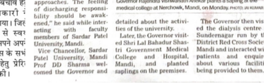
गवर्नर राजेंद्रा विश्वनाथ अरेंकर ने मण्डली के मेडिकल कॉलेज का दौरा किया।

TRIBUNE NEWS SERVICE MANDLI, JULY 11 Governor Rajendra Vishwanath Arlekar today said that the reflection of society should be visible in the condition of the universities. He said that universities like Nalanda and Taxila were famous because of their teachers and the environment they provided. The Governor today visited Sardar Patel University and SLBS Government Medical College in Mandli.