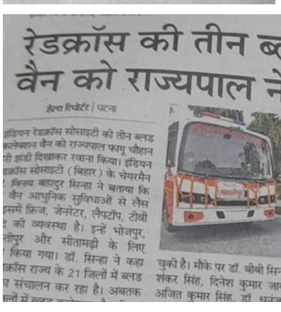
रेडक्रॉस की तीन ब्लड कलेक्शन वैन को राज्यपाल ने किया रवाना