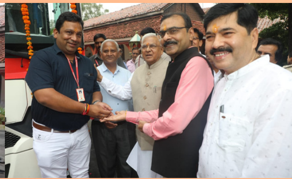
Hon'ble Governor of Madhya Pradesh Shri Mangubhai Patel flagged off 3 blood collection vans gifted by IRCS, NHQ