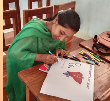
Essay competitions, painting and various programs were organized on the occasion of World Hepatitis Day, Dhamtari, Chhattisgarh