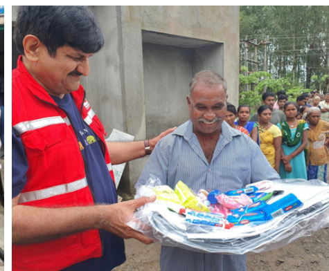
Distribution of relief materials amongst flood affected people, Navsari, Gujarat