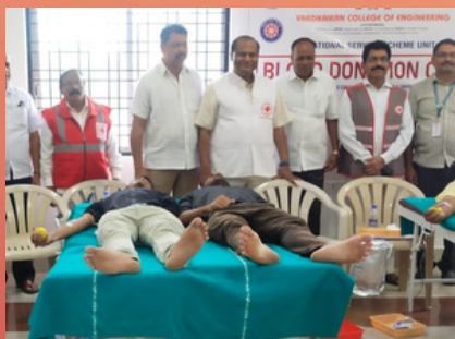
Blood donation camp, Hyderabad, Telangana. 304 units of blood were collected