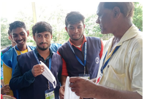
Masks distribution amongst students, West Bengal