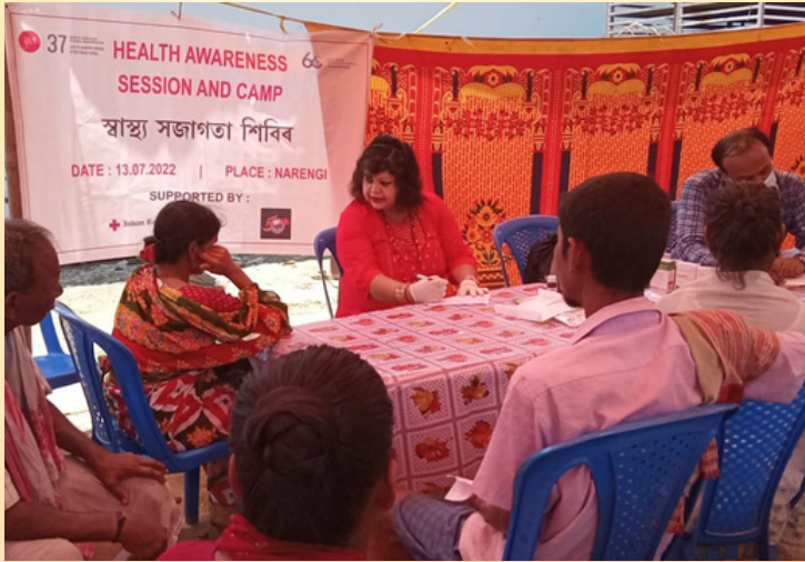
Health Awareness Camp Narengi, Guwahati, Assam