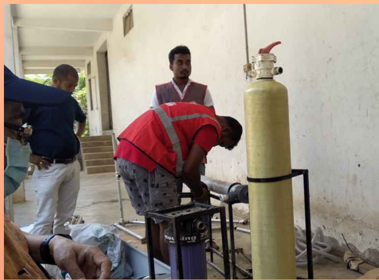
Water Purification Units at IRCS Regional Warehouse, Noonmati, Guwahati.