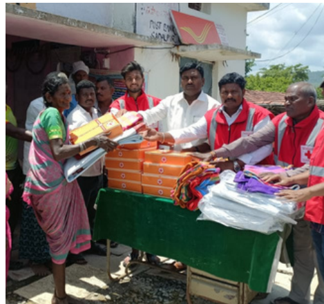
In Telangana, Adilabad Red Cross teams have visited flooded houses & distributed tarpaulin sheets, blankets & hygiene kits at Bela Mandal.