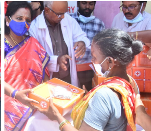
Distribution of the medical & health hygiene kits amongst flood-affected families at Farampet relief center, Yanam, Puducherry