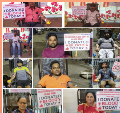
Blood donation camp, Bhavnagar district branch, Gujarat