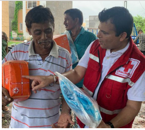
Flood situation was created in Borsad (District- Anand, Gujarat) due to heavy rains. IRCS, Gujarat State Branch responded actively and distributed hygiene kits, kitchen sets and mosquito nets to the affected people.