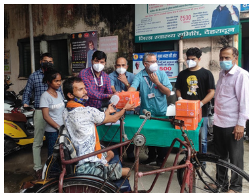
Distribution of hygiene kits amongst TB Patients in S. P. S. Hospital, Rishikesh, Uttarakhand