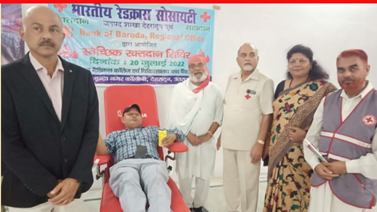
A blood donation camp was organized by IRCS, Dehradun & Bank of Baroda regional office Dehradun. Thirty units of blood were collected

A rare feat indeed 224 times BLOOD DONATION Regular - 182 times + Apherisis - 42 times