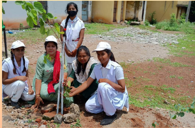
Tree plantation, Balod, Chhattisgarh