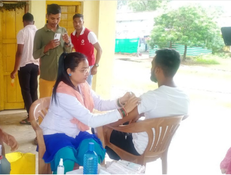
A Covid booster dose camp was organized at Red Cross Society, Dhamtari, Chhattisgarh.