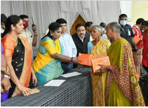
Distribution of hygiene kits, Aswapuram Mandal, Telangana