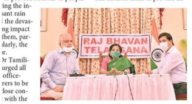
गवर्नर डॉ. तमिलसाई अंदारराजन ने 33 रेड क्रॉस शाखाओं के अधिकारियों के साथ वीडियो कॉन्फ्रेंस में बातचीत की।

HYDERABAD • Tells them to play active role in providing relief to rain-people Vernor Dr. Tamilsai andararajan held a video conference with all the district office-bearers of the 33 Red Cross Society and reviewed their activities to provide succor to people in the instant rain.