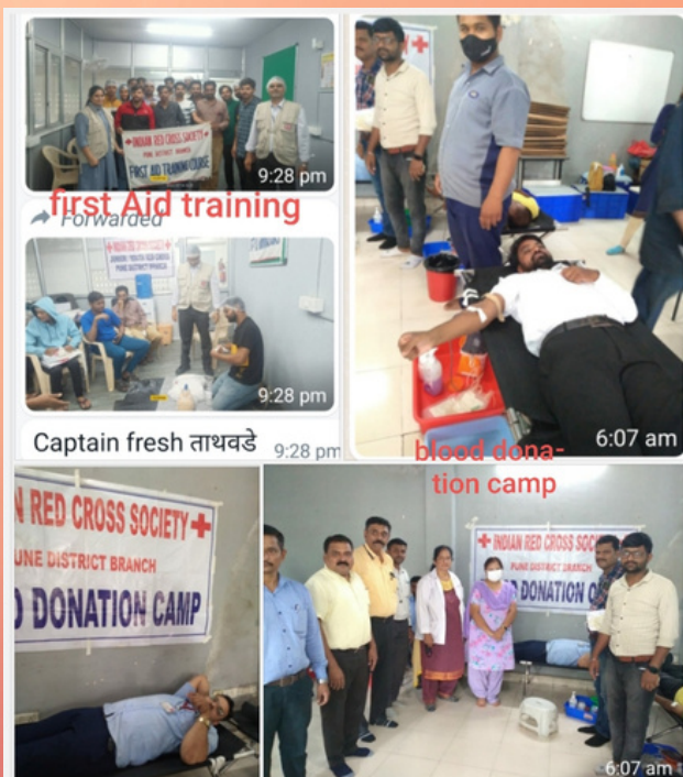
A blood donation drive was conducted by the Pune District Branch, in association with Sahyadri hospital. Forty three generous donors donated blood.