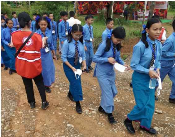
Distribution of masks, Imphal East District Branch, Manipur