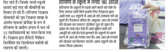
सैनेटरी नैपकिन मशीन का एक कालेज में स्थापित किया जा रहा है।

हर जिले में विहित किए गए दो-दो महाविद्यालय रेडक्रॉस कालेजों में सैनेटरी नैपकिन मशीनें लगाए जाएंगी। रेडक्रॉस प्रोजेक्ट के तौर पर 50 महाविद्यालयों का चयन किया गया है। पायलट प्रोजेक्ट के तहत चुने गए 50 कालेजों में सैनेटरी नैपकिन मशीनें लगाई जाएंगी।