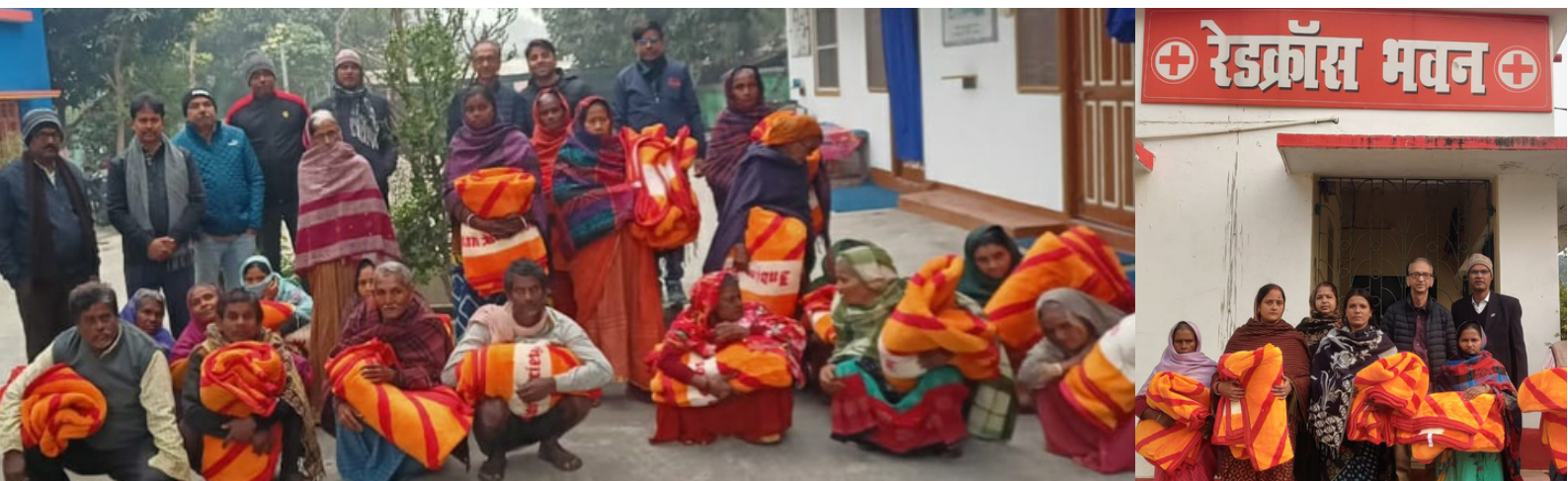
Distribution of blankets, Katihar, Bihar