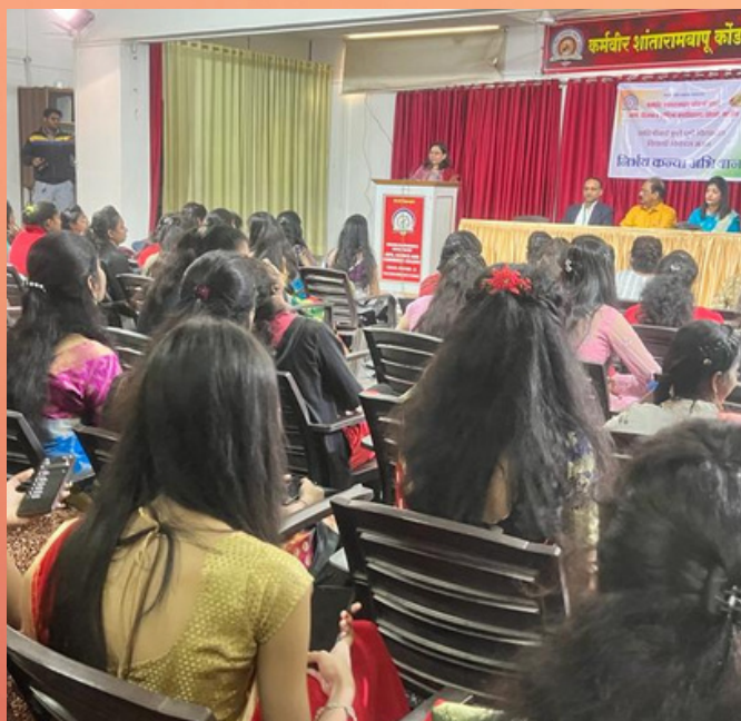
A talk on women's health was held under Nirbhay Kanya Abhiyaan at Pune University, Maharashtra.