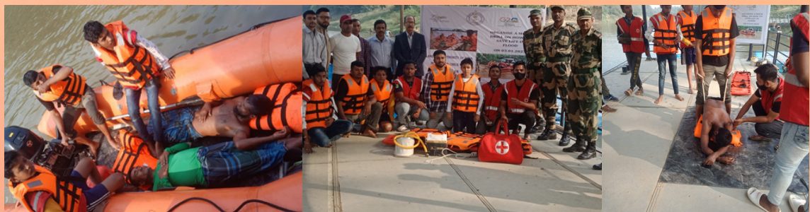
Disaster management mock drill and flood rescue operation conducted in the Gomati river of Sonamura Sub-Division, in Sipahijala district, Tripura