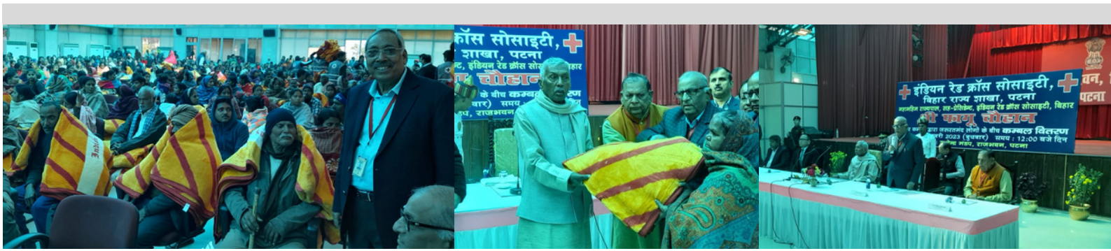
Distribution of blankets, Patna, Bihar