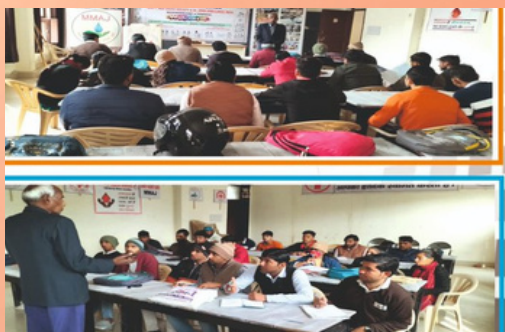
First aid training, Narnaul, Haryana