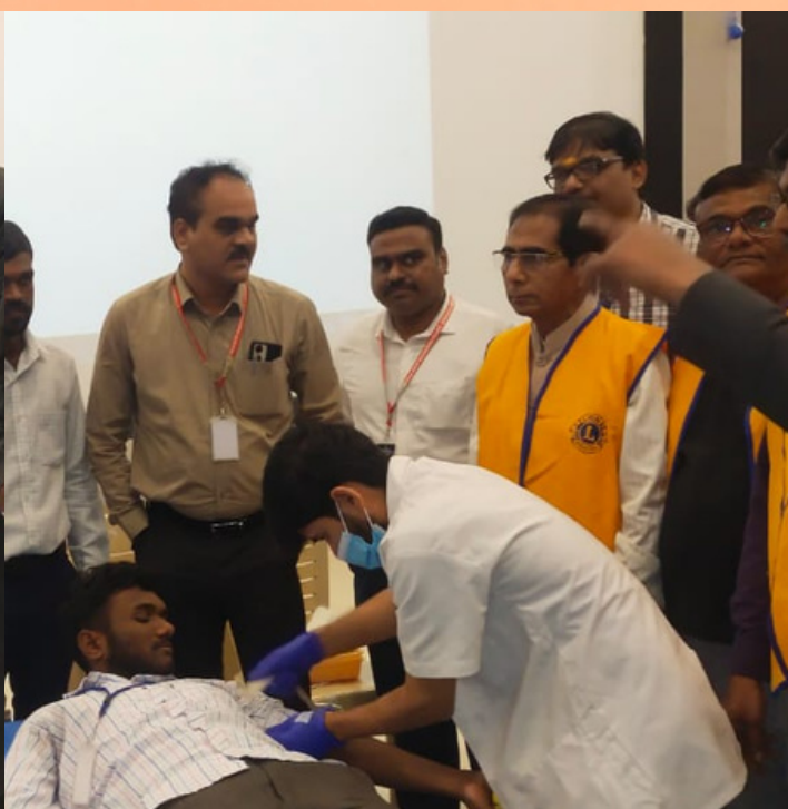
Mega blood donation camp was held at Malla Reddy Engineering College, Maisammaguda, Dhulapally, Secunderabad, Telangana. 224 units of blood were collected.