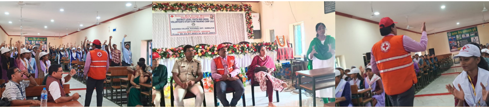
A District level Youth Red Cross Camp was held at Kuchinda College, Sambalpur, Odisha