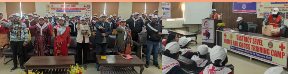
District level Youth Red Cross Training Camp, Palwal, Haryana