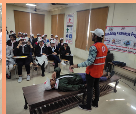
Road Safety Week, Palwal, Haryana