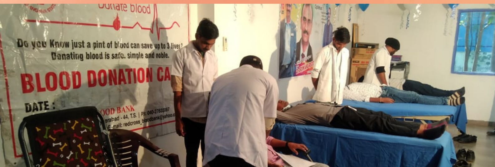
Blood donation camp, Hyderabad, Telangana