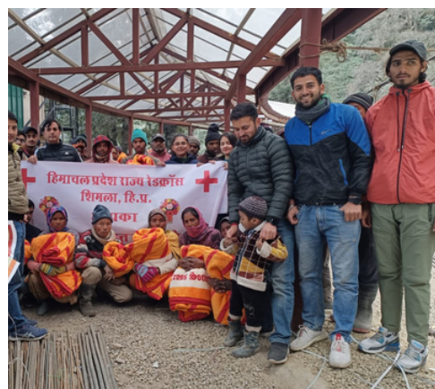
Distribution of blankets, Shimla, Himachal Pradesh