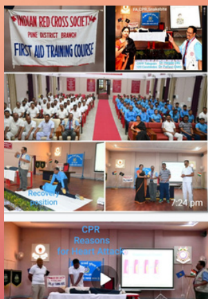
First Aid and CPR training for 120 CRPF jawans in Talegoan, Maharashtra.