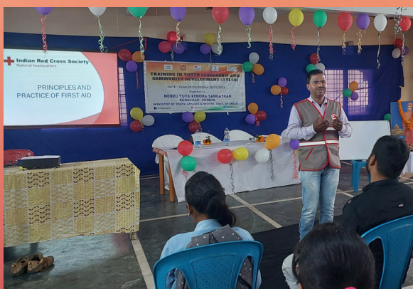
42 Nehru Yuva Sangathan Volunteers from various parts of Keonjhar received First Aid and Disaster Preparedness Training.