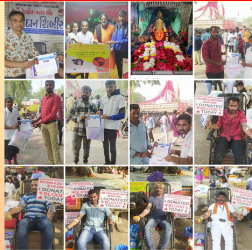
Blood donation camp was held at Lokdaira, Khodiyar Mandir Rajpara, Bhavnagar, Gujarat