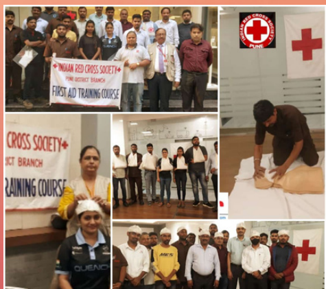
First aid training, Chinchwad, Pune, Maharashtra