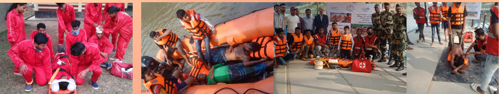
Apada mitra volunteers training programme at CTI, Gokul Nagar, Sipahijala, Tripura