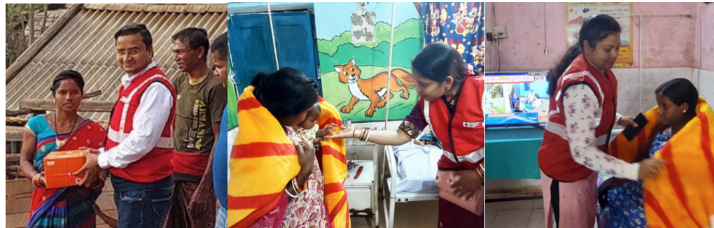
Distribution of blankets, hygiene kits and soaps, Keonjhar, Odisha