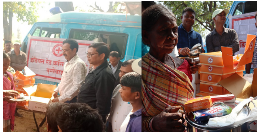
Distribution of hygiene kits, Dantewada, Chhattisgarh