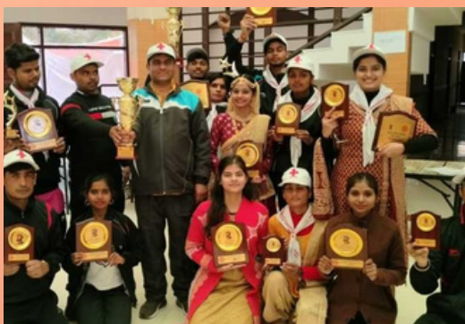
IRCS, Telangana State Junior Red Cross volunteers Won 11 awards at the "Inter State Junior Red Cross Training Camp in Kurukshetra, Haryana