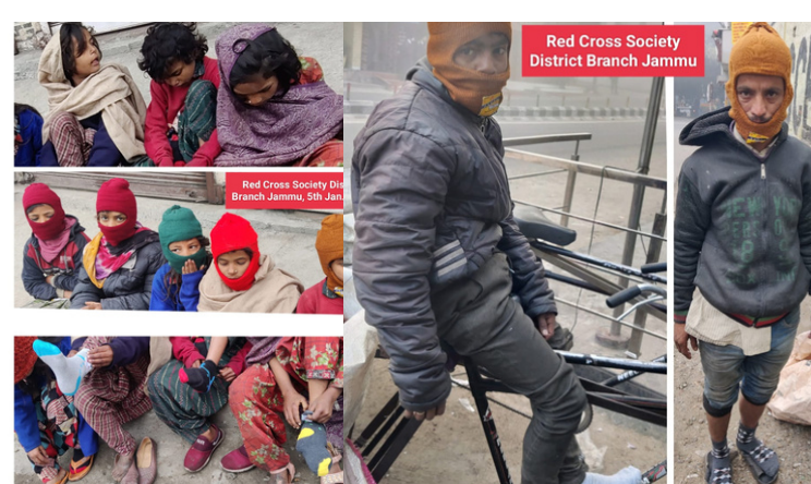
Distribution of wollen cloths, Jammu