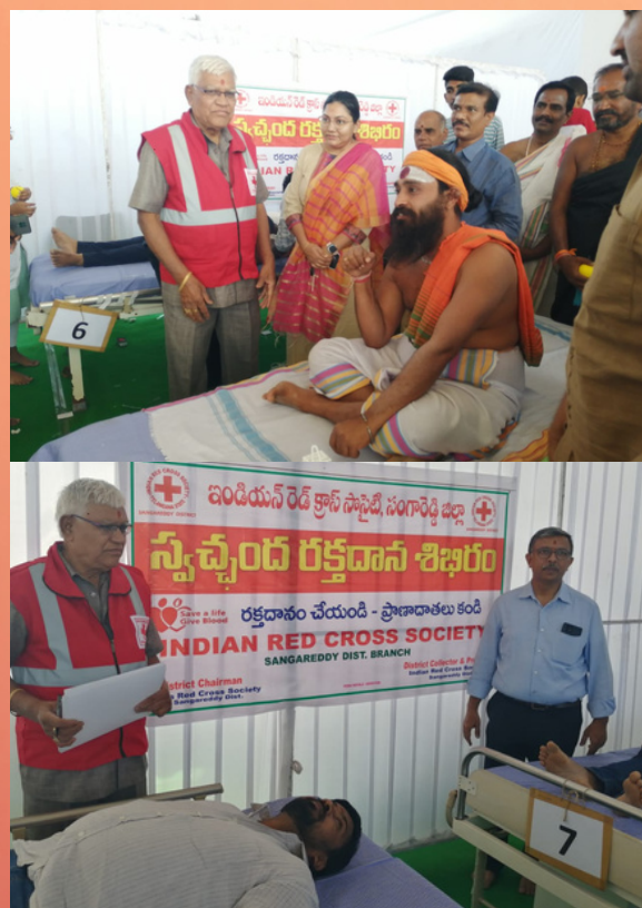
Blood donation camp was held at Jyotirvasu Vidya Peetham, Sangareddy, Telangana. 336 units of blood were collected.