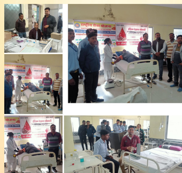
Blood donation camp, Surajpur, Ramanuj Nagar, Chhattisgarh