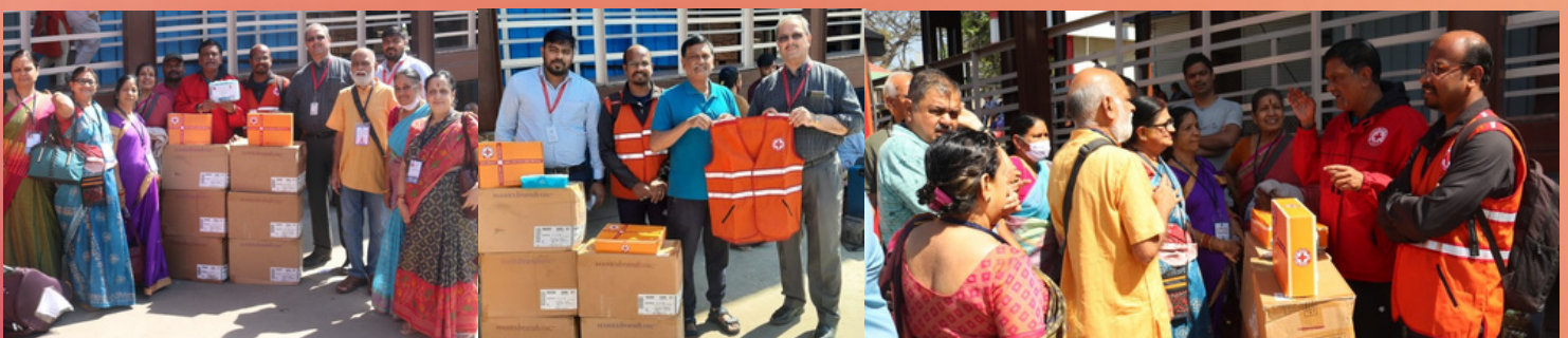
The Karnataka Red Cross State Branch is providing pilgrims with a large number of masks, hygiene kits, and first aid kits designed specifically for the Special Kashi Vishwanath Darshan trains. Volunteers from the state branch are also travelling with the pilgrims on each train to provide assistance and support as needed. Each train carries about 1500 pilgrims.