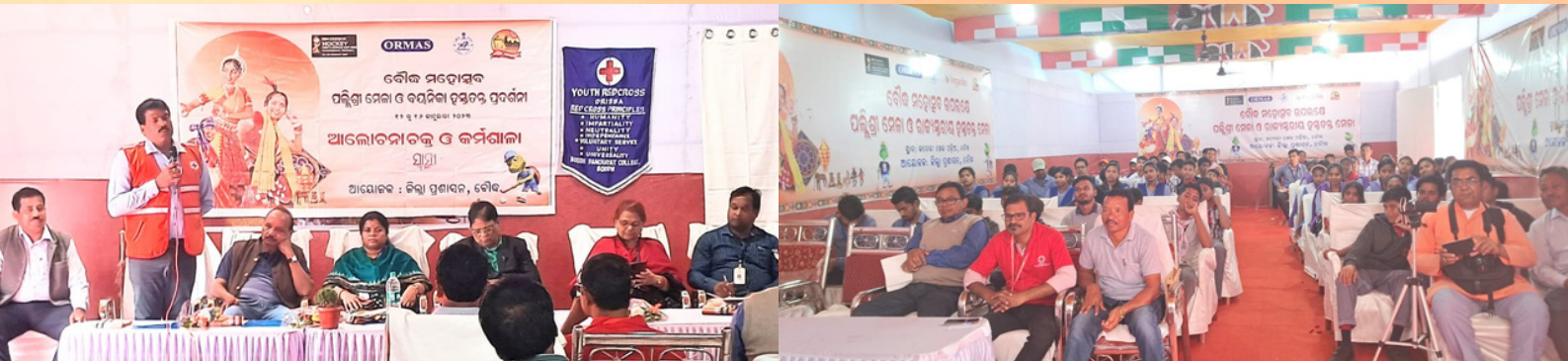
A seminar on "Health for All" was held at Boudha Mahotsav Ground, Boudh, Odisha