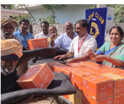
Distribution of blankets and hygiene kits, Mahabubnagar, Telangana