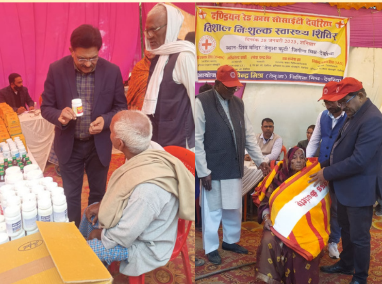
Health checkup camp Deoria, U.P