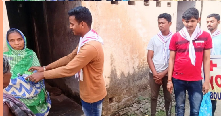
The Youth Red Cross of Boudh Panchayat College commemorated World Leprosy Eradication Day in the Leprosy Colony, Boudh district, Odisha. Dry food and sweets were distributed to the leprosy patients.