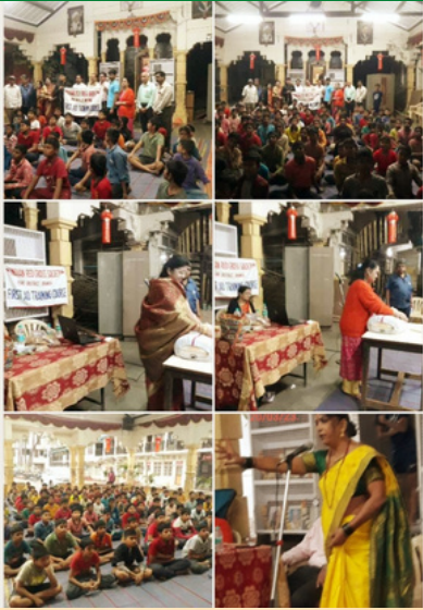
A First aid training program was held at Vidhyarthi Gruh, Pune, Maharashtra. 130 participants attended the training program.