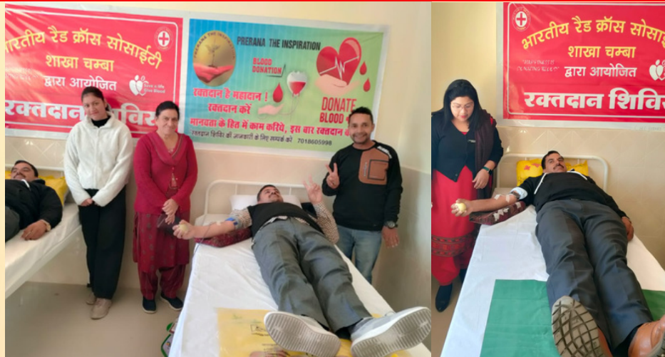
Blood donation camp, Chamba, Himachal Pradesh