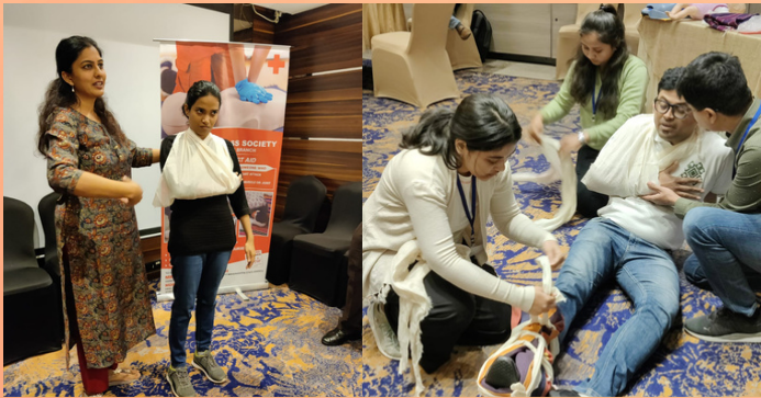
IRCS Maharashtra state branch concluded 3 days First aid training program at Aga Khan Habitat India unit, Mumbai, Maharashtra