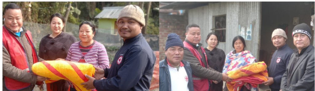
Distribution of blankets, Manipur