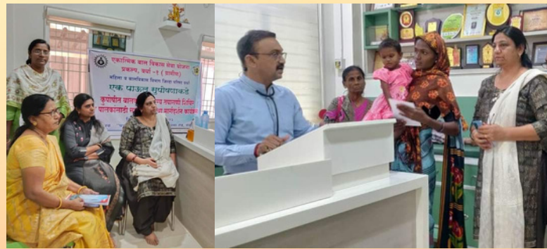
IRCS, Wardha, district branch under the Integrated Child Development Services Scheme Project organized a health check-up camp