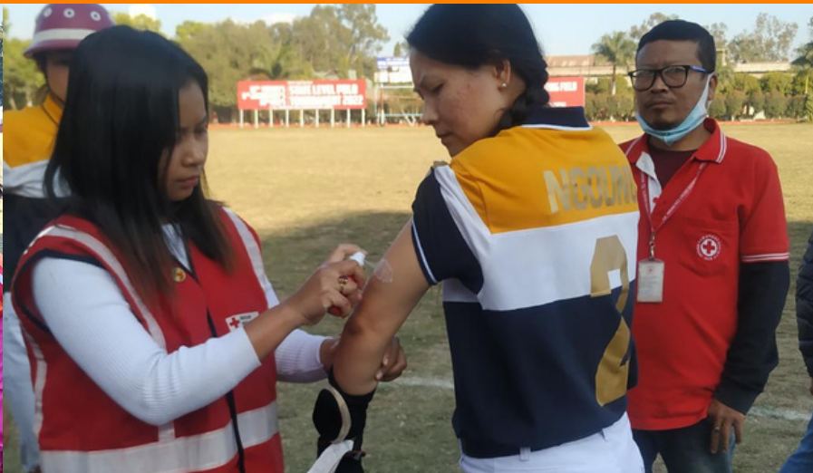
Women volunteers of IRCS, Imphal West District Branch rendered first aid service to injured polo players.