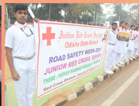
Road Safety Week, Bhubaneshwar, Odisha