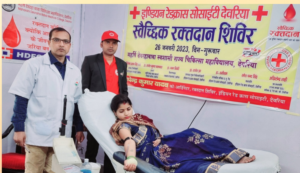
Blood donation camp, Deoria, Uttar Pradesh