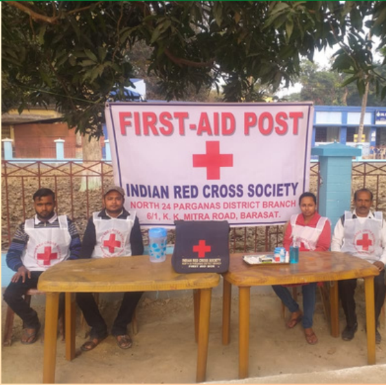
First aid post at Banipur Dr. B .R Ambedkar Sports School, North 24 Parganas, West Bengal