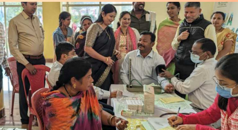
Health camp, Bastar, Chhattisgarh