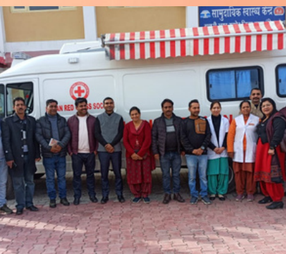
Various types of tests were conducted by the mobile health unit, Shimla, H.P. More than 60 patients were examined.