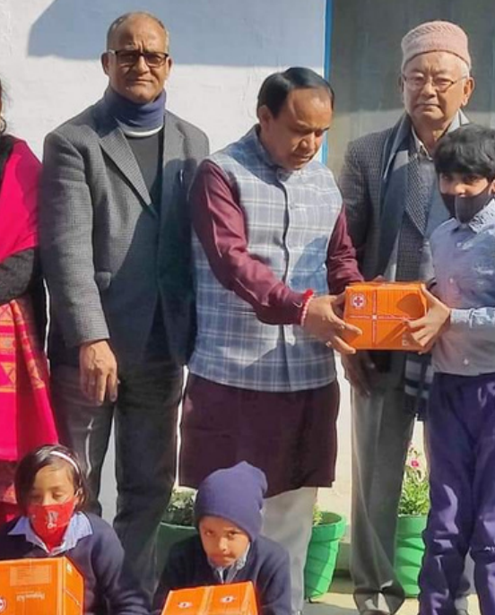
Distribution of hygiene kits Dehradun, Uttarakhand