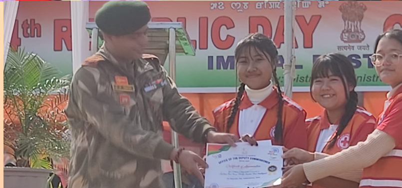
Republic Day was celebrated all across the IRCS State/UT branches.