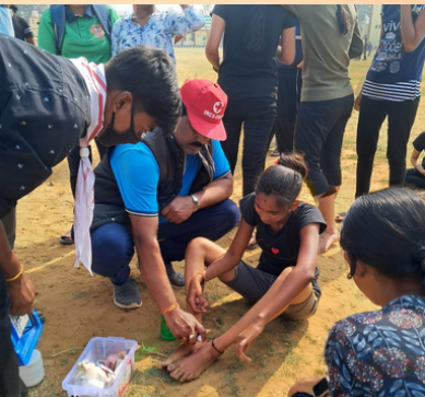
First aid services being provided by YRC volunteers at the annual athletic meet Boudh Panchayat College, Boudh, Odisha