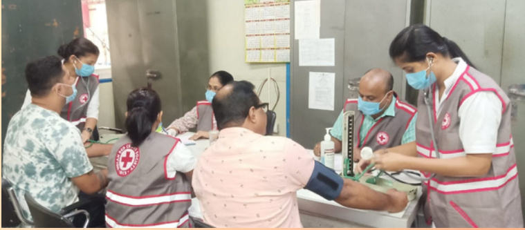
Health camp was organized by Dharampal Premchand Ltd., Changsari, Assam in collaboration with IRCS, GDB and Blood Bank GMCH.