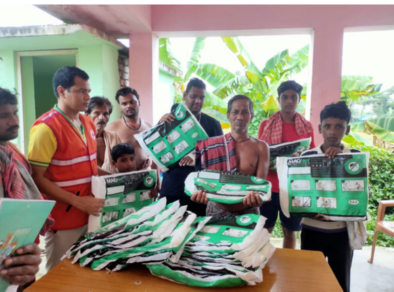
Distribution of mosquito nets and tarpaulins amongst flood affected people, Odisha