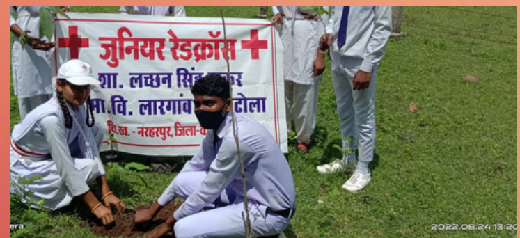
Tree plantation drive, Narharpur, Chhattisgarh