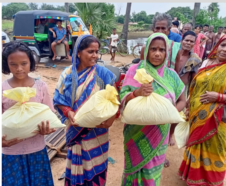
Distribution of food packets amongst the poor and vulnerable affected by floods in Odisha.