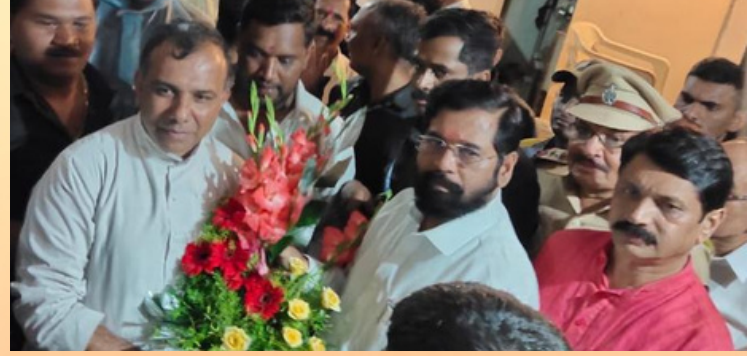
Hon'ble Chief Minister of Maharashtra visited Tapola primary health centre, Panchgani being run by Red Cross