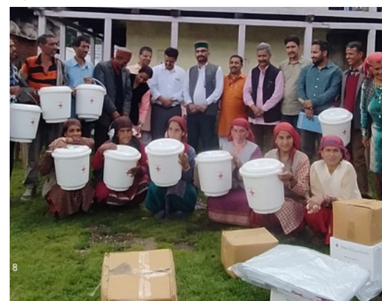
Distribution of relief material to cloud burst affected people of VPO, Baga Sarahan, tehsil, Nirmand district, kullu, Himachal Pradesh.