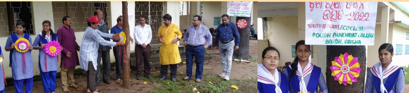
Youth Red Cross & Eco club, celebrated Raksha Bandhan in a unique way by tying Rakhi around the trees at Boudh, Odisha