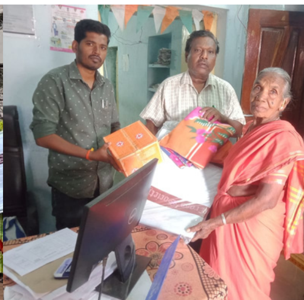
Distribution of Tarpaulin, Bed Sheet & Hygiene Kits to victims of house damaged due to recent heavy rains Tahsildar, Revally through Red Cross Wanaparthy, Telangana