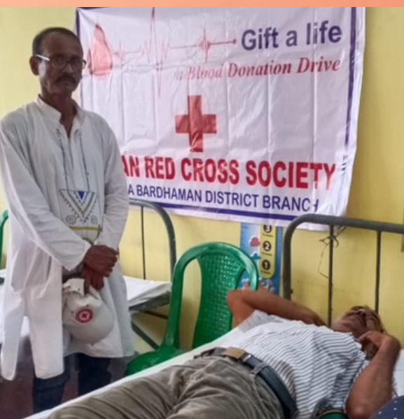
Blood donation camp was held on Independence Day, Purba Bardhaman district Branch, West Bengal