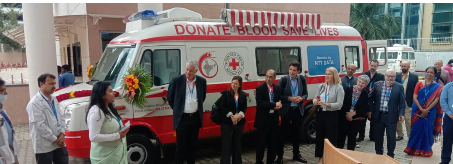
The fully equipped BCTV vehicle donated by NTT DATA Bengaluru, was inaugurated by the visiting dignitaries at the NTT DATA Bengaluru, campus.