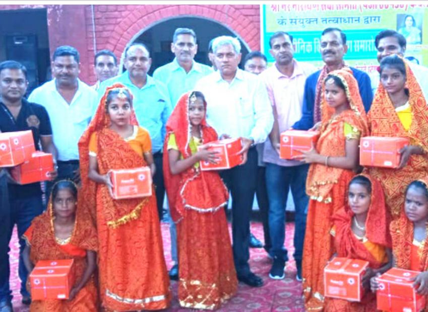
Distribution of hygiene kits in the slum areas, Kaithal, Haryana.