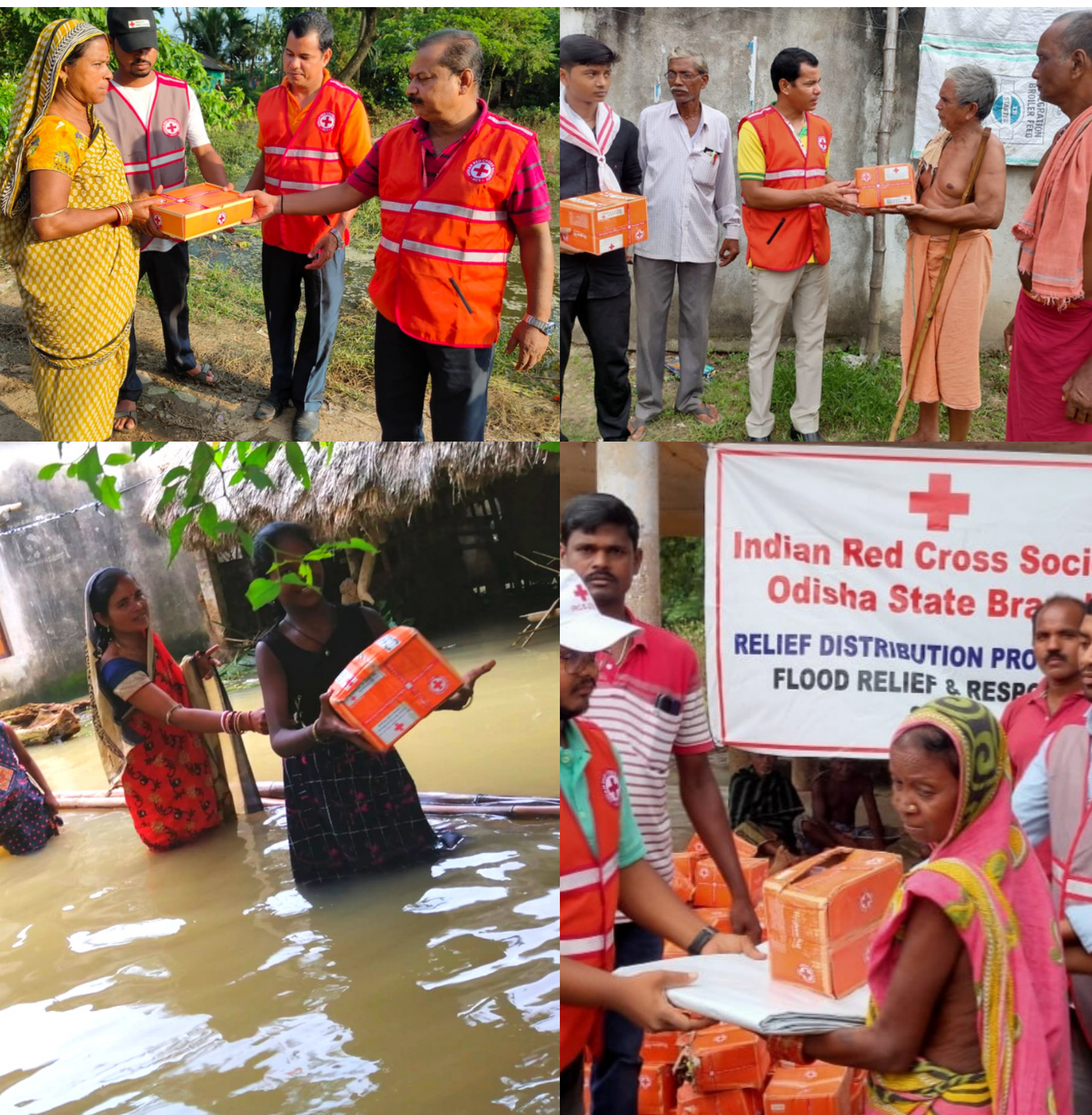
Distribution of hygiene kits to the needy & vulnerable in several districts of Odisha.