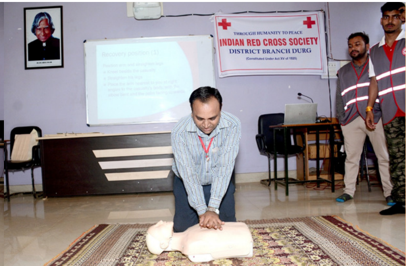
First aid training, Durg, Chhattisgarh