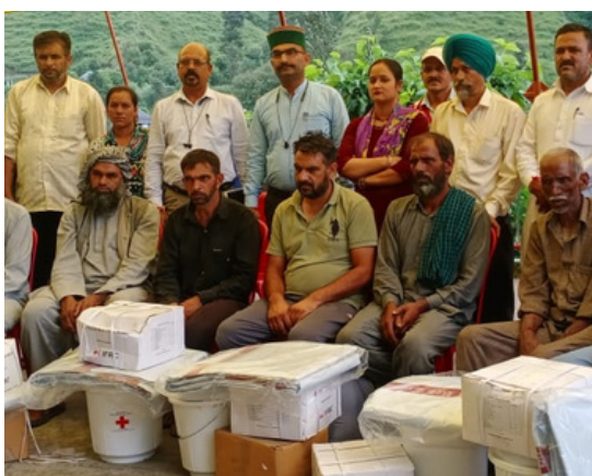
Distribution of relief material to flood victims of Mandi, Himachal Pradesh.