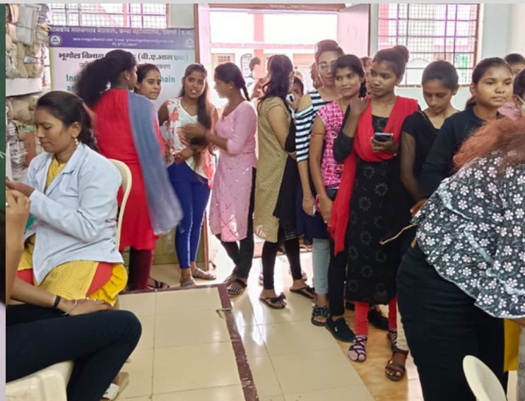
Covid Vaccination camp, Dhamtari, Chhattisgarh