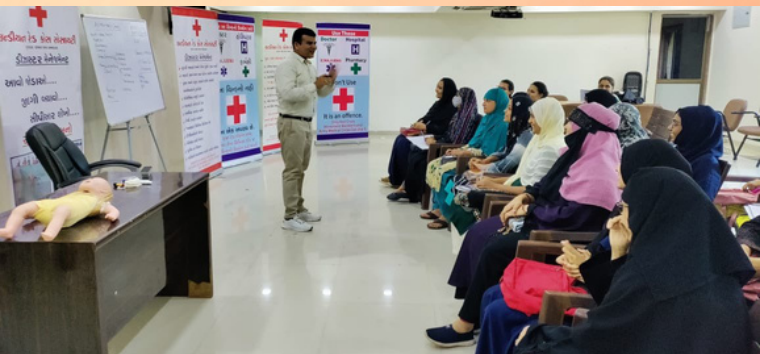
Red Cross, Gujarat held an interactive event for the youth. The event centered around discussions on Disaster Management Training