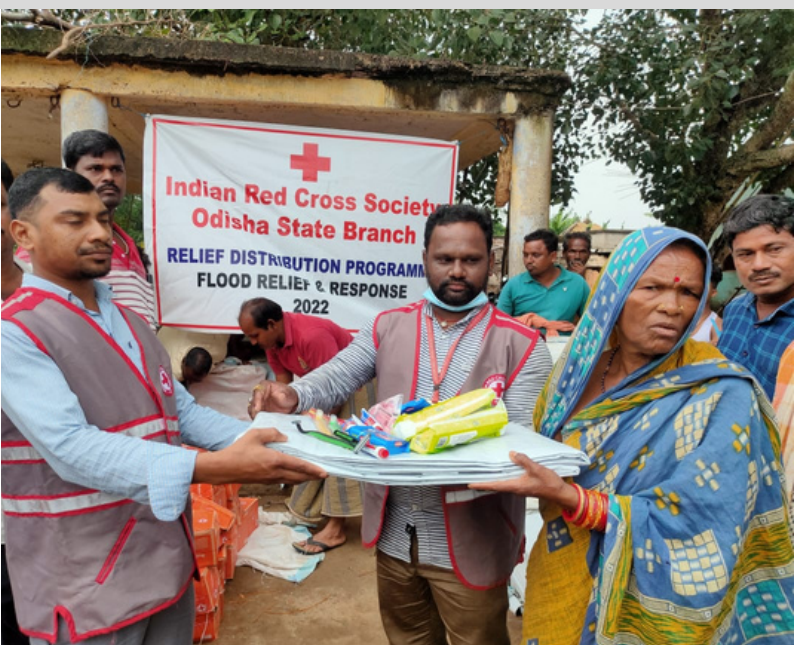
Distribution of relief materials amongst the poor and vulnerable affected by floods in Odisha