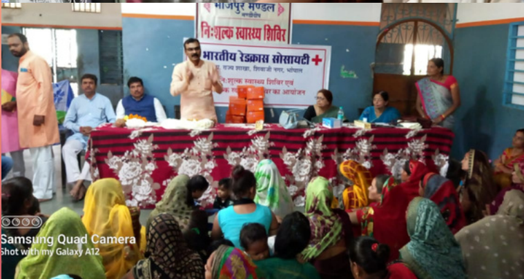
Free health camp, Bhopal, M.P