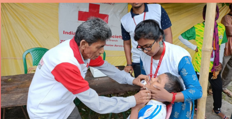
IRCS, South 24 Parganas, West Bengal, volunteers provided first aid