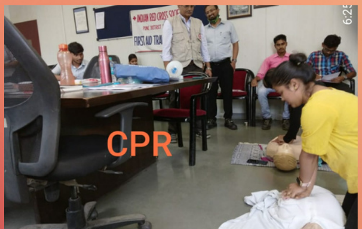
First aid training, Pune, Maharashtra