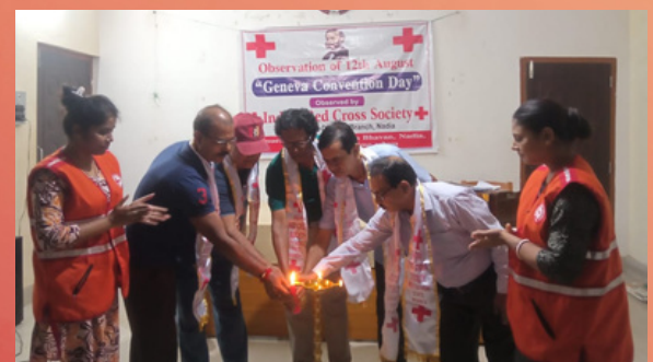
IRCS, Tehatta Sub Division Branch, Nadia, West Bengal, observed Geneva Conventions Day