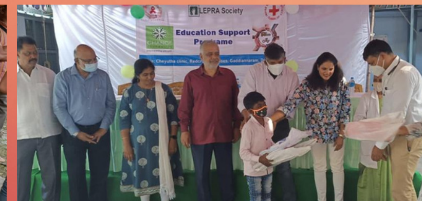
Education Support Program for HIV AIDS affected students was conducted at the Red Cross premises in Gaddiannaram suburb in Hyderabad, Telangana