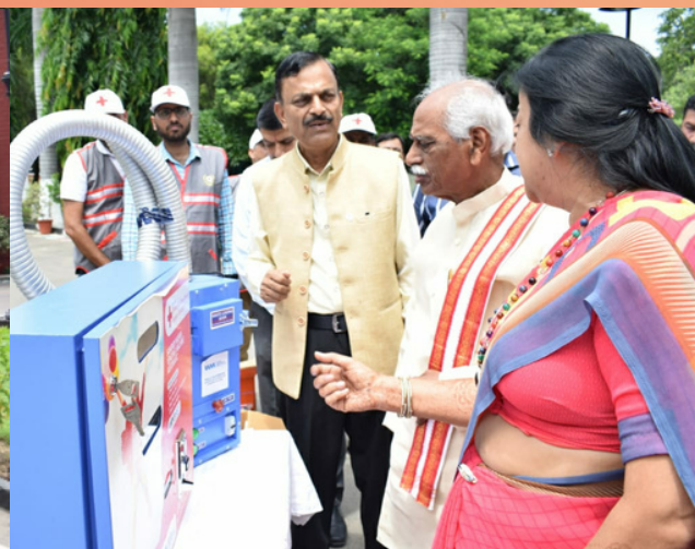
For the convenience of blood donors, the blood collection van received through IRCS, NHQ was flagged off by Hon'ble Governor of Haryana, Mr. Bandaru Dattatreya for blood bank at Panipat.