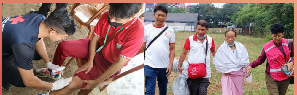
First aid post was opened on the occasion of 57th Hunger Marchers Day, 27th August, 2022 at DM University campus, Imphal, Manipur.