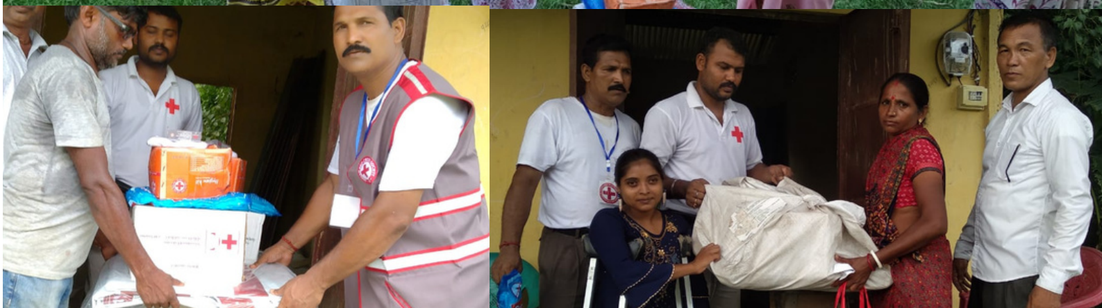
Distribution of hygiene kits and relief items amongst Assam flood victims