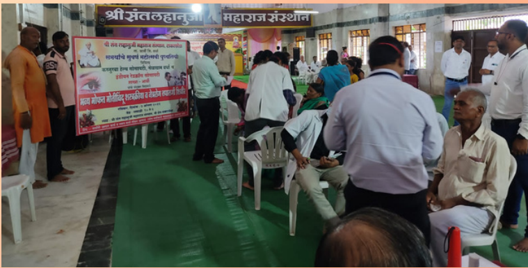
Eye check up camp, Arvi, Maharashtra