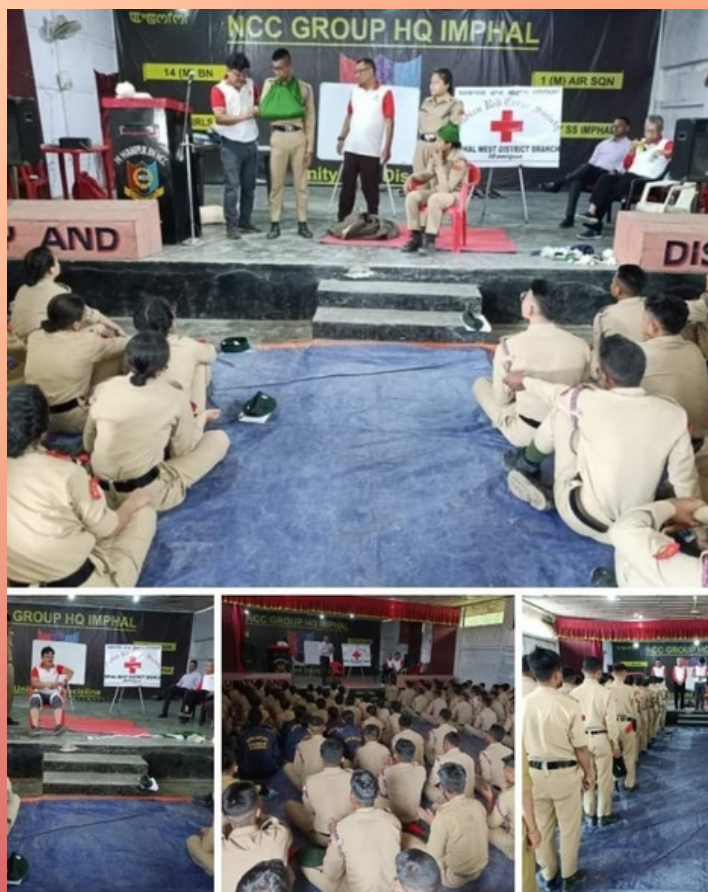
On International Humanitarian Day, IRCS, Imphal West District Branch conducted a First aid awareness program for NCC Cadets, Imphal.