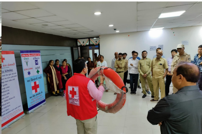
More than 70 officials of GSRTC participated in Disaster Management Training Program organized by Indian Red Cross Society Gujarat State Branch