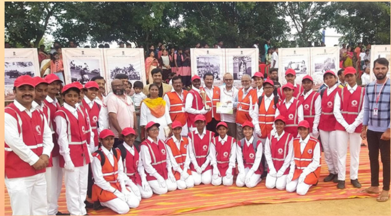
YRC volunteers of IRCS, Hassan district branch, Karnataka participated in the Independence Day parade. The team was awarded second prize for the parade.