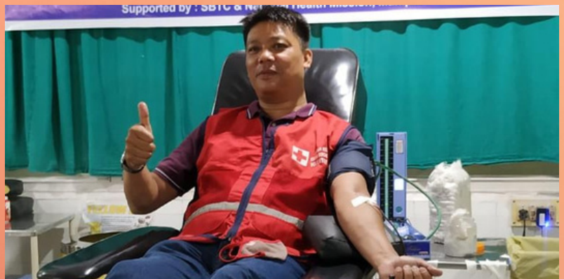
In observance of Patriot's Day of Manipur, 8 volunteers of IRCS, Imphal West District Branch donated blood at RIMS, Imphal.