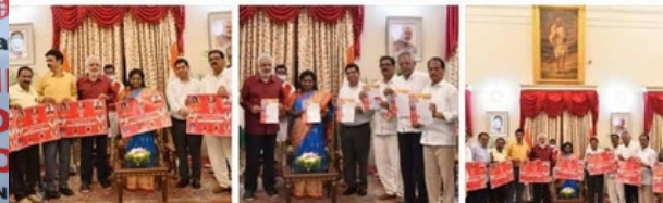
Hon'ble Governor of Telangana, Dr. Tamilsai, flagged off four mobile blood collection ambulances. The Governor handed over the keys of the blood collection vans to Hyderabad, Nizamabad, Hanumakonda and Karimnagar district branches. She also launched posters of YRC/JRC of Telangana state branch.