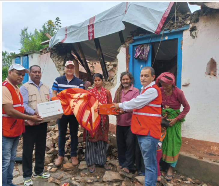
Distribution of relief items, Tehri Garhwal, Uttarakhand