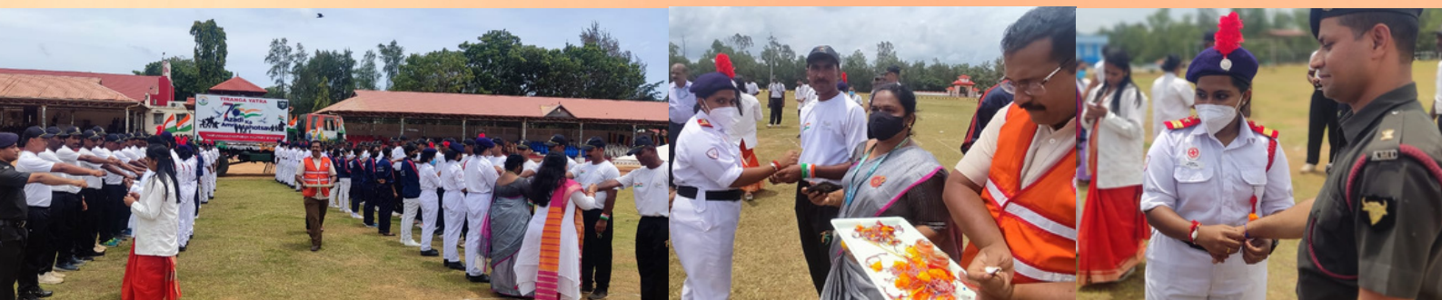
Youth Red Cross Cadets of the Kerala State Branch celebrated Raksha Bandhan