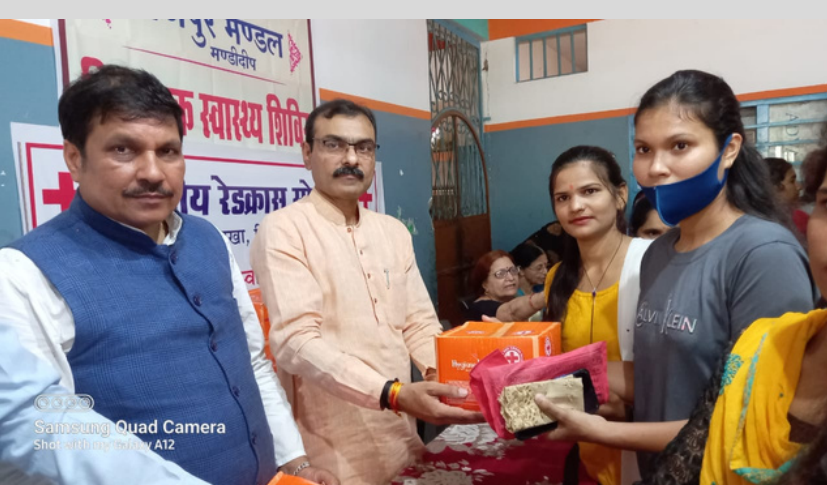
Distribution of hygiene kits, Bhopal, M.P