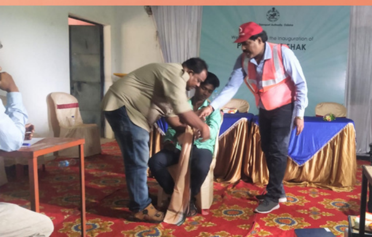
Emergency first aid training, Boudh, Odisha