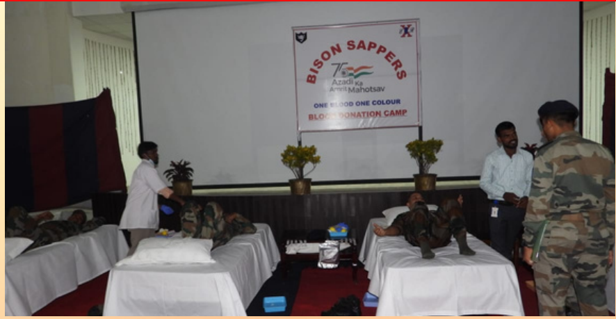
2 Blood donation camps were conducted at Secunderabad, Telangana