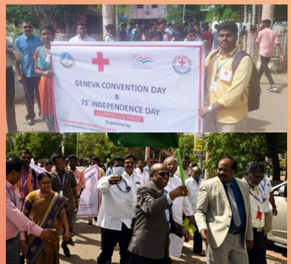
IRCS Trichy, Tamil Nādu celebrated the Geneva Convention Day