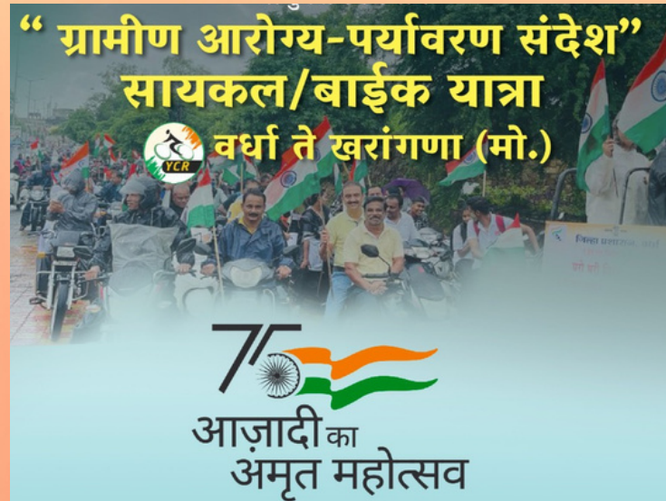
A rural health and environment awareness rally was conducted by IRCS, Wardha district branch, Maharashtra.