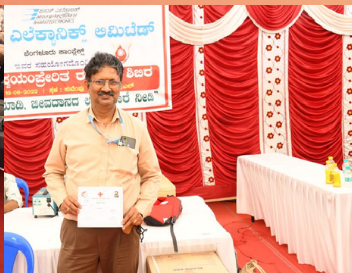
Blood donation camp, IRCS, Karnataka state branch