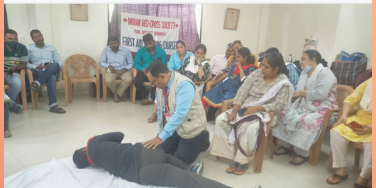
First aid training for teaching staff of Dastur School, Pune, Maharashtra