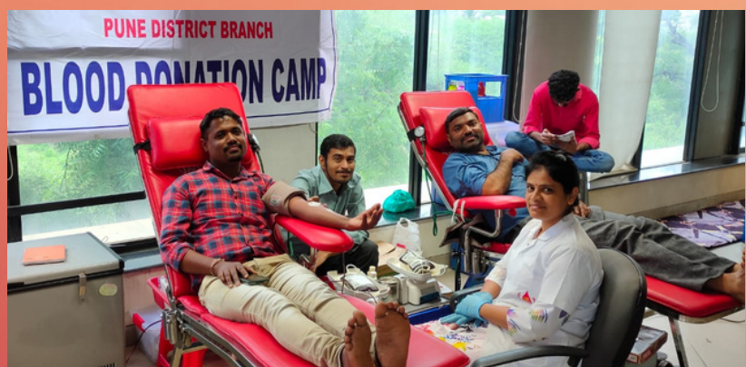
IRCS, Pune, district branch along with Sahyadri Hospital organized Blood donation camp at Godrej company complex, Pirangut