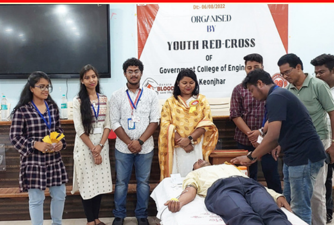
Blood donation camp was organized by Youth Red Cross unit of Govt.College Of Engineering, Keonjhar, Odisha