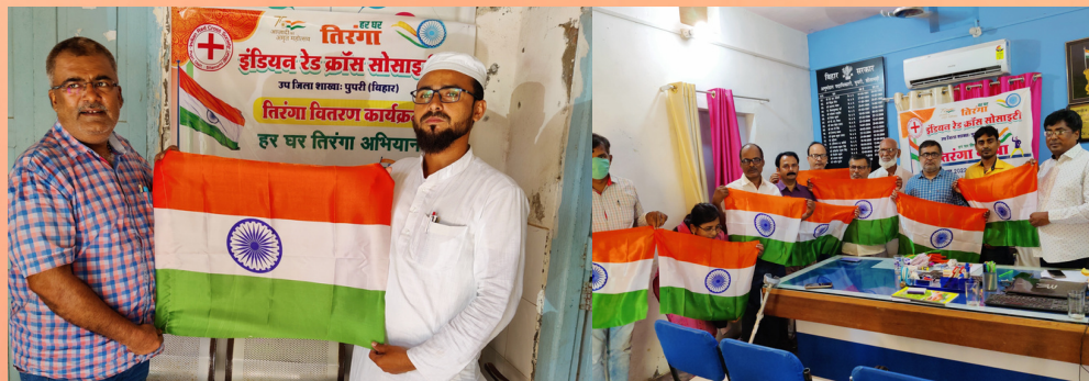
Distribution of flags to common masses, Pupri, Bihar