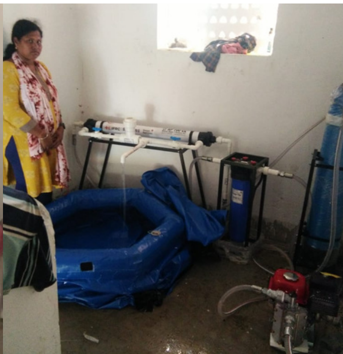
IRCS, Odisha Branch installed RO systems in the flood shelter of Kathakota, GP under Kujanga block of Jagatsinghpur.