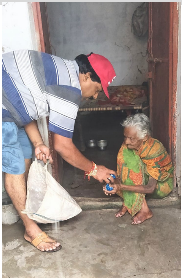
Distribution of relief items in Leprosy colony, Boudh, Odisha