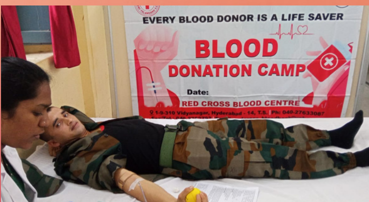
Blood donation camp, Vidyanagar, Hyderabad,Telangana