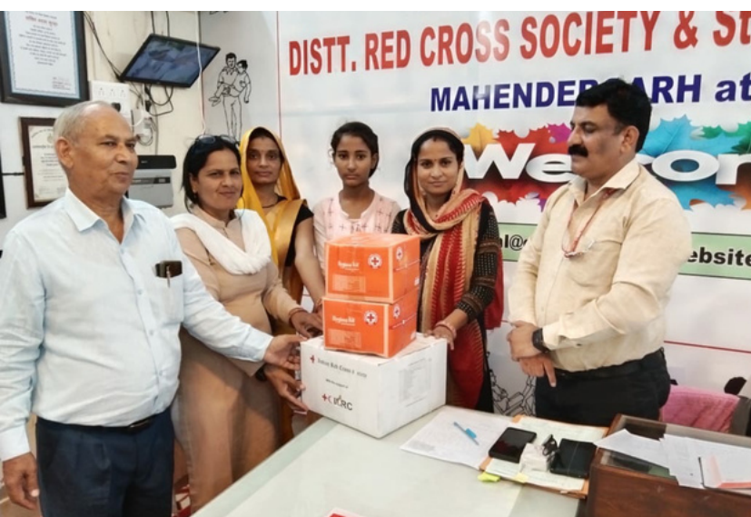
Distribution of hygienic kits & dinner sets amongst the needy at Mahendragarh, Narnaul, Haryana