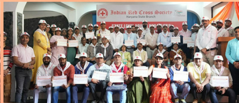
IRCS, Haryana State Branch organised three days state level youth Red Cross orientation workshop