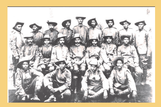
Image: Mahatma Gandhi in the center, middle row with other <u>#RedCross</u> volunteers during the Zulu revolt 1906