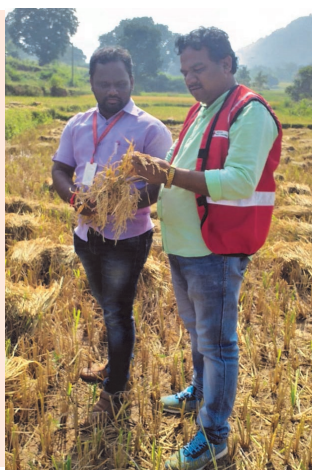
Monitoring of livelihood project at Koraput district of Odisha