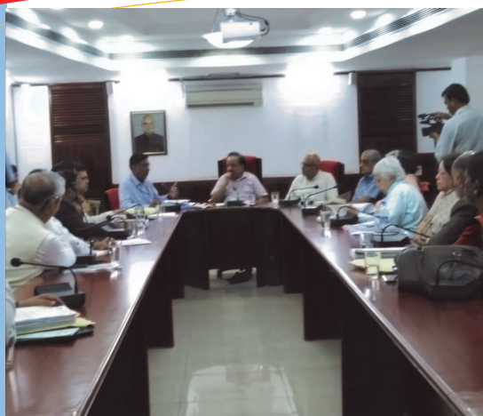
Extraordinary Meeting of the Managing Body (02 August, 2019) under the Chairmanship of Dr. Harsh Vardhan, Hon'ble Chairman, IRCS, NHQ (Hon'ble Minister of Health & Family Welfare)

The importance of First Aid doesn't end here. Our community level reach of volunteers gives us the opportunity to administer emergency aid in times of any eventuality.