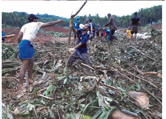
Indian Red Cross Volunteers - Kerala State and District Branches