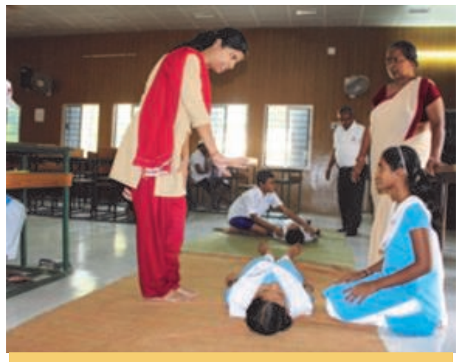
3 days First Aid training programme for the "DIBYANGA" especially for the Blind, 10-12 April 2019 in Bhubaneswar, Odisha