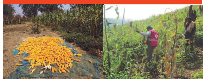
Harvesting of Maize at Walmpalli Village of Malkanagiri District, Odisha.