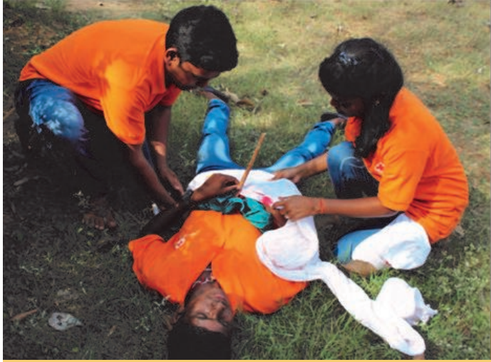
Two Days Basic First Aid training program organized by Odisha State Branch on 2nd and 3rd April 2019