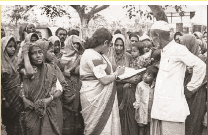
Smt. R.D Barkataki, a Minister in the 1977 Central Government became Gen Secretary of the branch and used to lead the Red Cross relief teams.

Suggestions and classic pictures are solicited from branches, members, volunteers and staff to make the exhibition interesting and meaningful. Please e mail us at nksingh@indianredcross.org