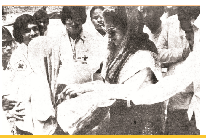
Then Prime Minister Ms. Indira Gandhi, distributed relief to families affected by internal strife in Assam in 1983