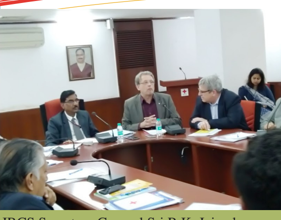
with ICRC and IFRC heads at State/UT Branches' Leadership meeting in March.

In March World Water Day was also observed and it was heartening to see some branches undertaking awareness activities on water conservation & safe water.