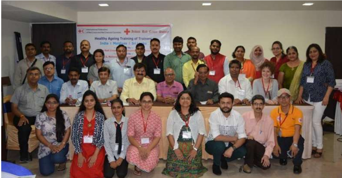
Group picture at the last day of the training along with the state branch