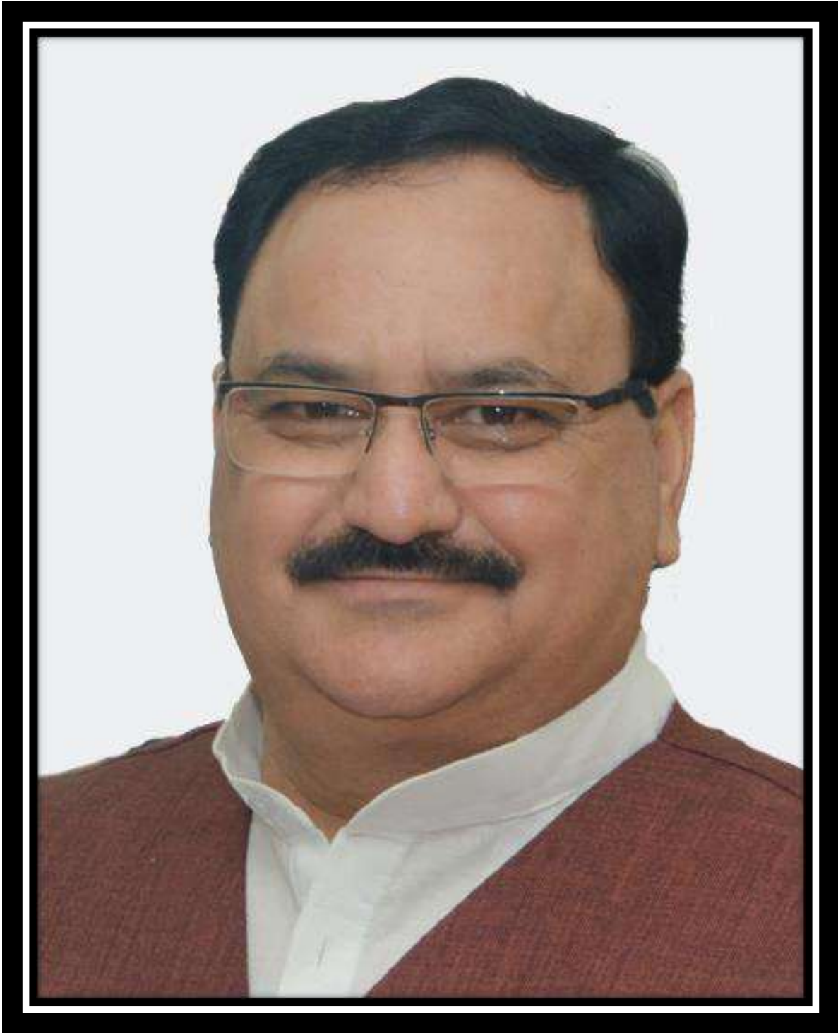
Shri J P Nadda, Chairman