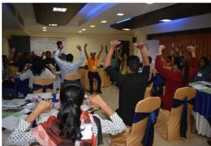
Participants practicing Healthy Ageing tool during the training (

The Training of Trainers for Healthy Ageing for India, Sri Lanka and Maldivian National Societies took place from 27 th to 29 th April, 2017 in Ahmedabad, Gujarat. It was hosted by Gujarat state branch of the Indian Red Cross Society with the support of the International Federation of Red Cross and Red Crescent Societies (IFRC). Total 24 staff and volunteers participated in this training. In the programme 20 participants from 12 state branches (Gujarat, Maharashtra, Karnataka, Uttarakhand, Assam, Tripura, Manipur, Meghalaya, Goa, Andhra Pradesh, Telangana and Andaman & Nicobar and NHQ), two from the Maldivian Red Crescent, one from the Sri Lanka Red Cross and one from IFRC participated. The training was based on the toolkit developed by the IFRC in close partnership with Pfizer (a leading pharmaceutical company) and subject matter experts. This training was the second global training conducted by the IFRC after the first one by the Montenegro Red Cross.