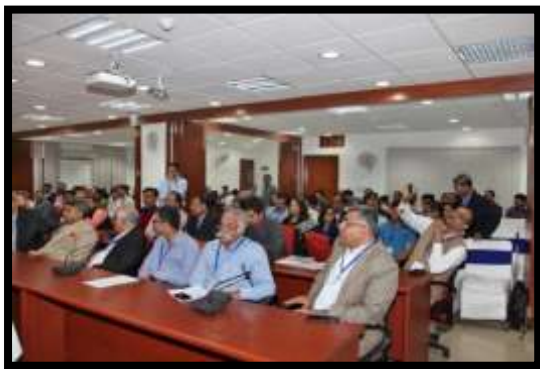
Alumni students during alumni meet